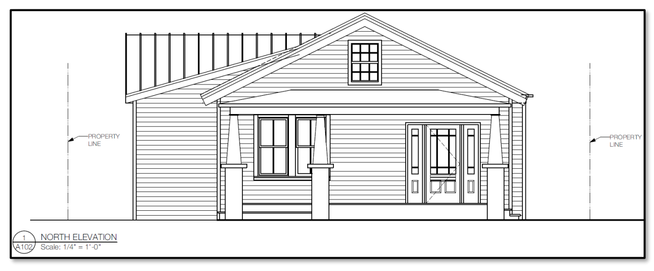
814 Catherine Street – Proposed North Elevation

Based on the plans submitted, the proposed design would require variances to the following dimensional requirements: