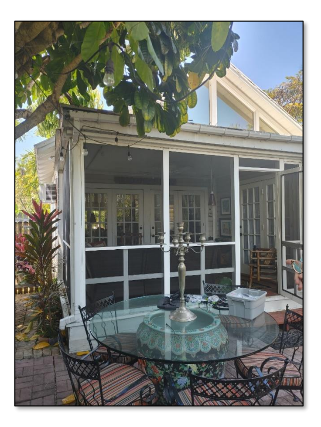
814 Catherine Street -The existing screened porch would be enclosed and included in the proposed addition to convert into kitchen space.