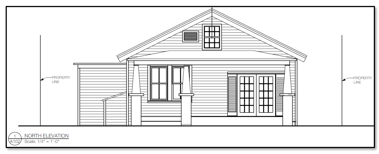
814 Catherine Street – Existing North elevation