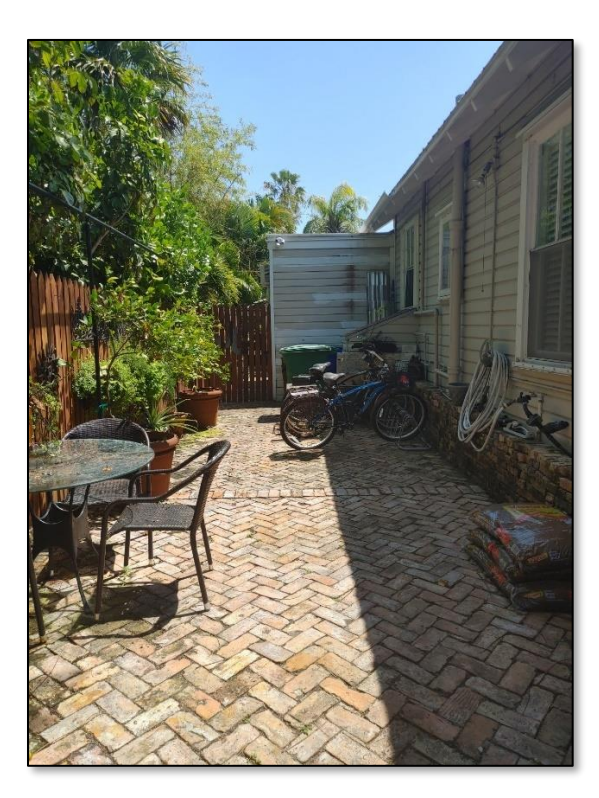
814 Catherine Street – A proposed addition connecting to the front of the side addition for a bathroom space.