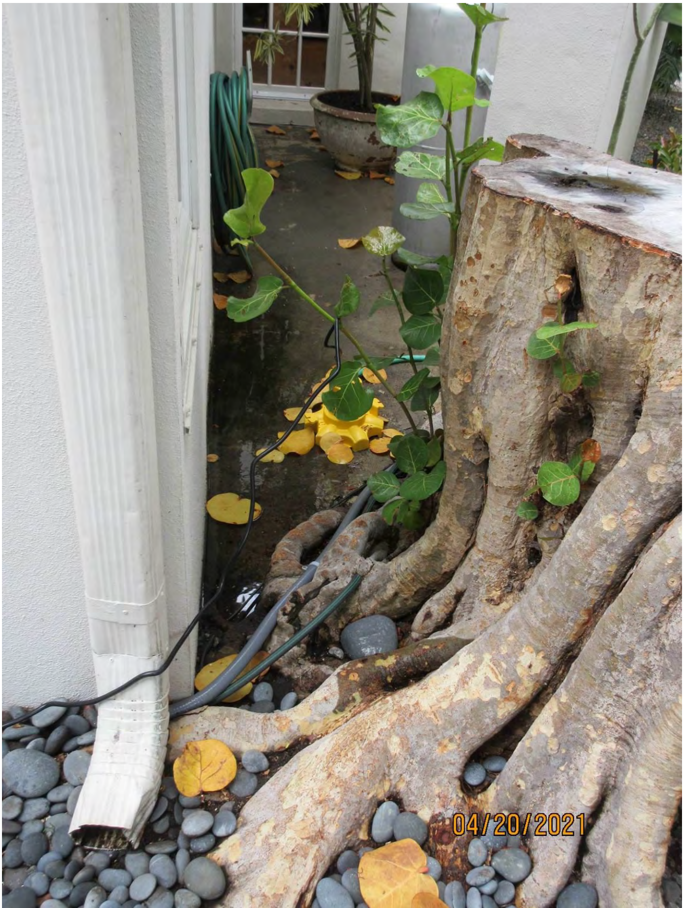
Area where water does not drain due to tree roots (yellow object is a pump used to remove the water).