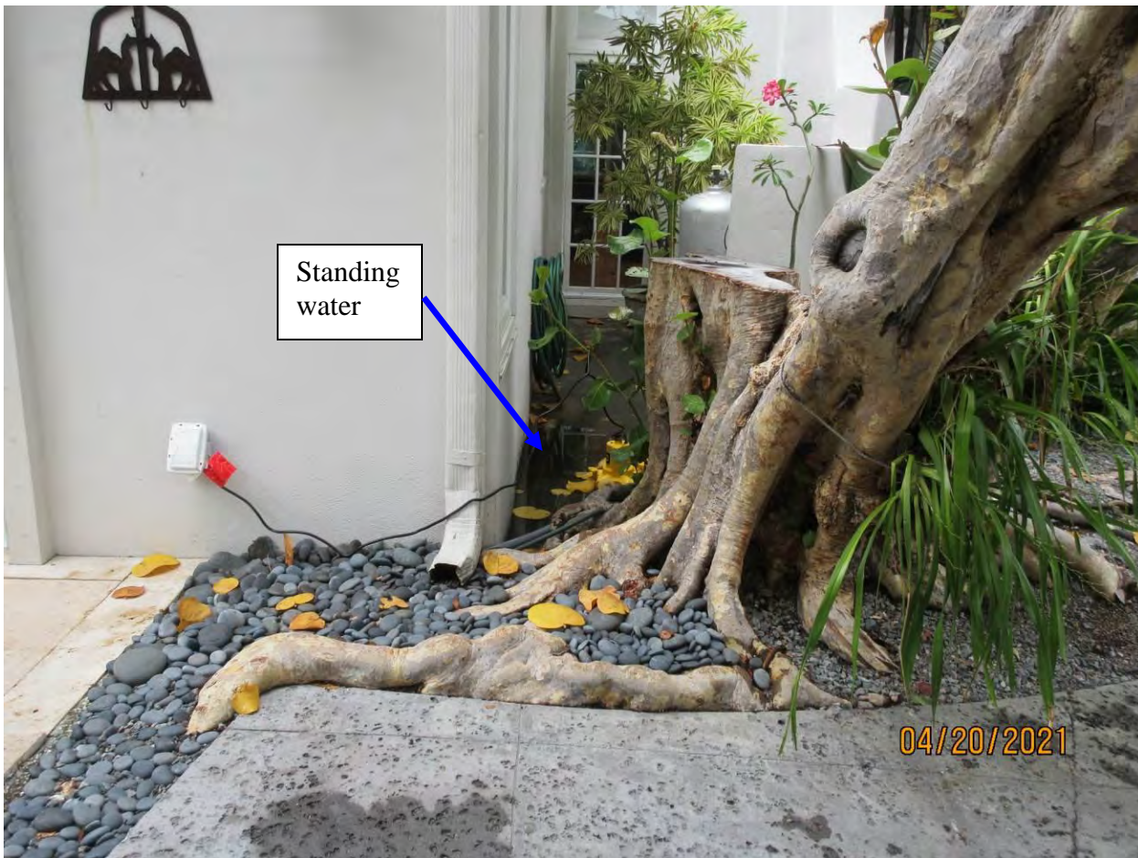
Photo showing tree trunks including the remaining stump from trunk removed, and base of tree in relation to house, view 1.