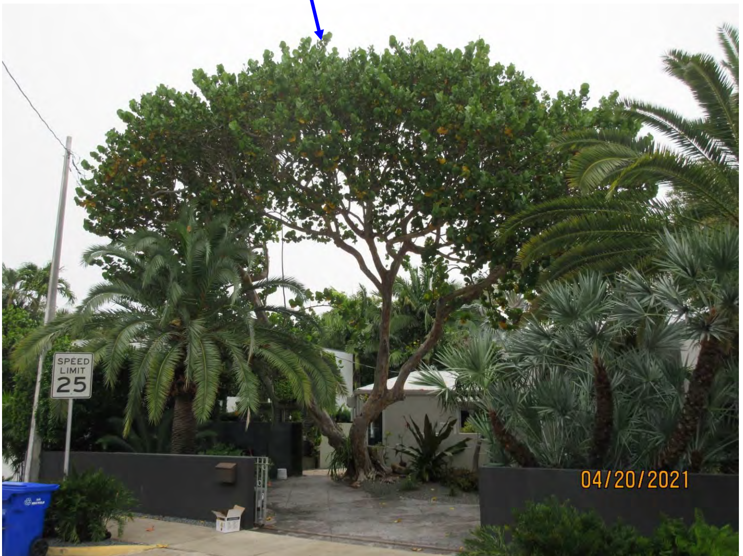
Photo of entire tree showing its location on the property.

Tree Species: Sea Grape ( Coccoloba uvifera )