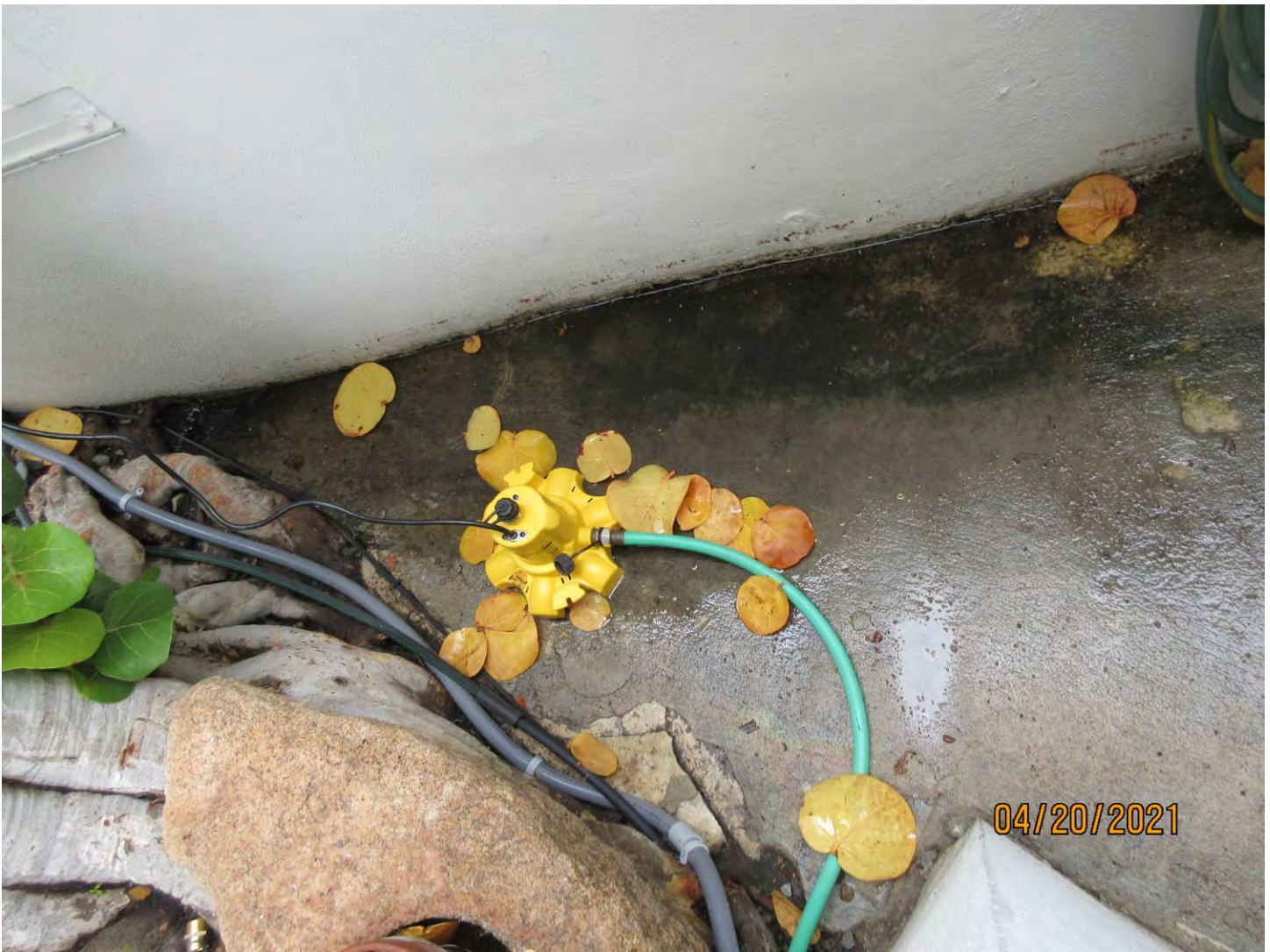
Overhead view of tree roots, corner of structure and standing water area, view 2. Yellow object is a pump being used to remove standing water.