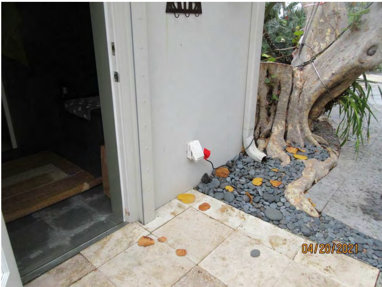
Photo showing base of tree and roots in relation to structure. Note tile damage inside room.