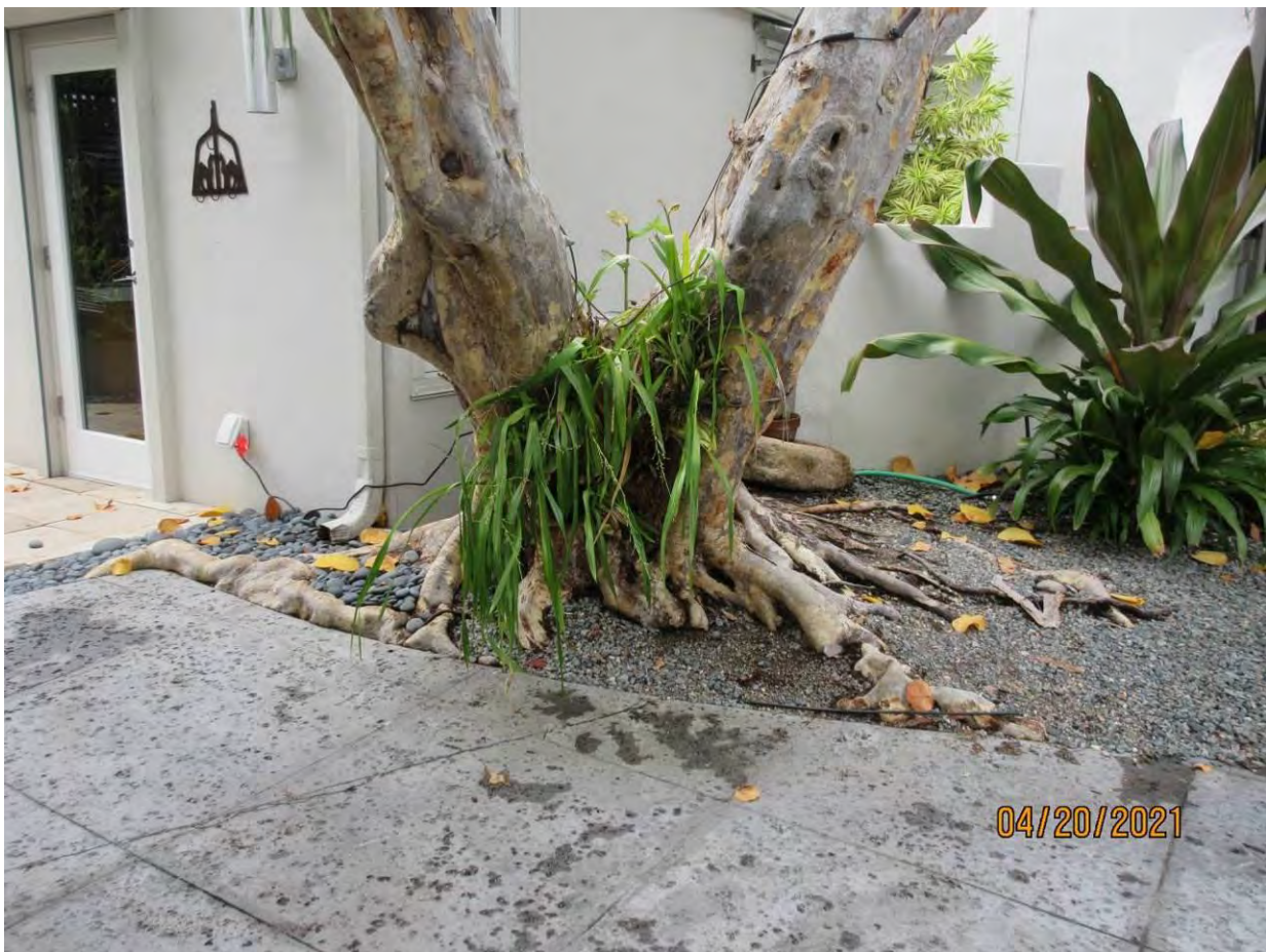
Photo of trunks and base of tree, view 2.