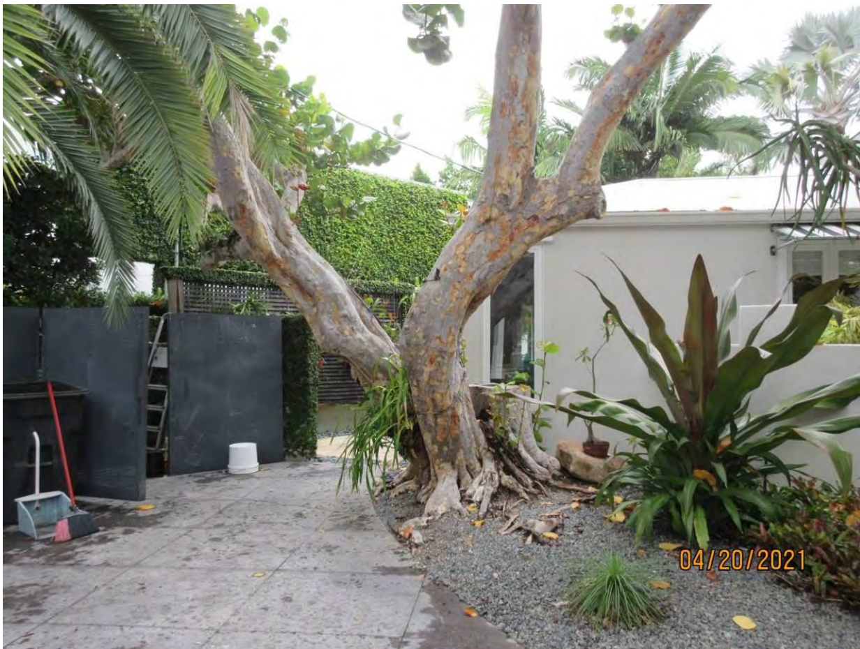
Photo of trunks and base of tree, view 1.