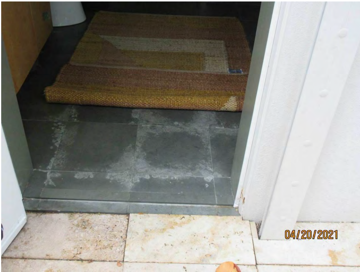
Damaged tiles in room next to tree.