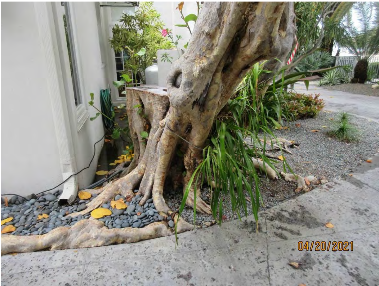
Photo showing tree trunks including the remaining stump from trunk removed, and base of tree in relation to house, view 2.