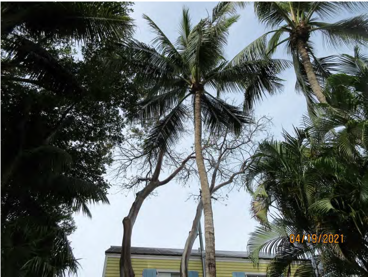
Photo showing tree canopy, view 1.