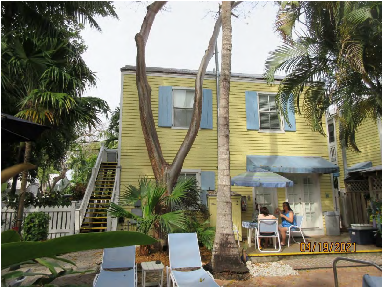
Photo of tree trunks, view 1.