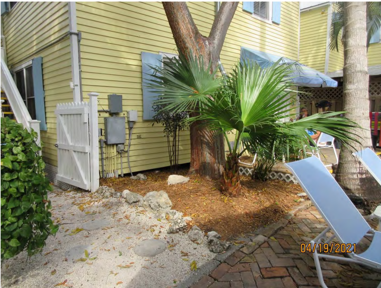
Photo of tree trunk, view 1.