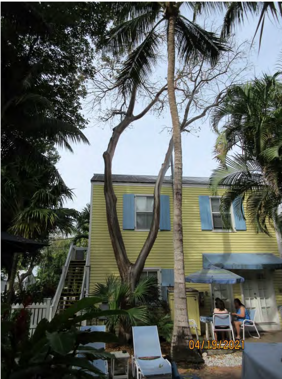
Photo of whole tree showing location on property.

Tree Species: Gumbo Limbo ( Bursera simaruba )