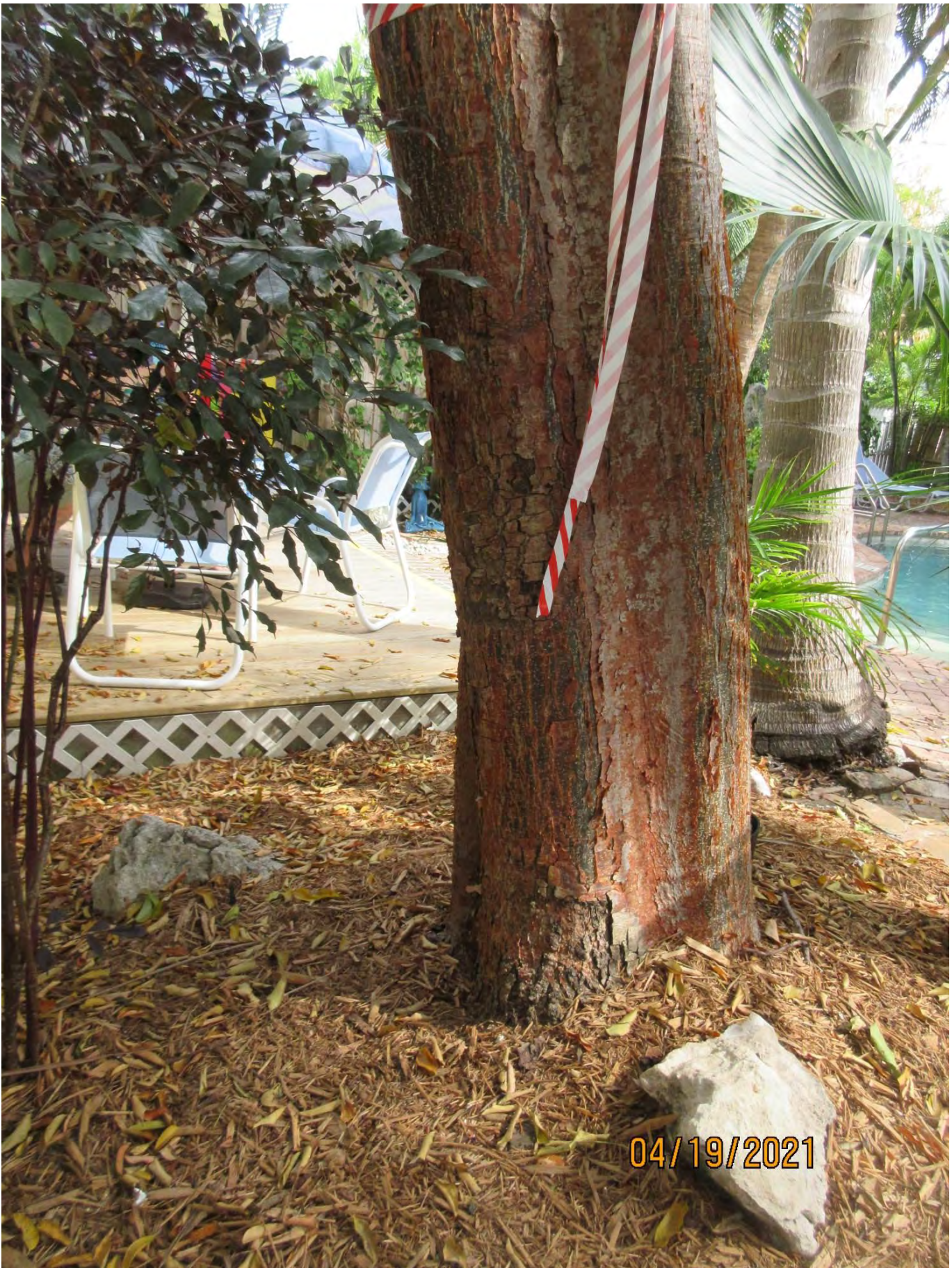
Photo showing base of tree.