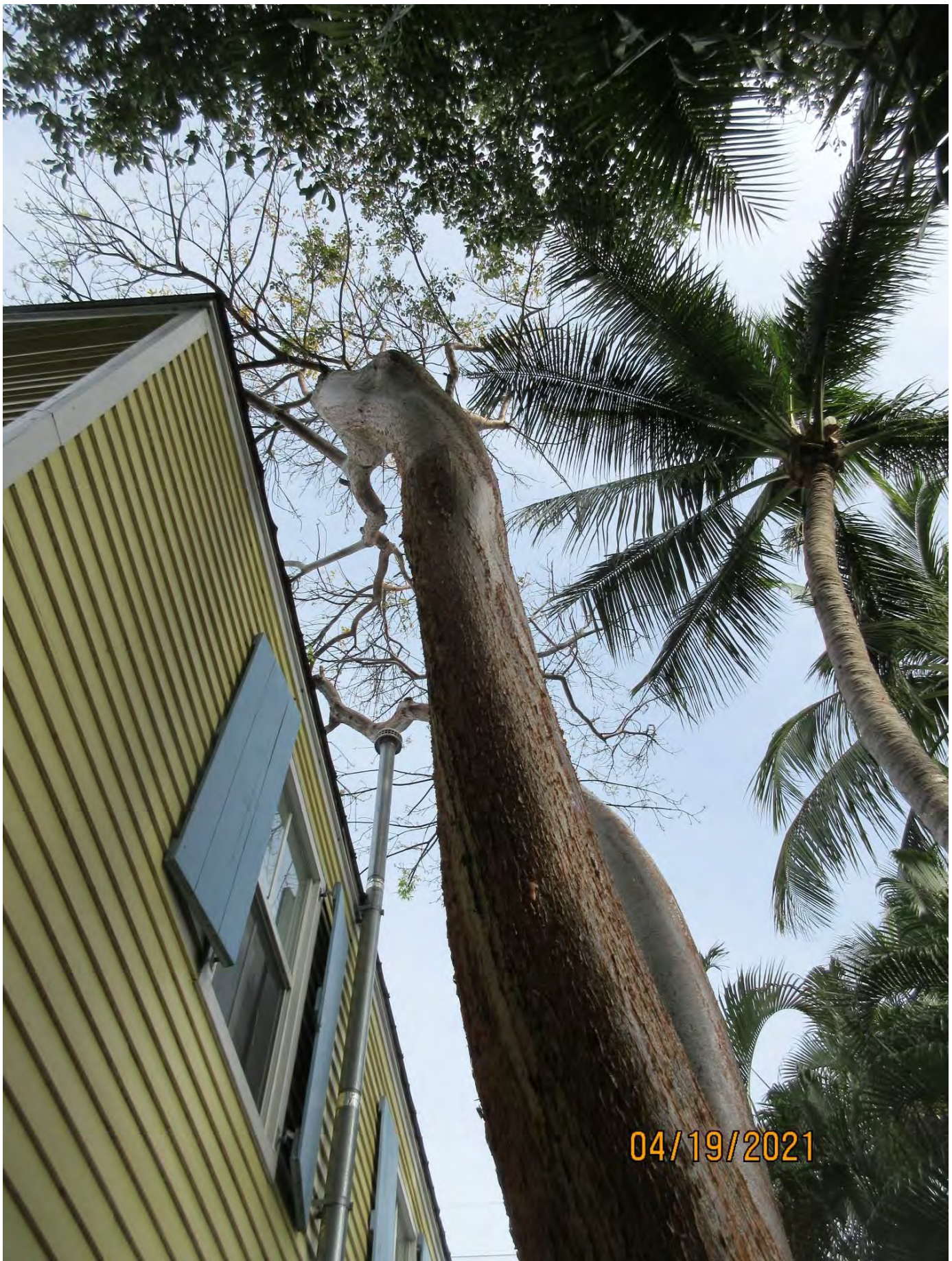
Photo looking up at tree trunks and canopy.