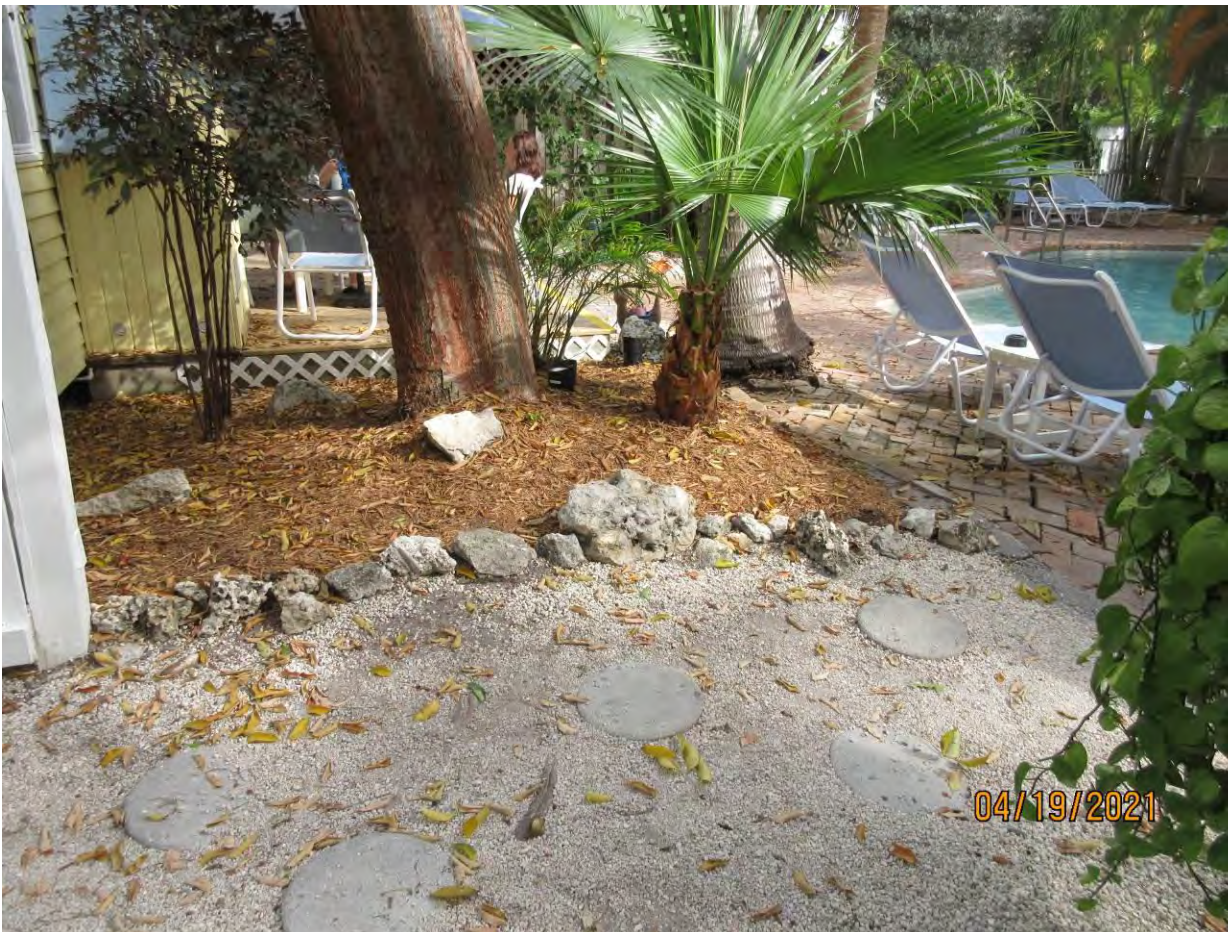
Photo of tree trunk, view 2. Note location of tree in relation to structure.