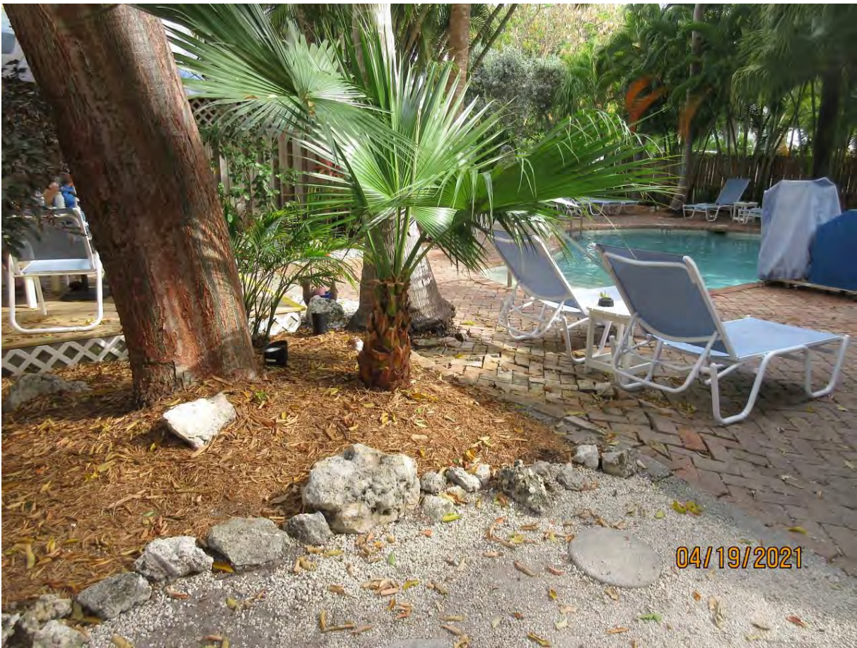
Two photos showing area where underground electrical conduit is located, as per property owner.