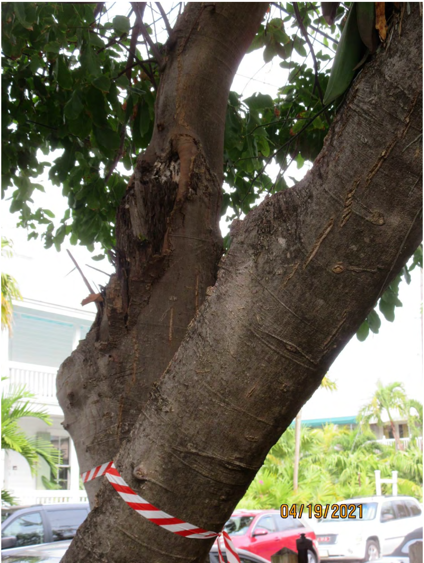
Photo of trunk 2 and 3, view 1.