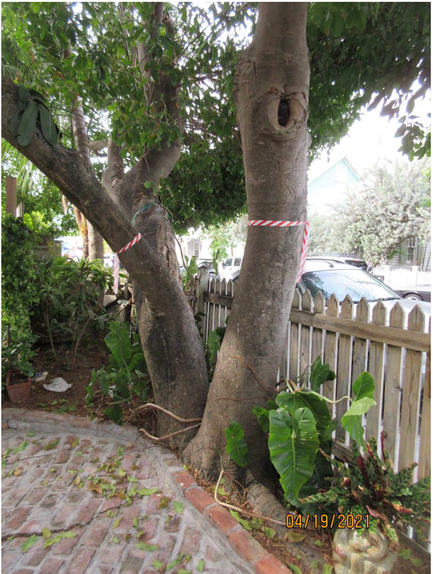
Photo of base of tree and trunks.