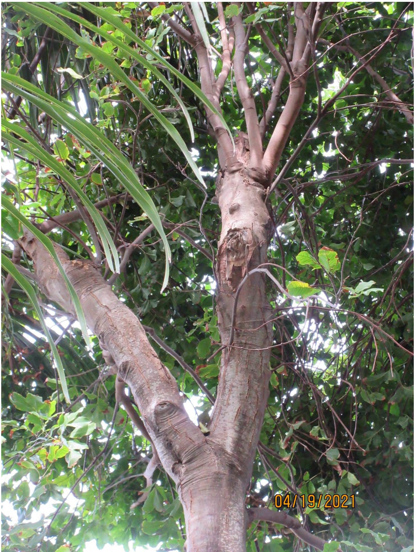
Photo of tree canopy, view 1.