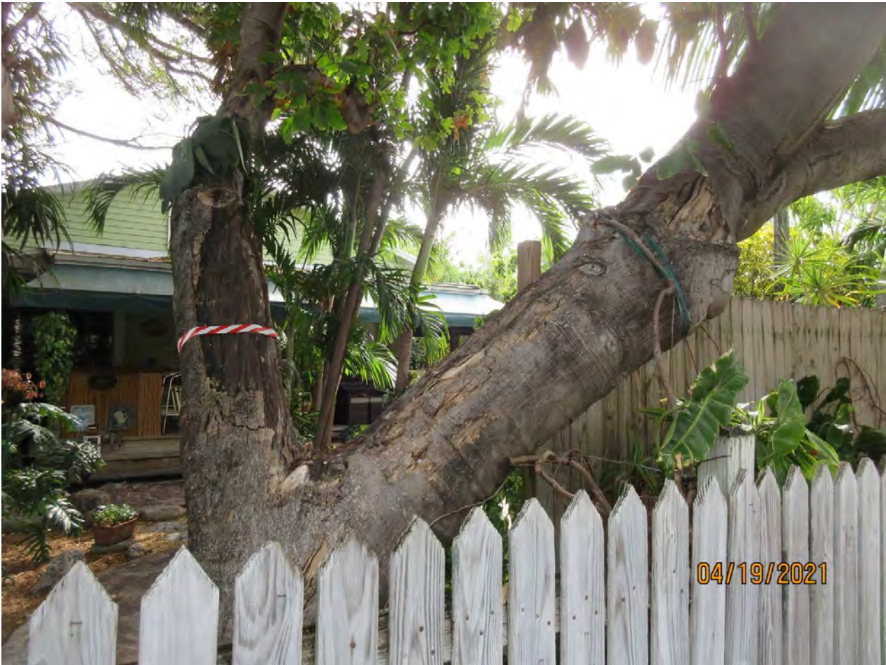
Photo showing trunks 1 and 2, view 1.