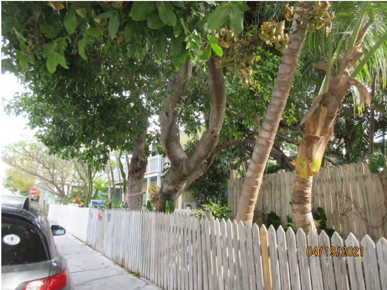
Standing on sidewalk looking at tree trunks, view 1.