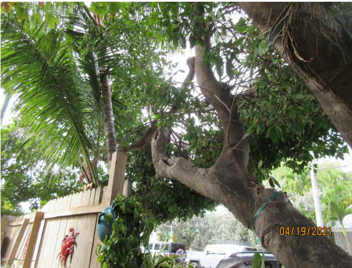
Photo showing trunk and canopy area of trunk 1.