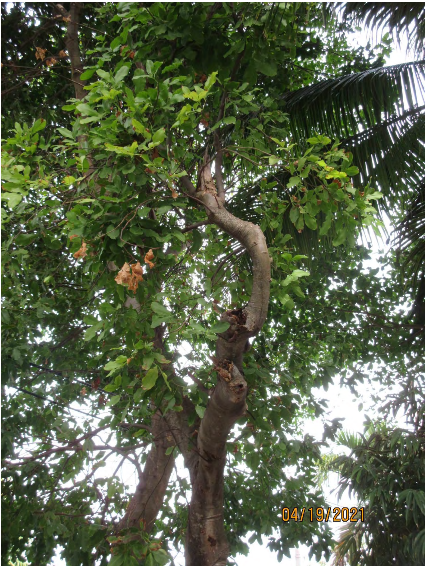
Photo of tree canopy, view 3.