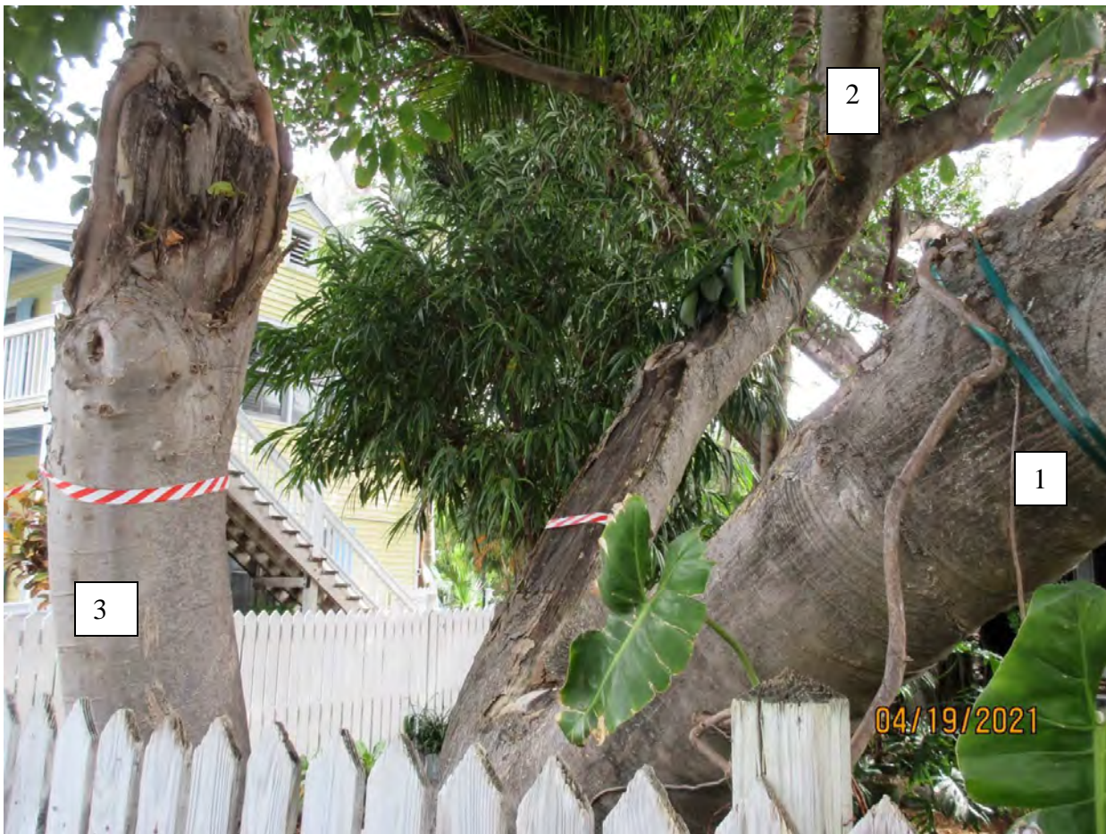
Standing on sidewalk looking at tree trunks, view 2.