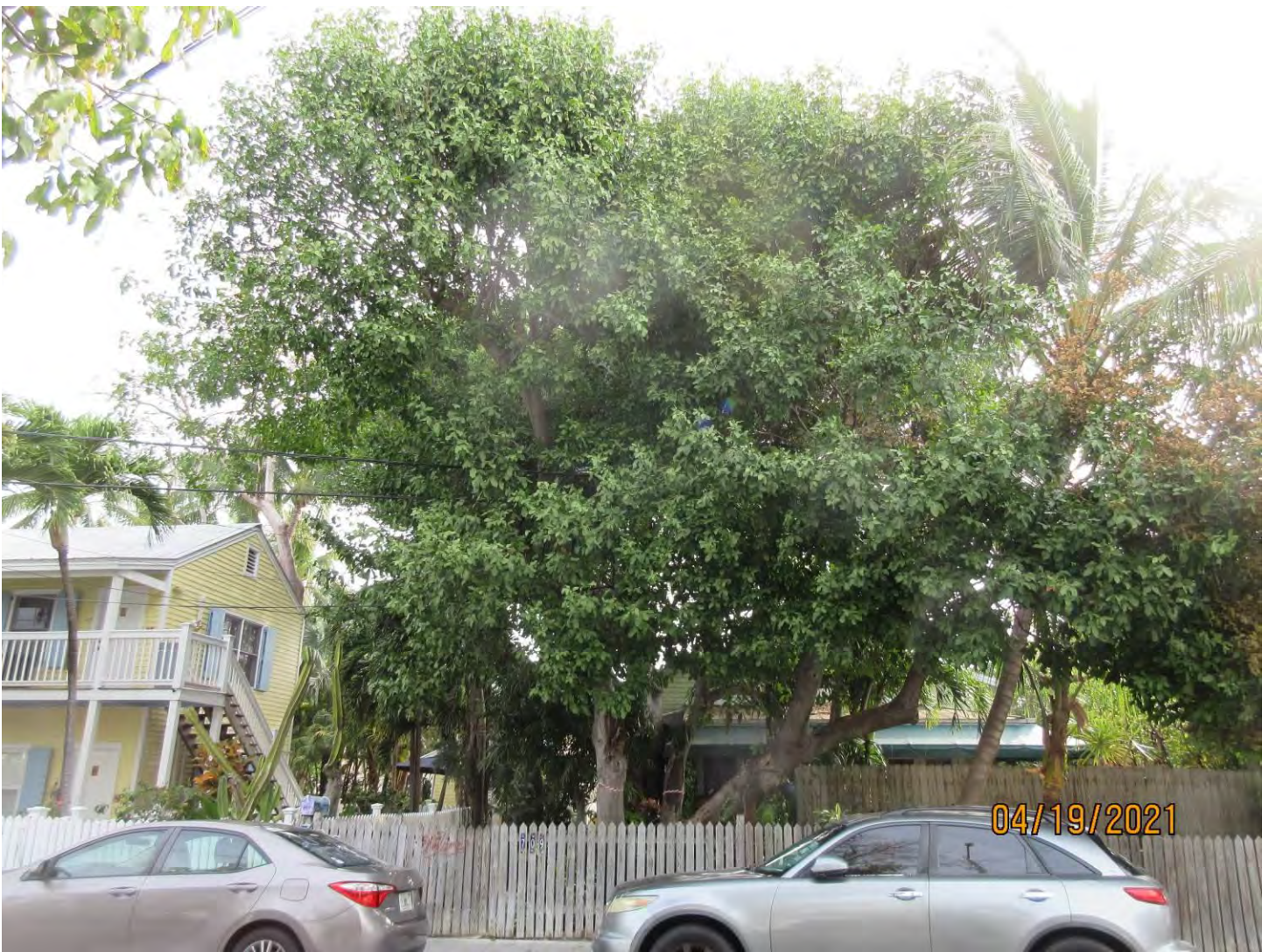
Photo showing location of tree, view 1.

Tree Species: Spanish Lime ( Melicoccus bijugatus )