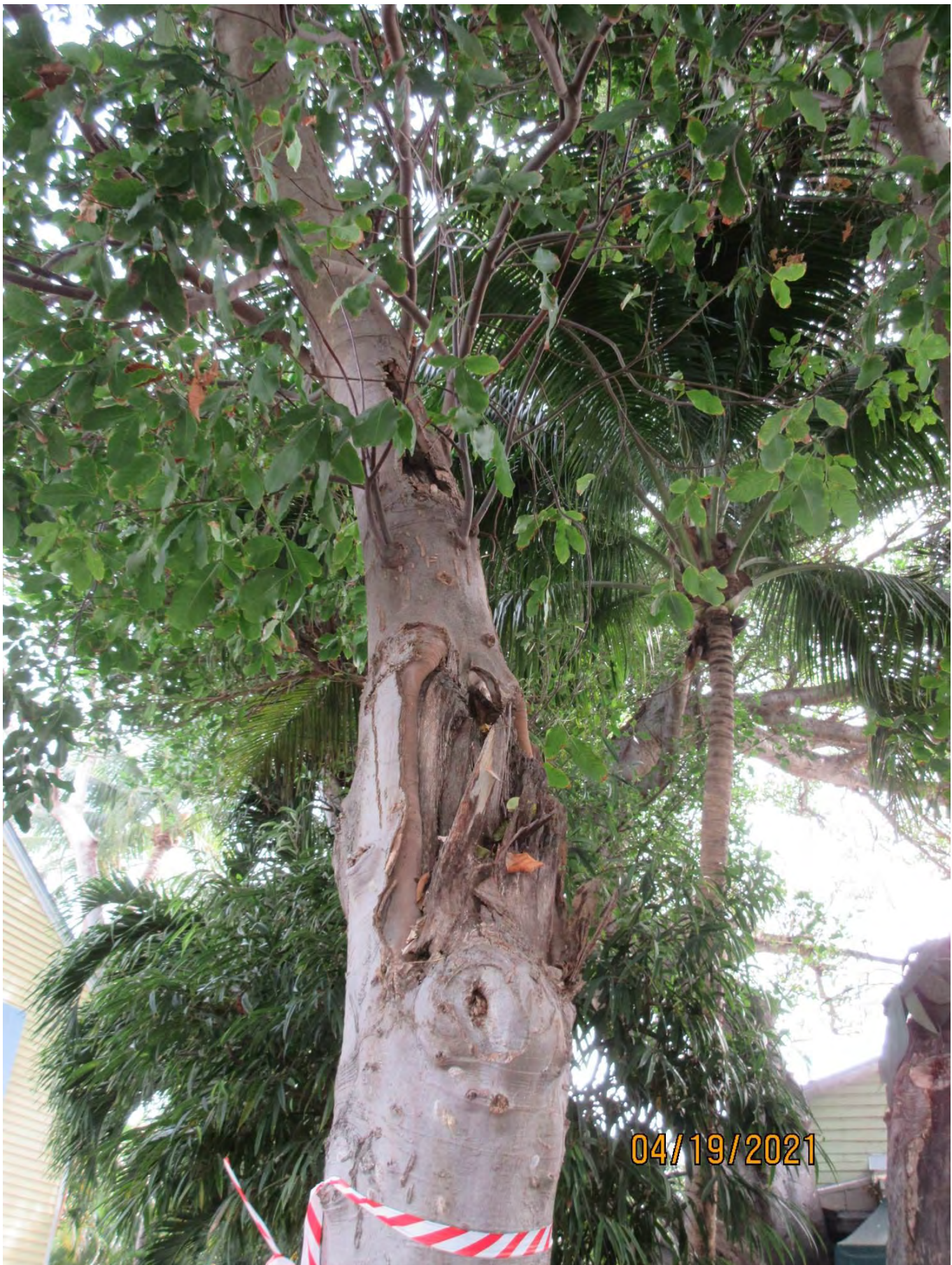
Photo showing trunk decay in trunk 3, view 1.