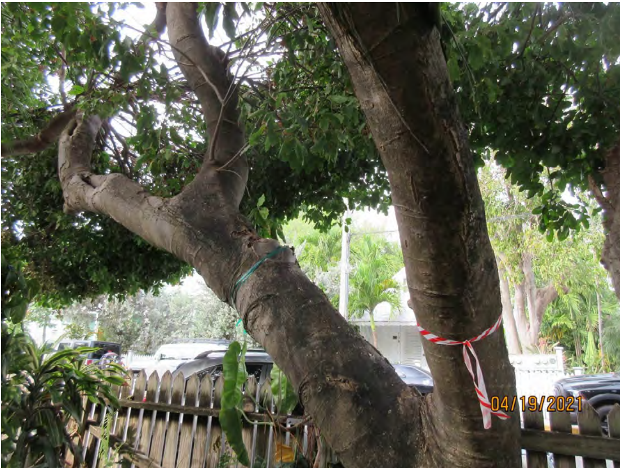
Photo showing trunks 1 and 2, view 2.