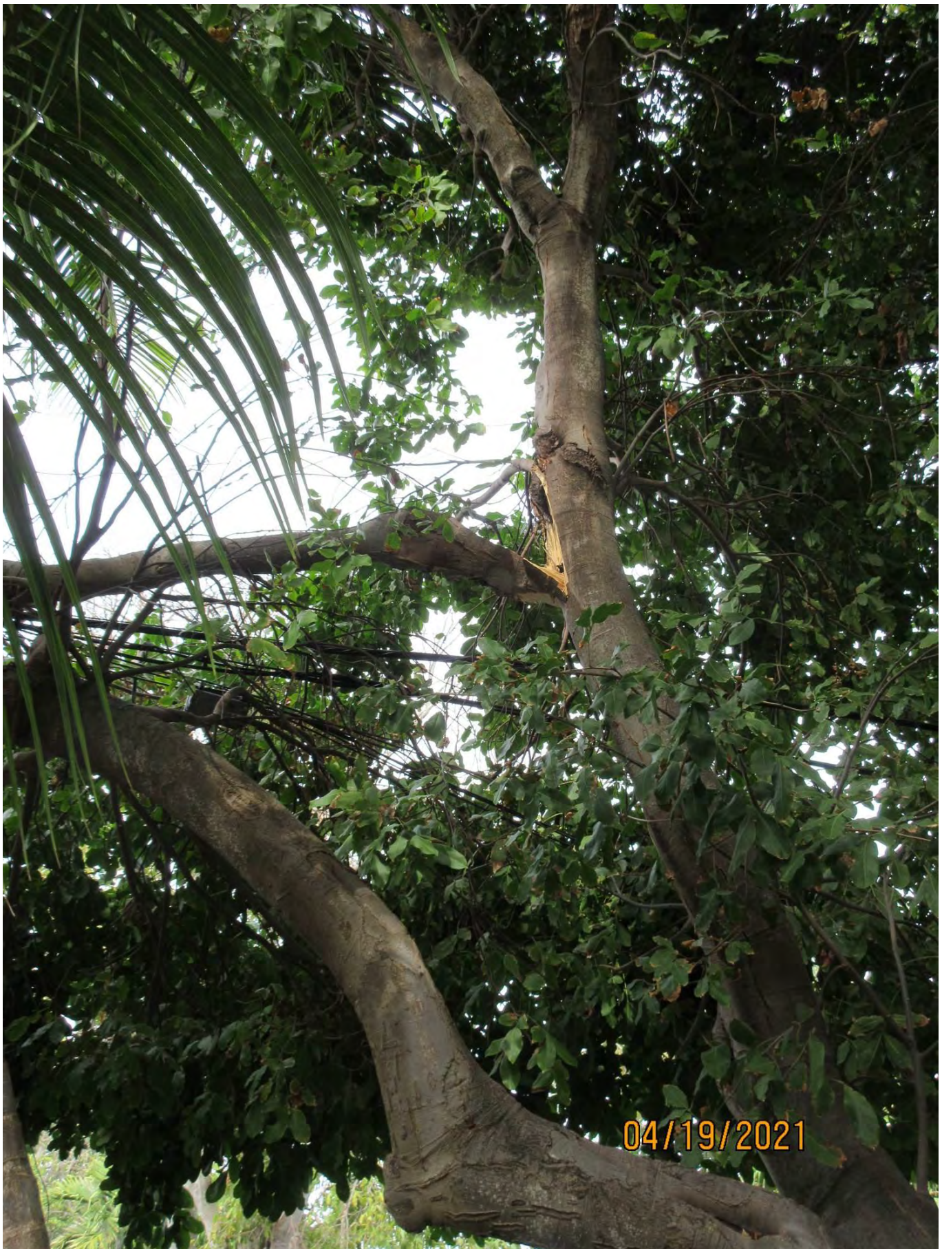
Photo of tree canopy, view 2. Note broken branch.