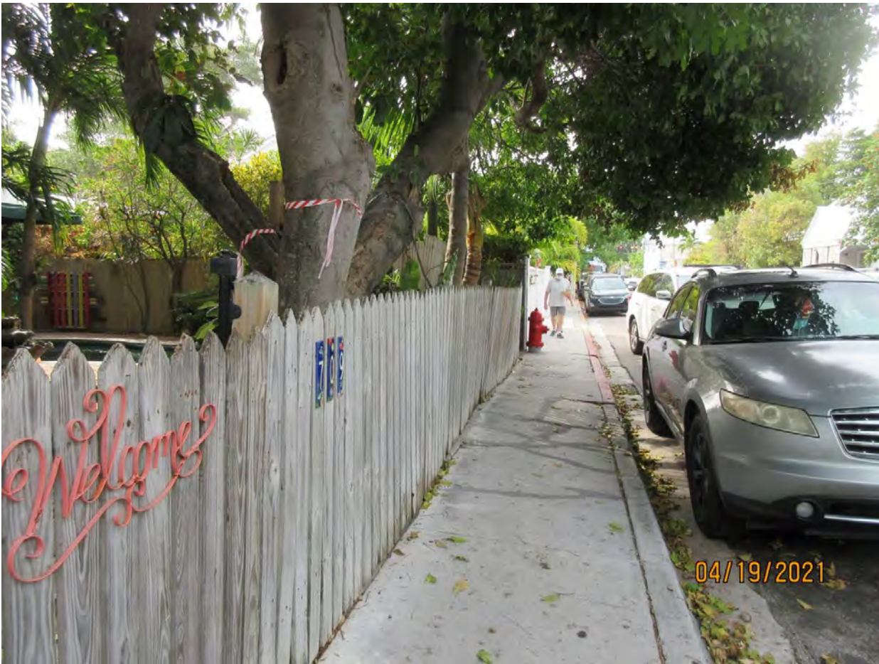
Standing on sidewalk looking at tree trunks, view 3.