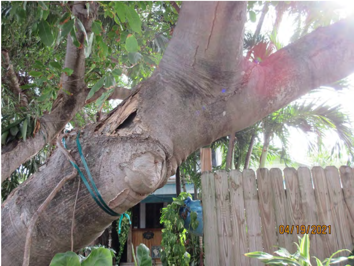
Photo showing trunk decay in trunk 1.