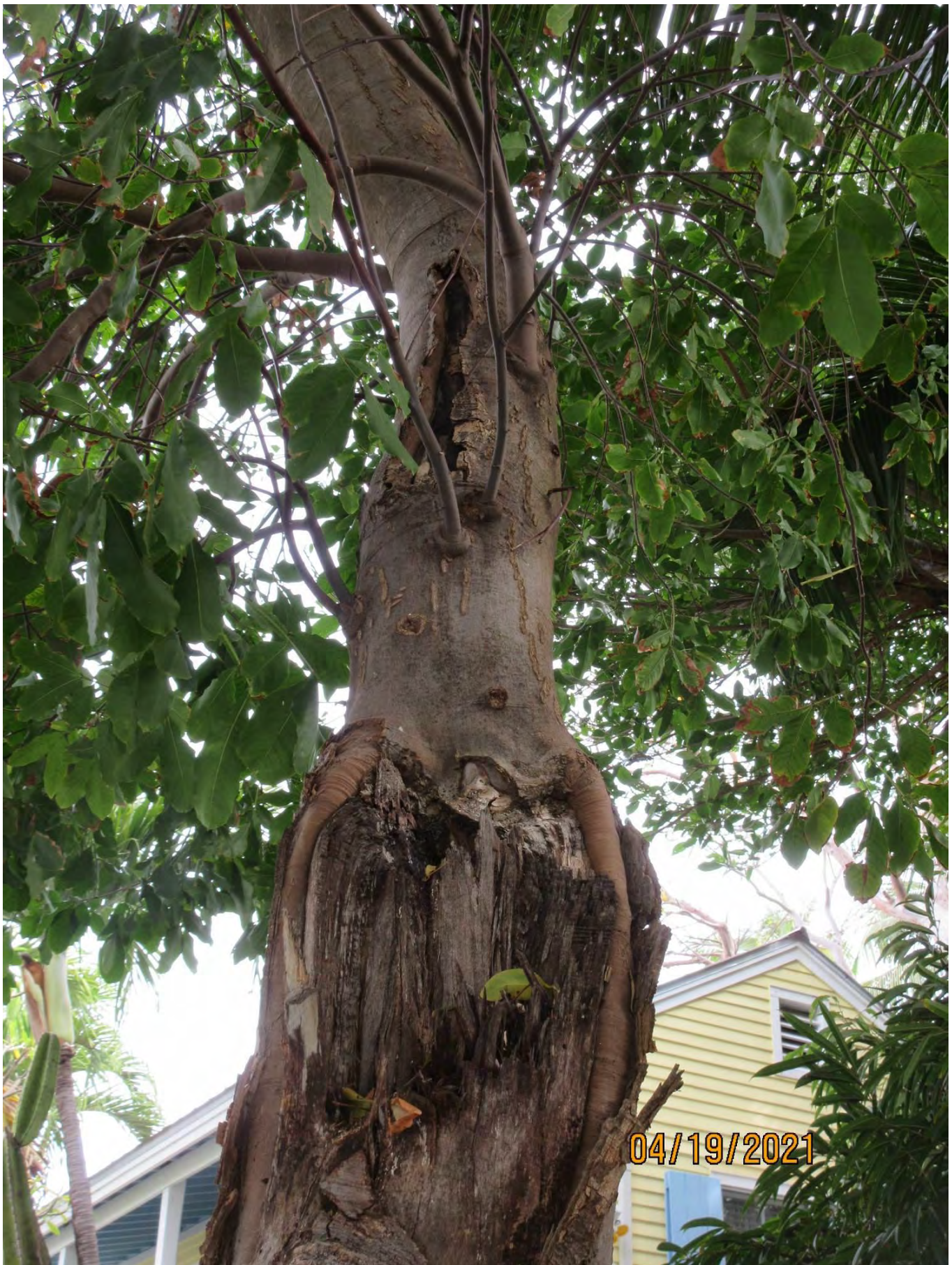
Photo showing trunk decay in trunk 3, view 2.