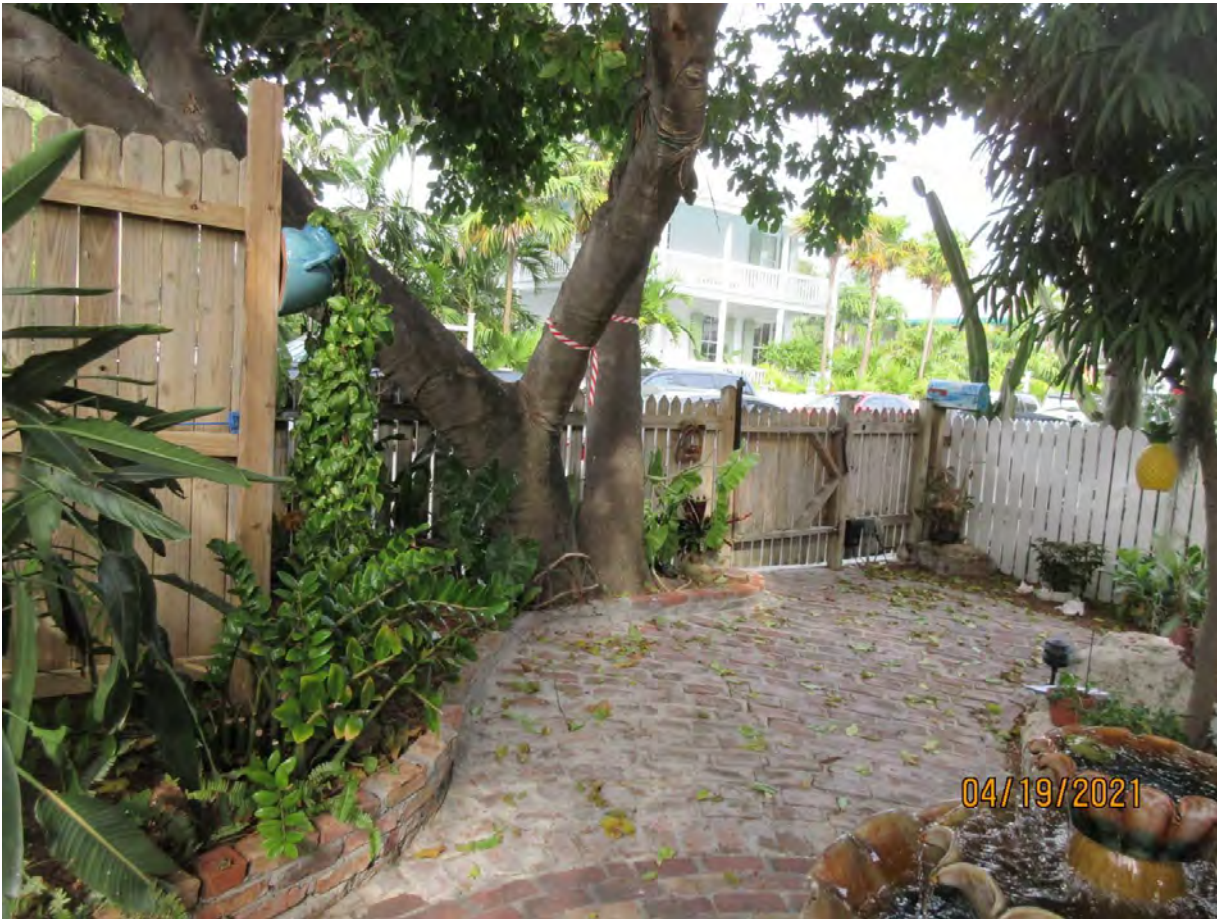
Photo showing location of tree, view 2.