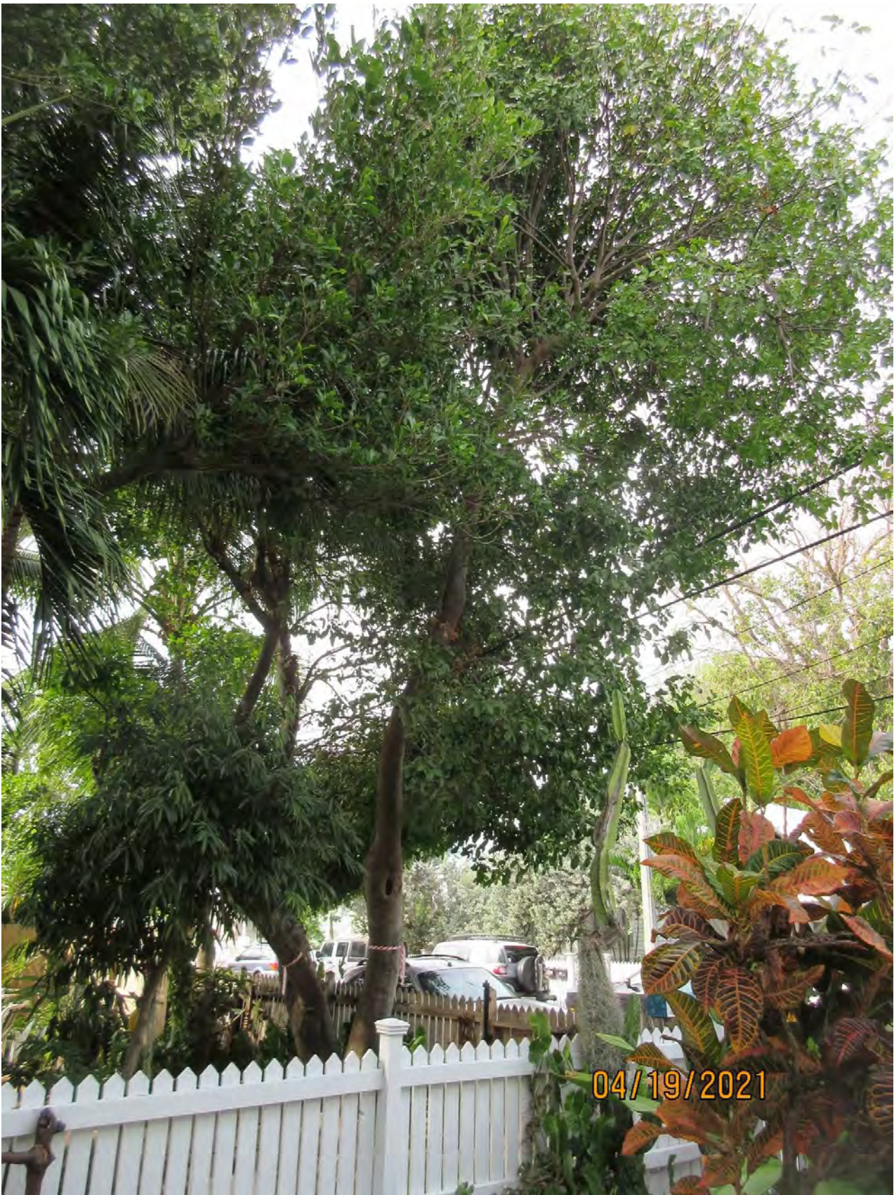
Photo showing entire tree, view 2.