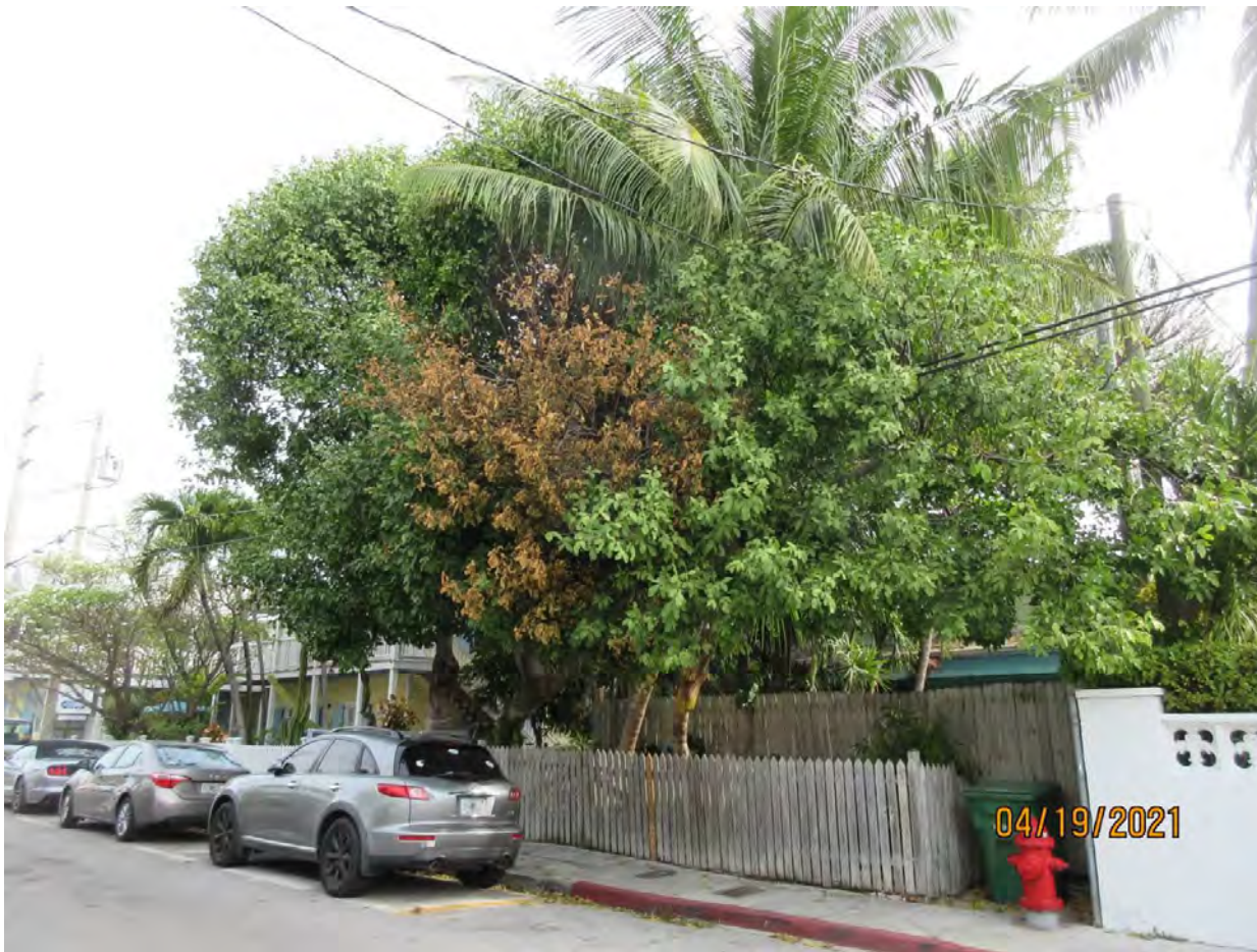
Photo of entire tree, view 1. Note brown area in canopy is from a broken branch.