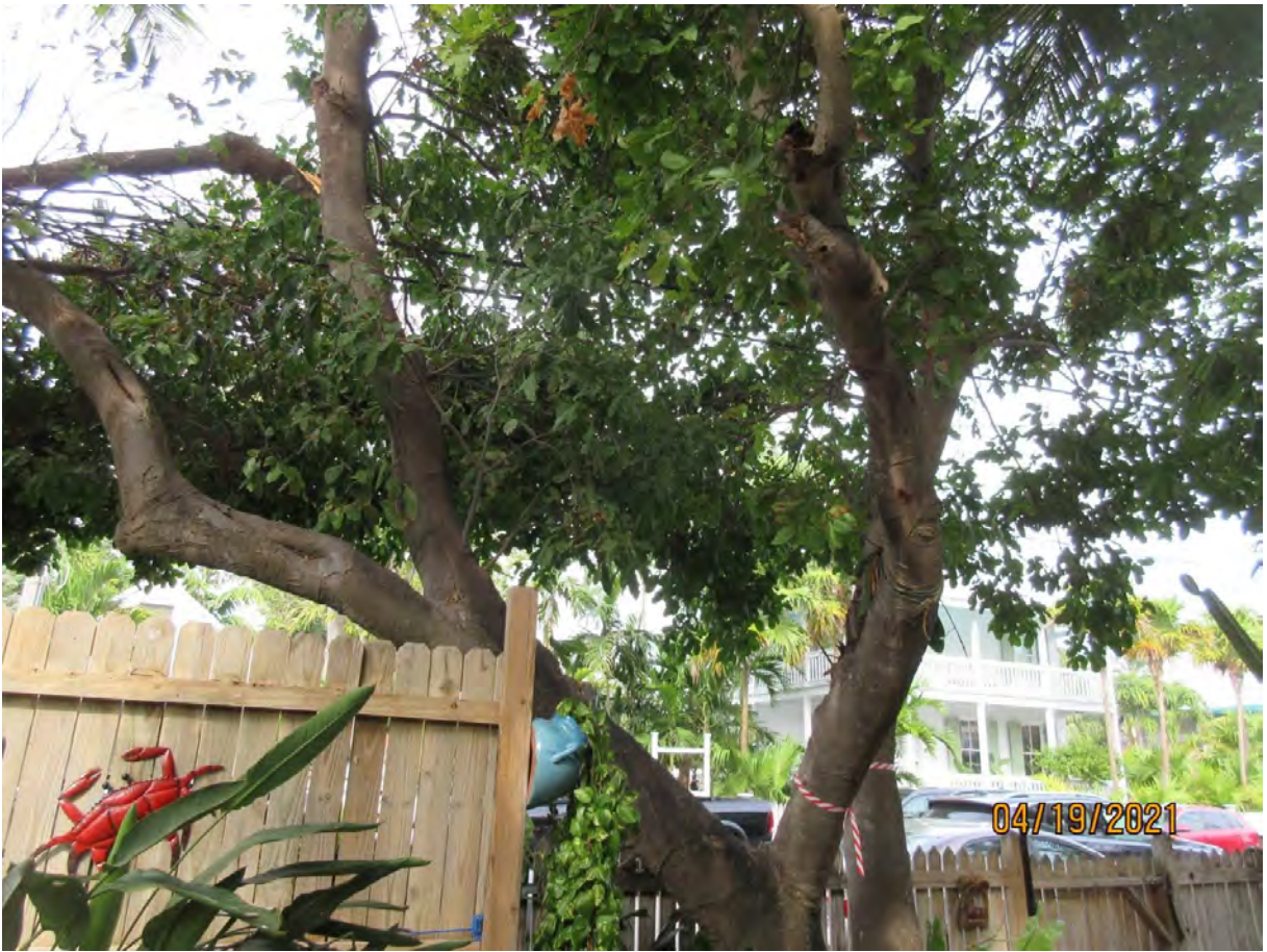
Photo showing tree trunks and most of canopy.