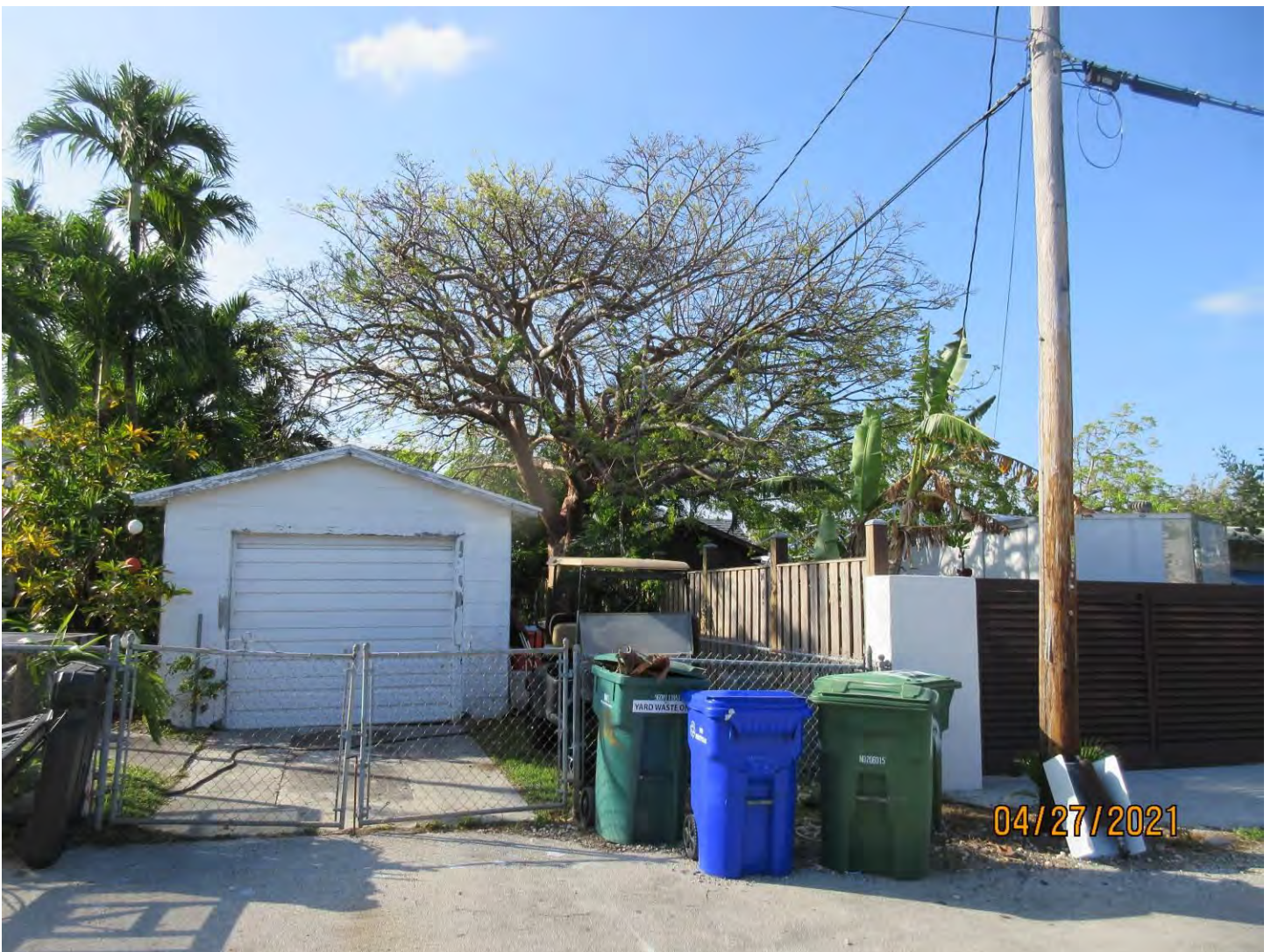
Photo showing location of tree, view 1.

Tree Species: Gumbo Limbo ( Bursera simaruba )