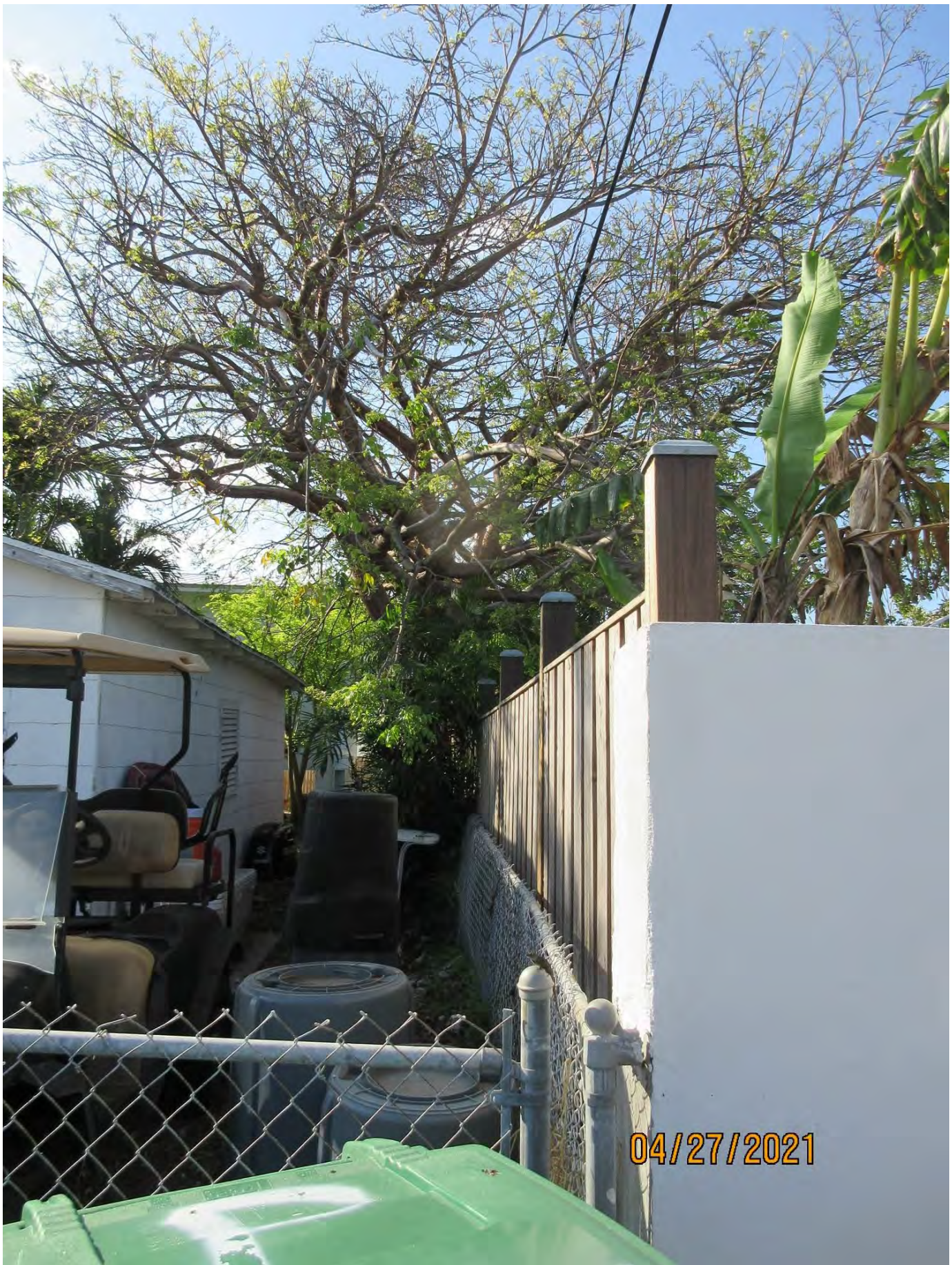
Photo showing location of tree, view 2.