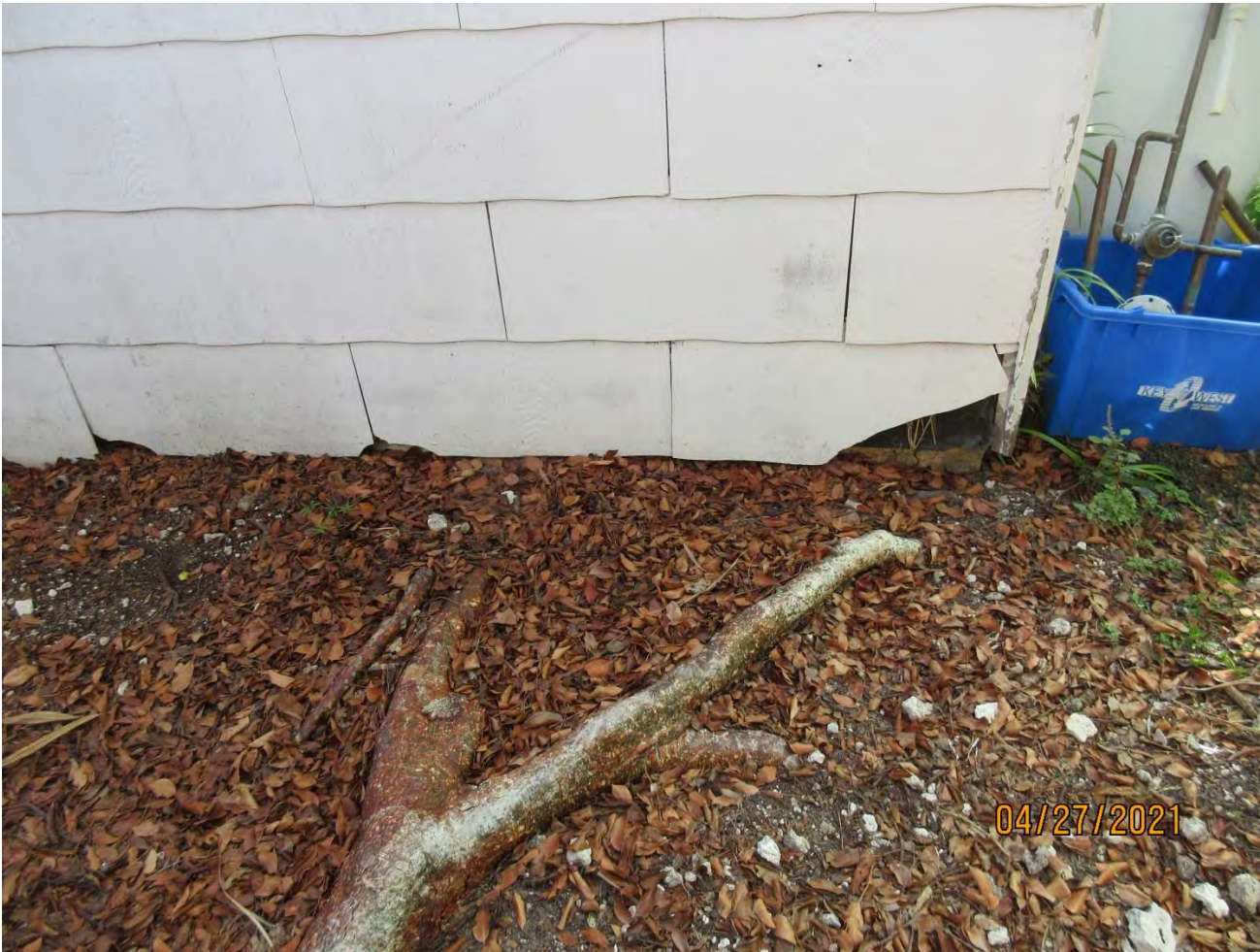
Photo showing proximity of roots and garage structure.