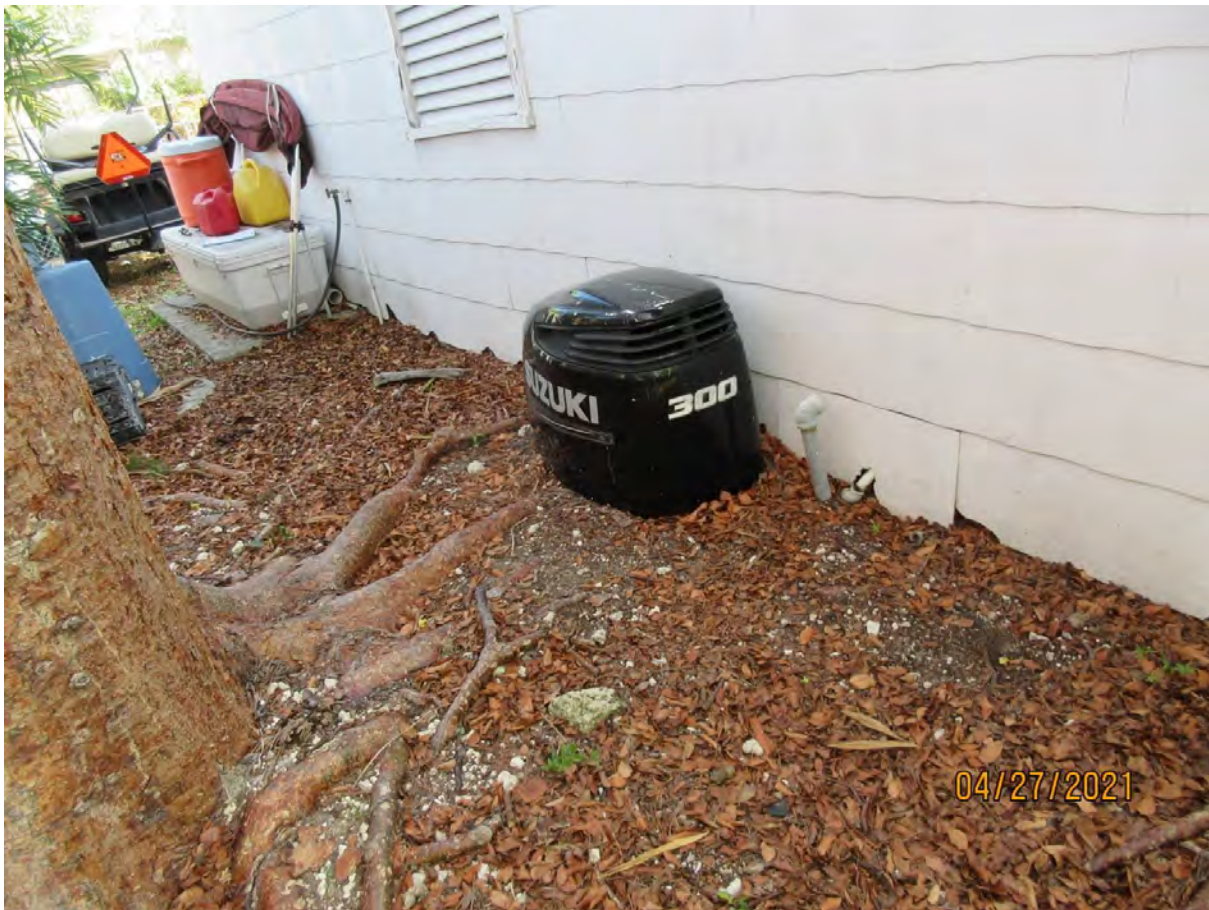
Two photos showing surface root system in relation to garage structure.