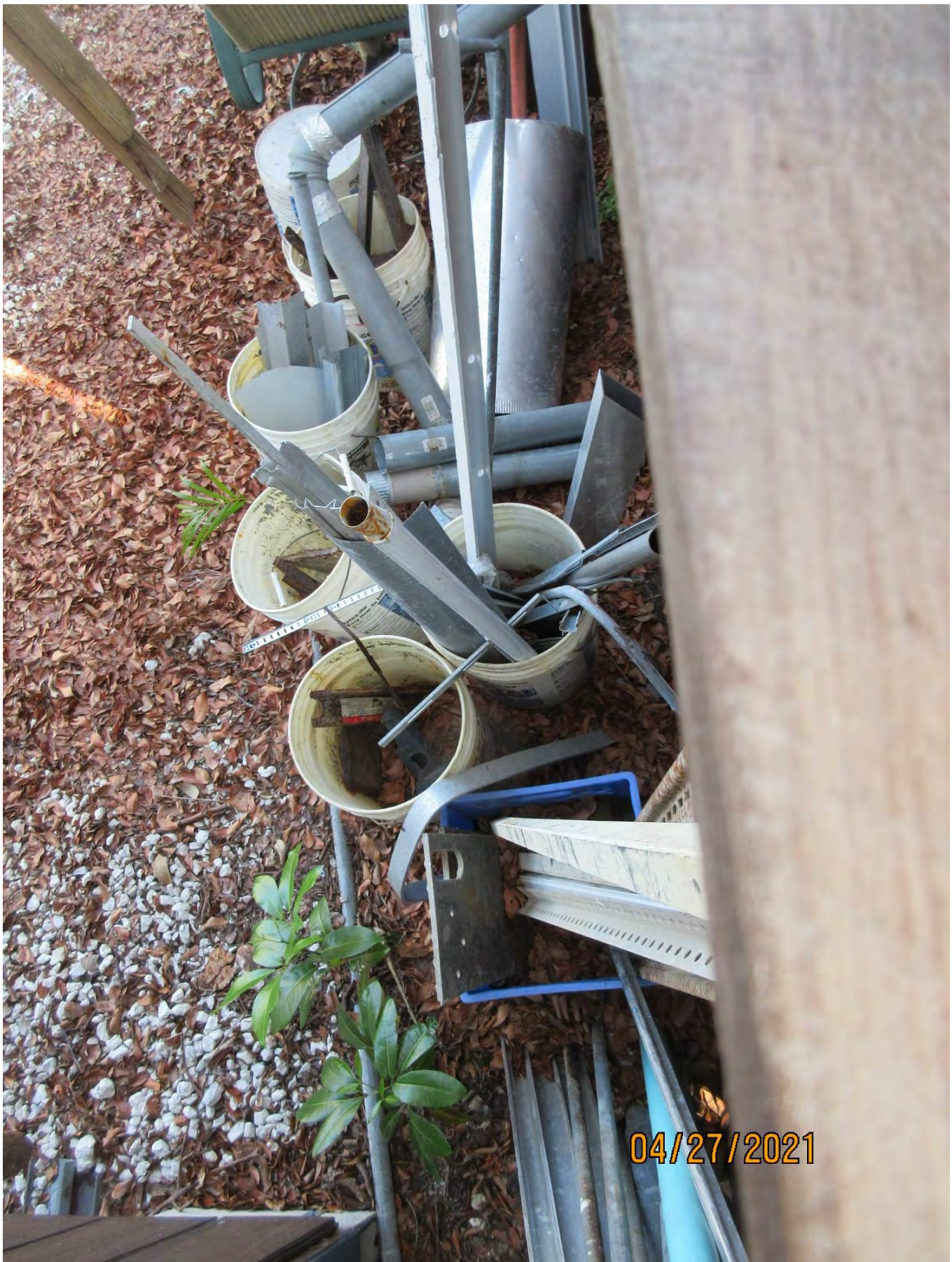
Photo looking over the fence at neighbors property and rest of root system for tree.