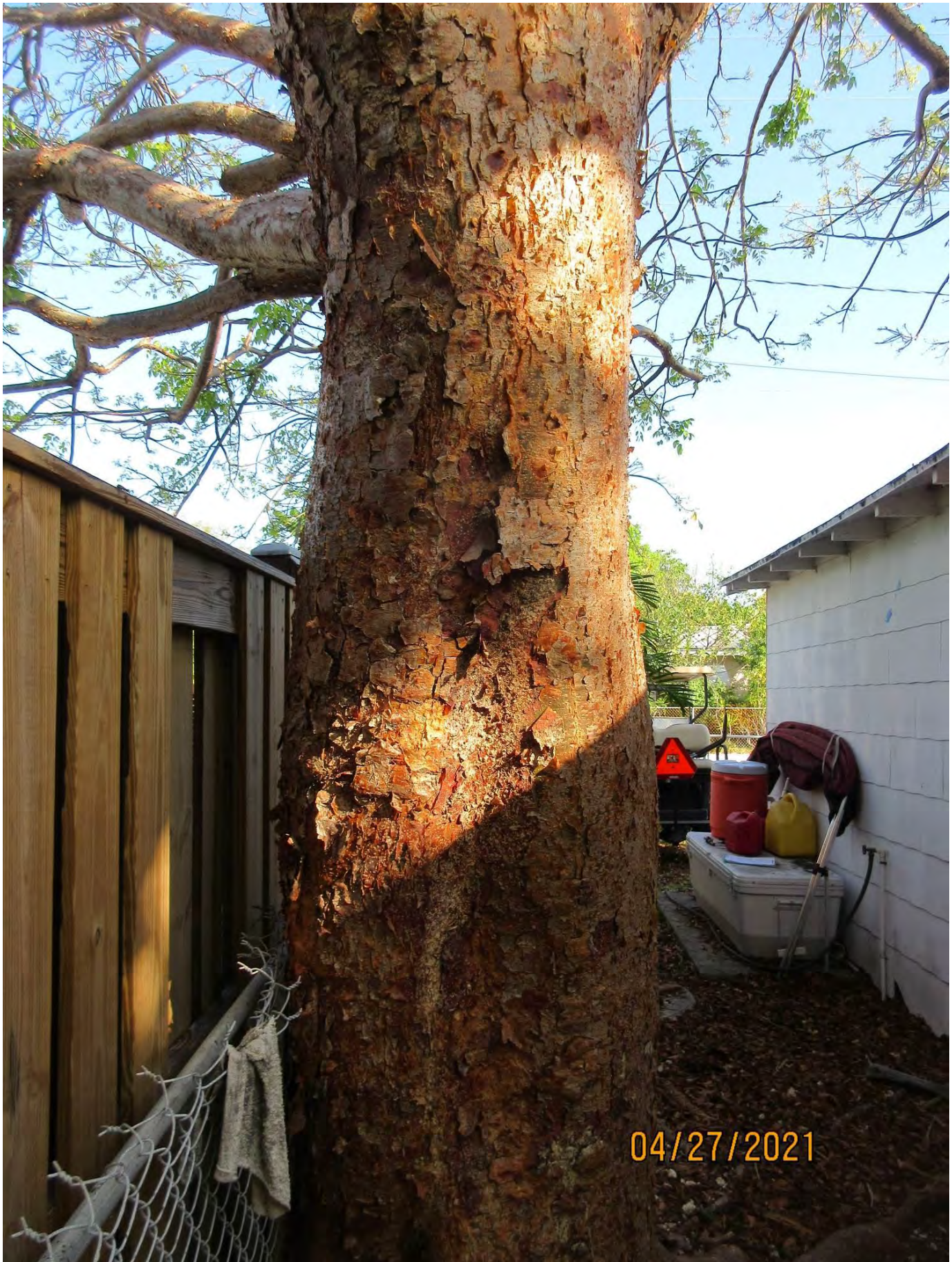
Photo of tree trunk.