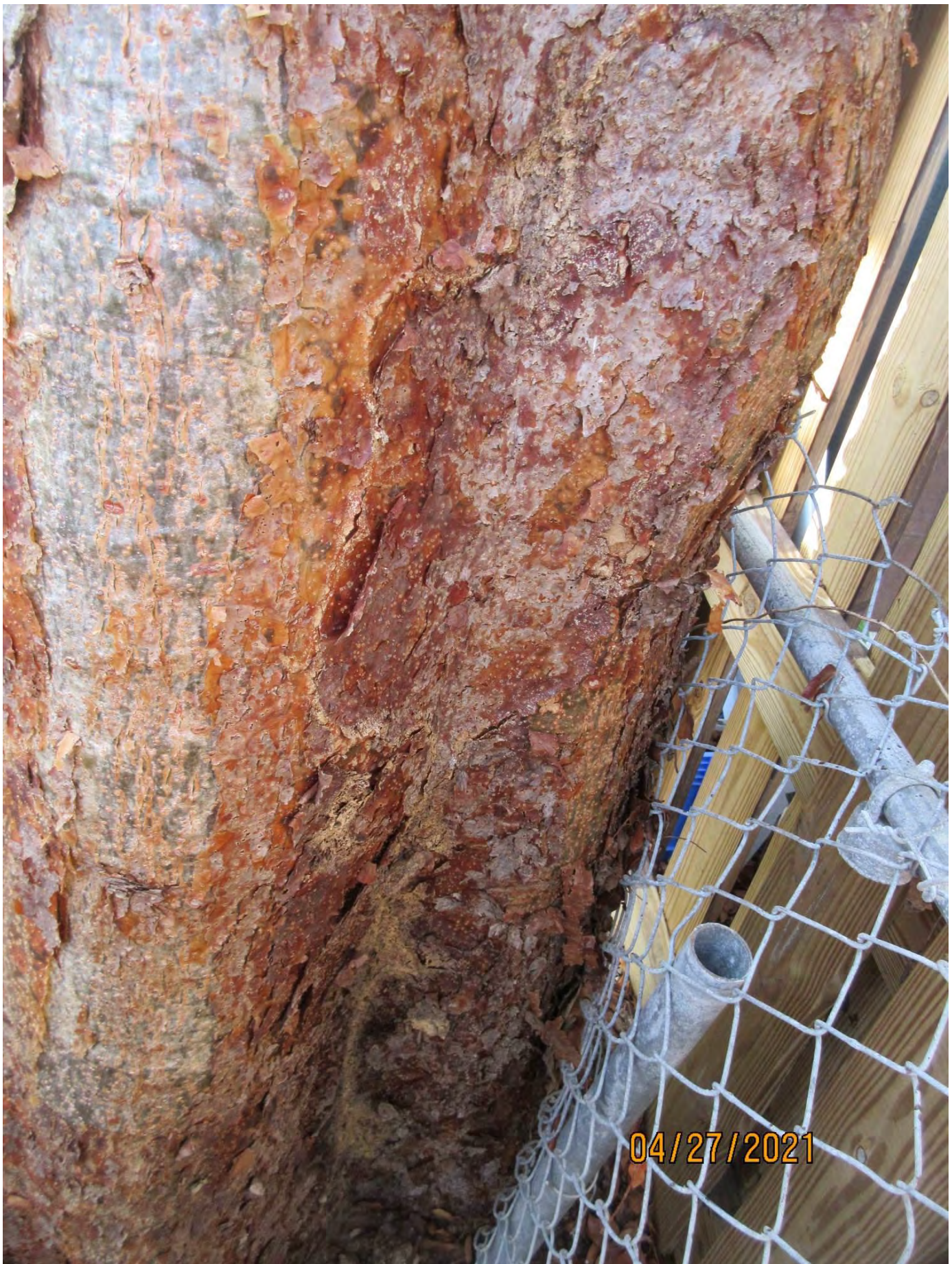
Close up of bark. Yellow discolored bark areas appear to be on surface of tree (was able to peel some off and find good bark skin).