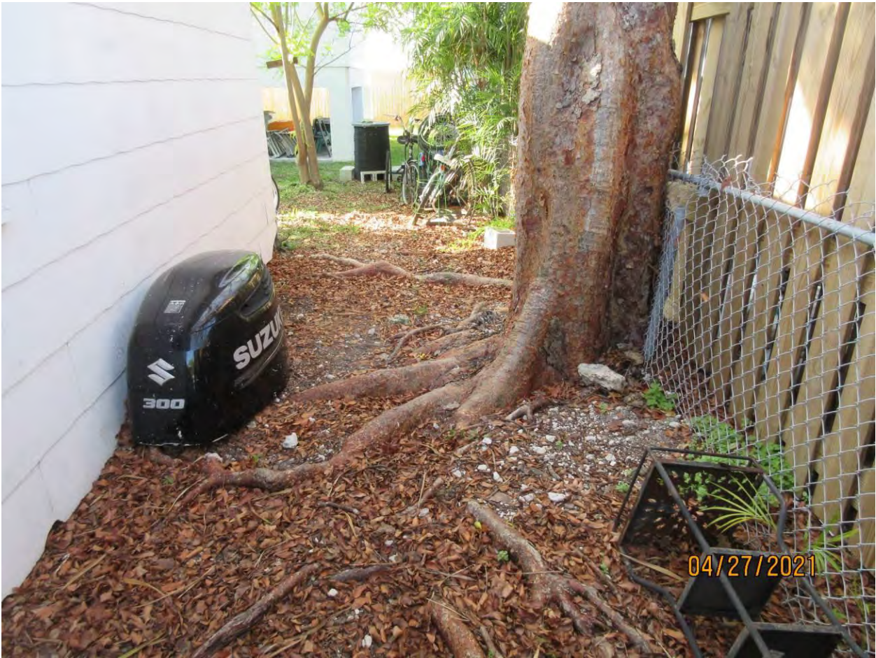
Photo showing root system and trunk of tree, view 2.