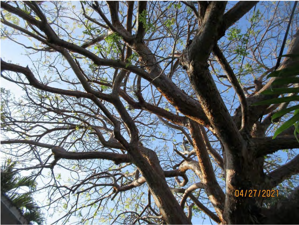
Photo of tree canopy, view 2.