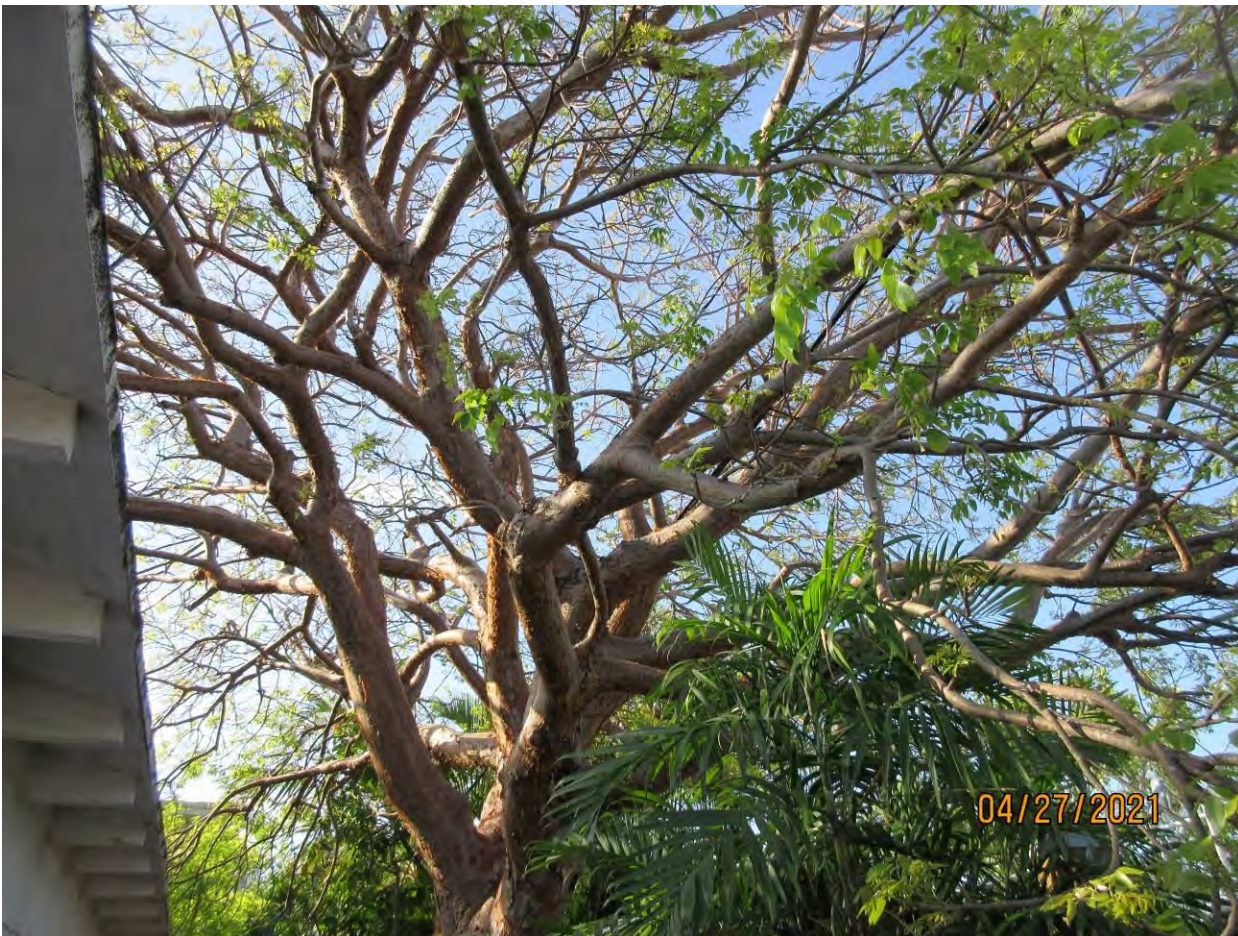
Photo of tree canopy, view 1.