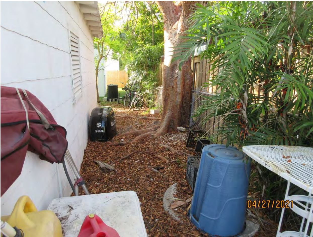
Photo showing root system and trunk of tree, view 1.