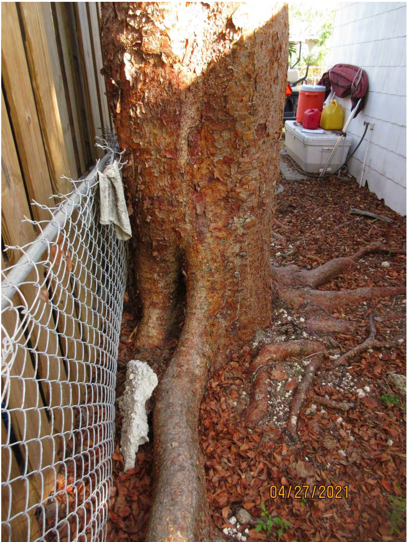
Photo showing root system and trunk of tree, view 4.