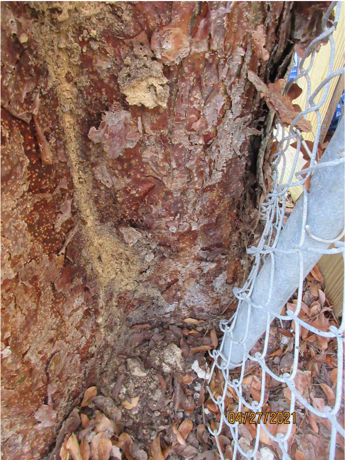
Photo of tree trunk with discolored bark and base of tree.