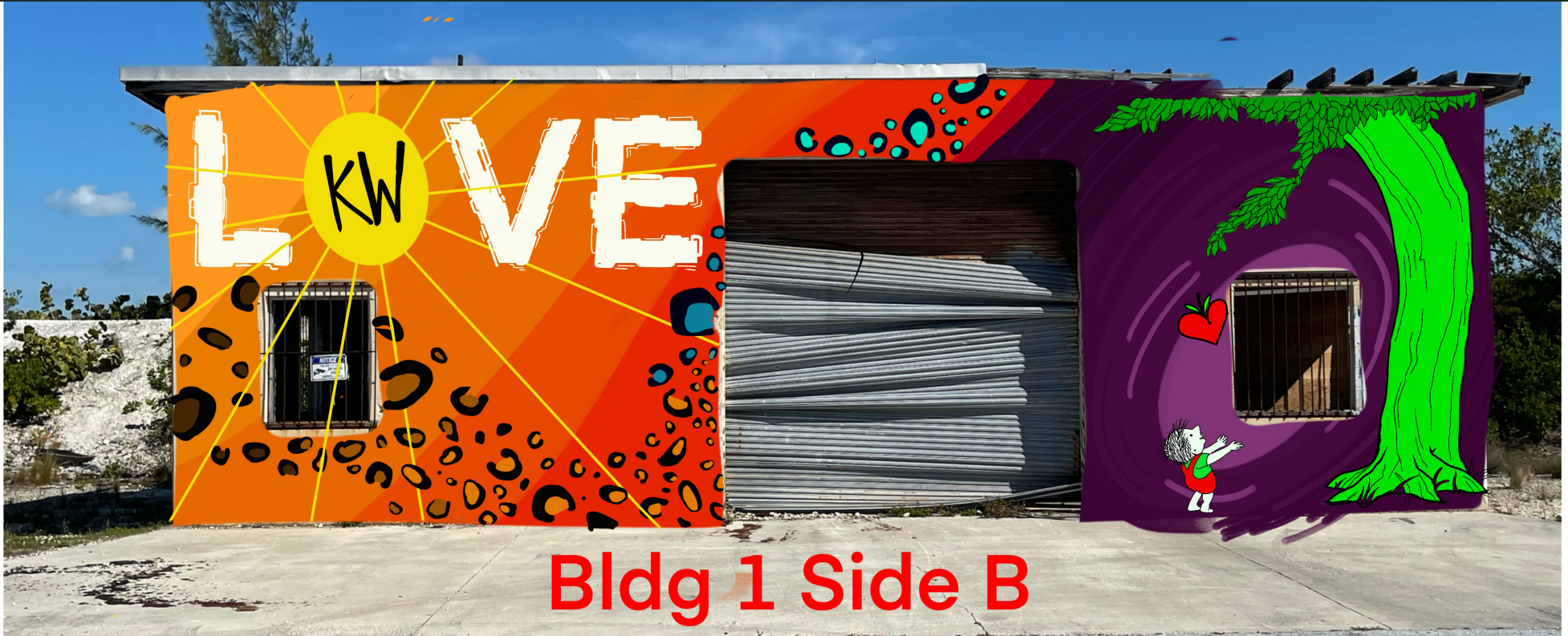
Bldg 1 Side B