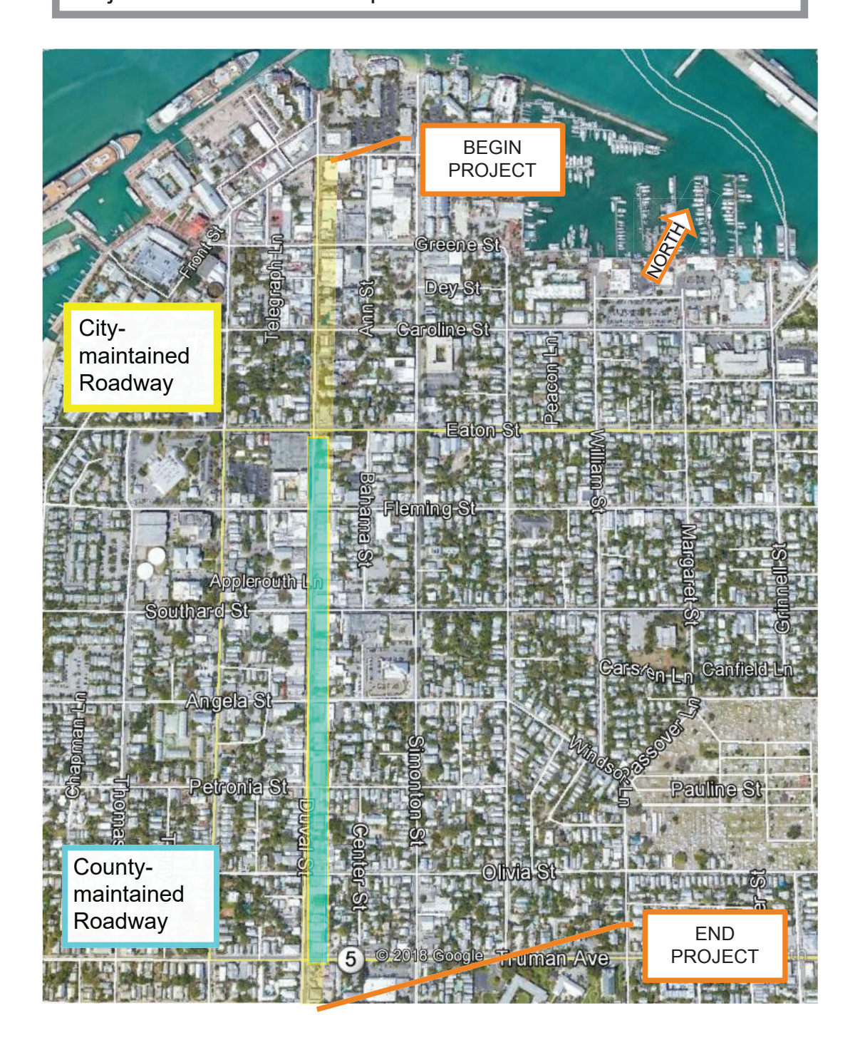
TO 1-20: Revised Project Location Map Project 1: Duval Street Improvements