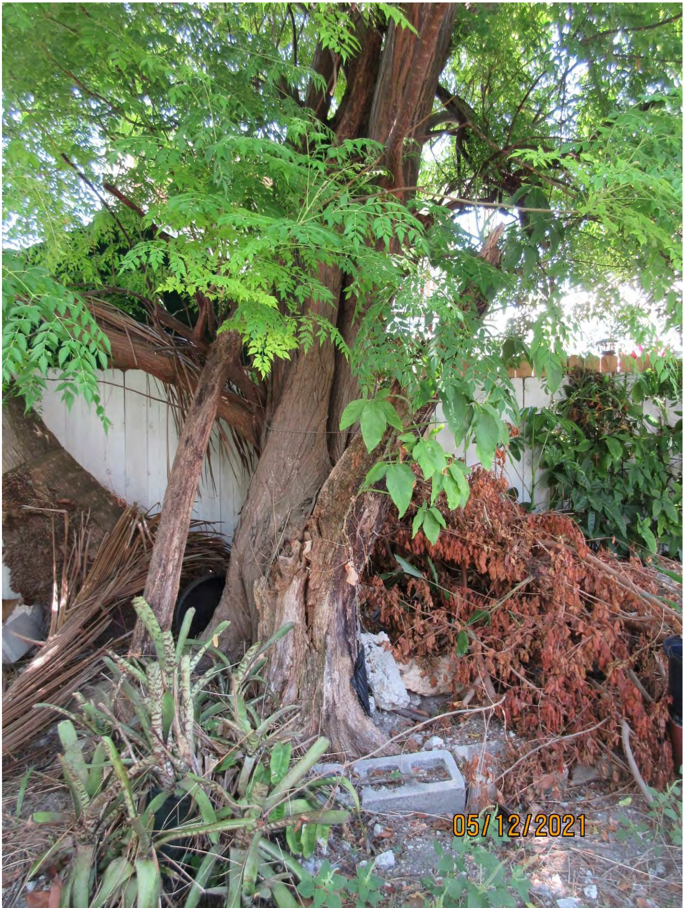
Photo showing base of tree, view 2.