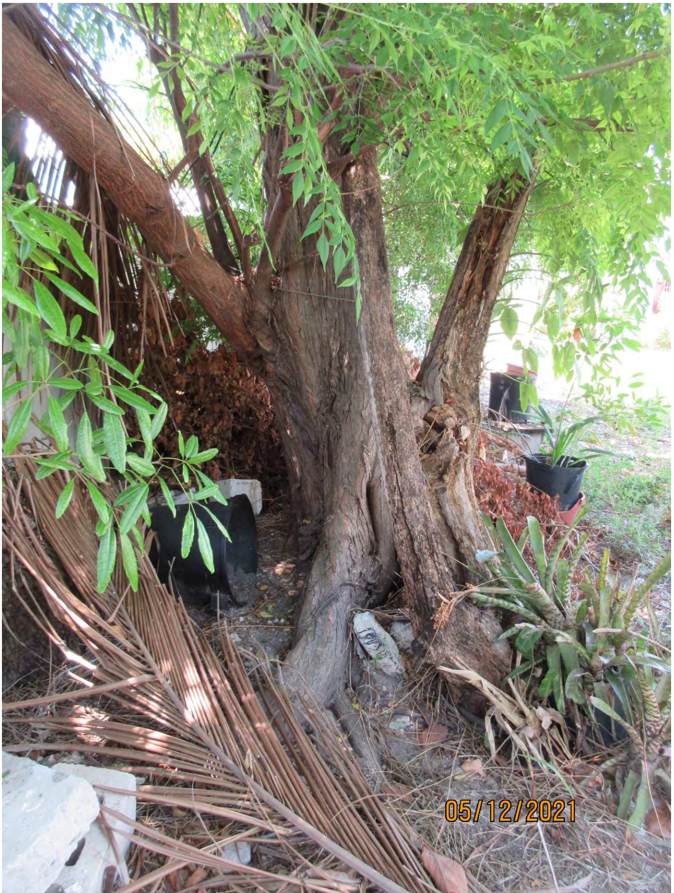
Photo showing base of tree, view 3. Note decay areas.