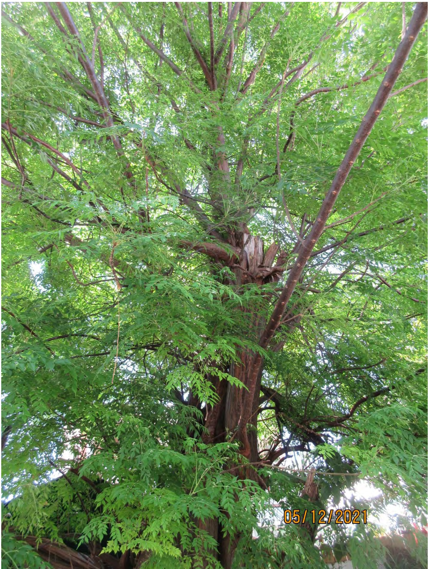
Photo showing tree canopy, view 2. Note main trunk damage/tear.