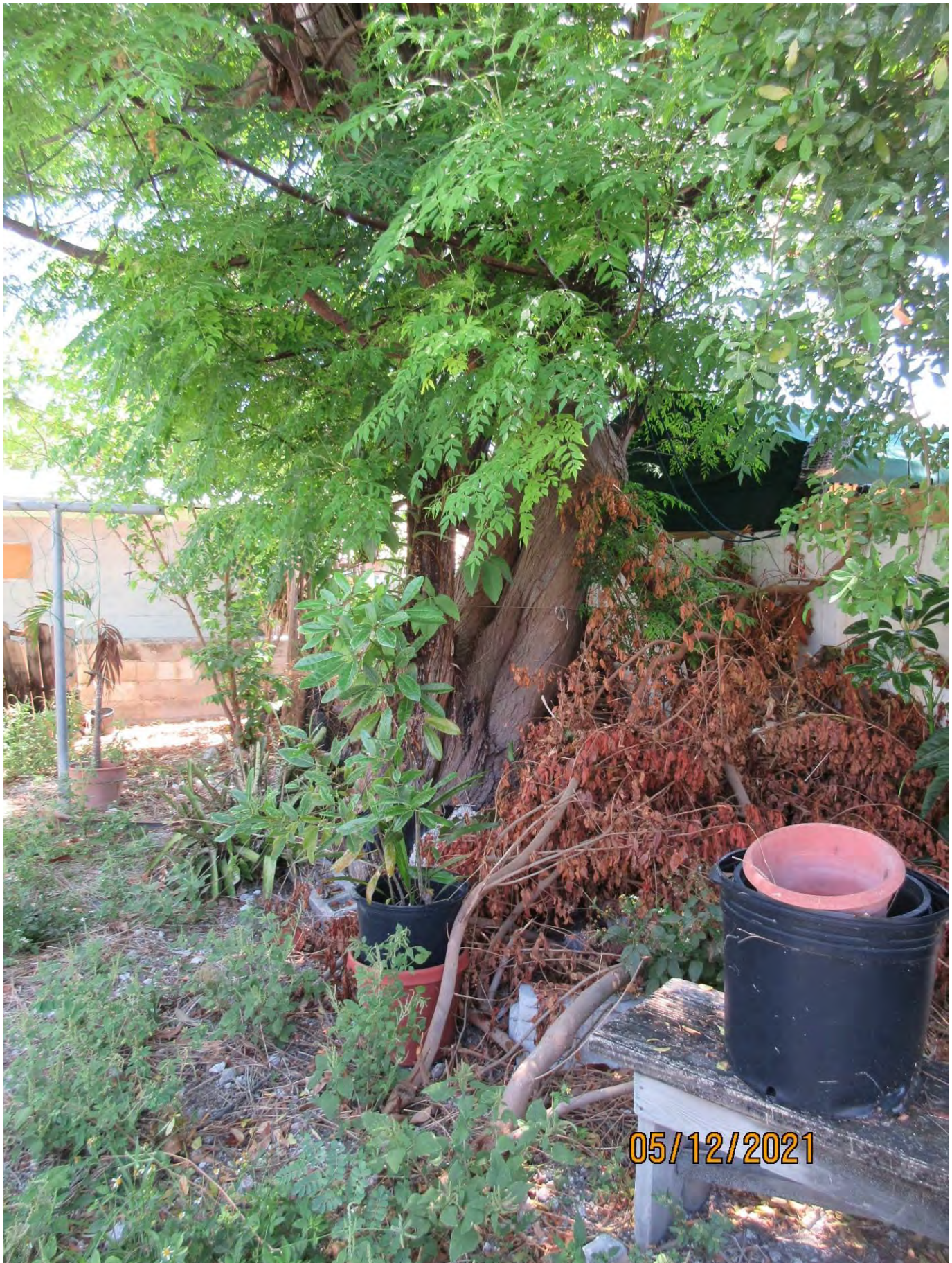
Photo showing base of tree, view 1.