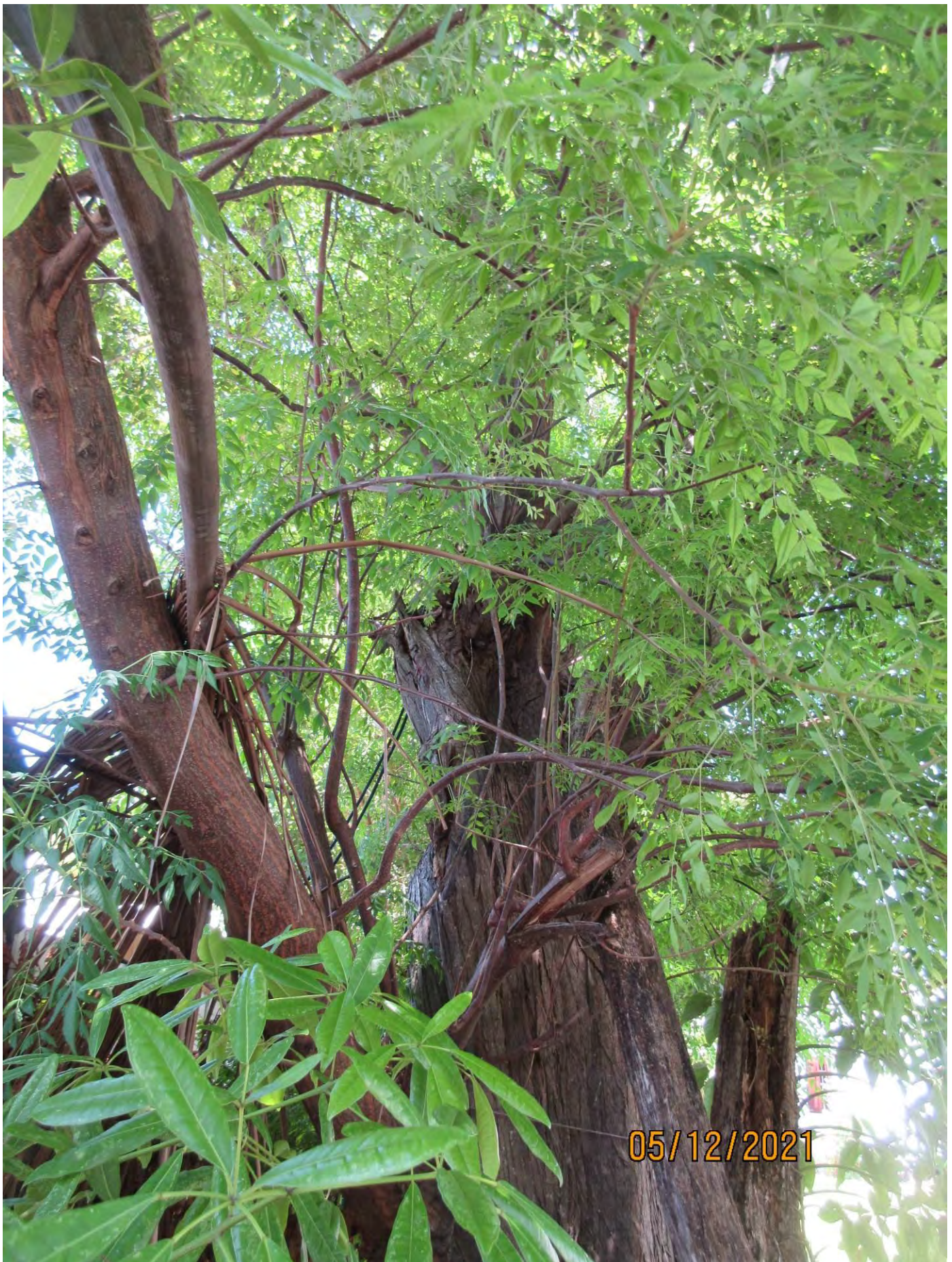
Photo showing tree canopy, view 3. Note main trunk tear and decay areas.