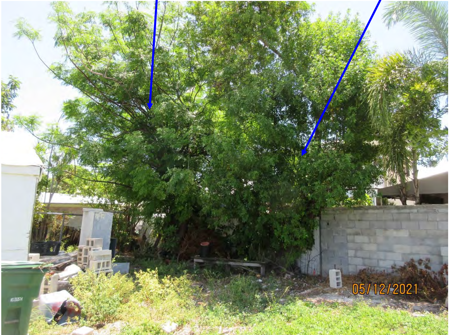
Photo showing location of tree in back yard along rear property line.