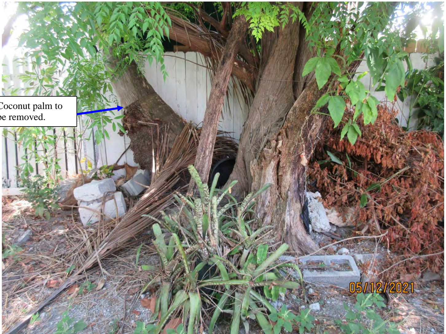
Photos showing base of tree, view 4.