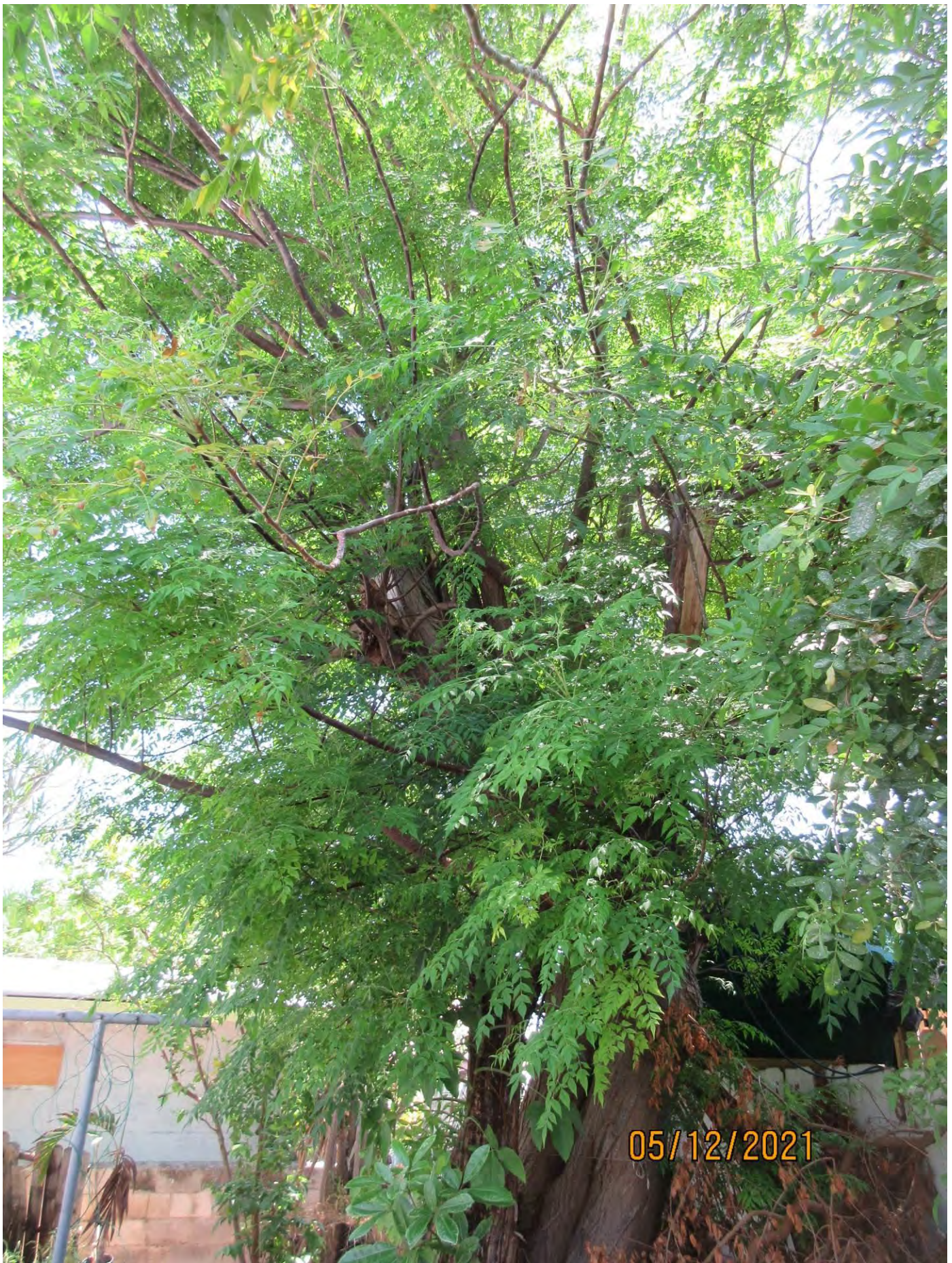
Photo showing tree canopy, view 1.