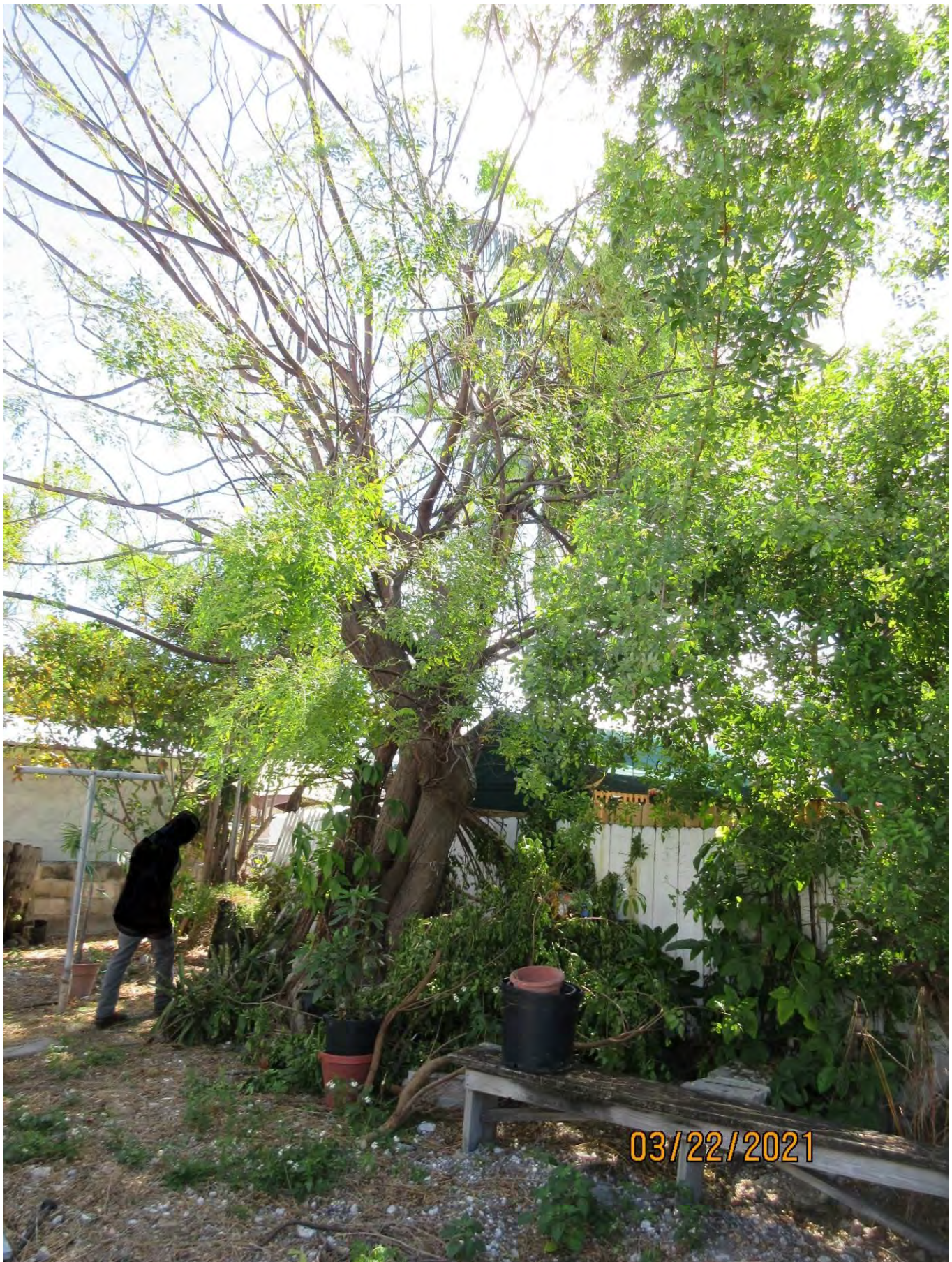
Photo showing whole tree.