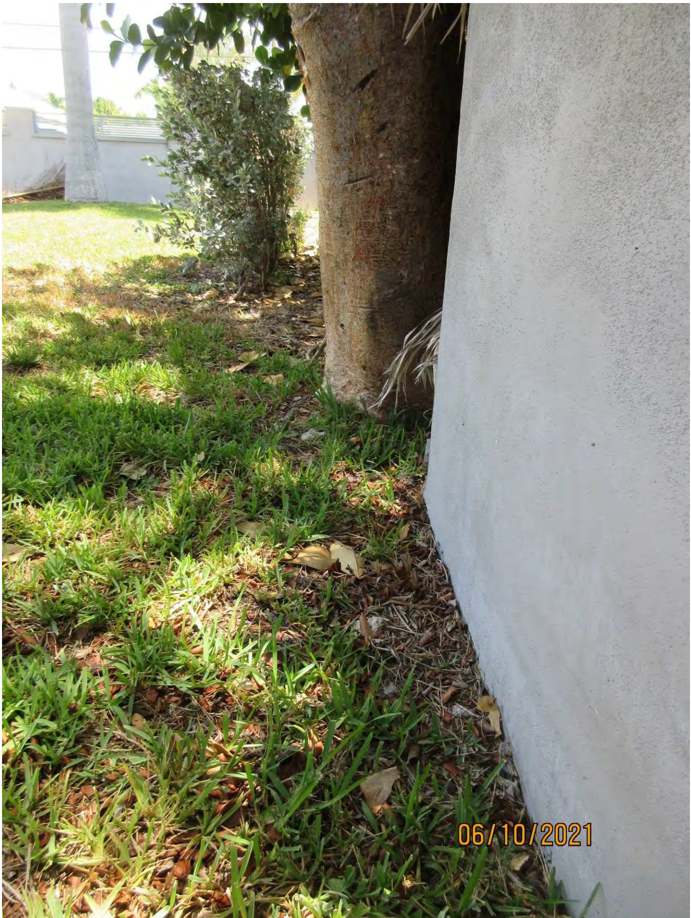
Photo of base of tree at property line wall.