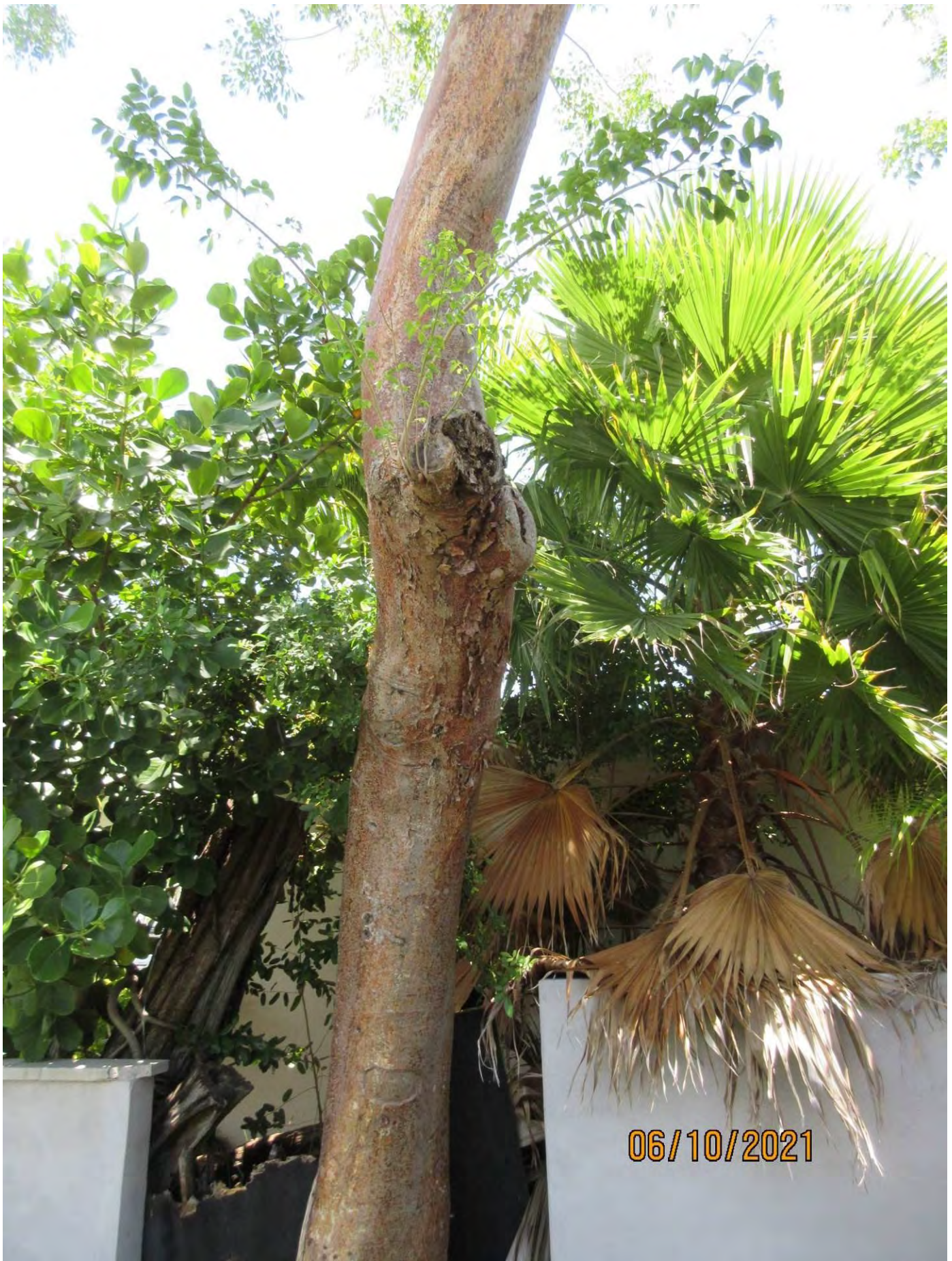
Photo of tree trunk in relation to property line wall.