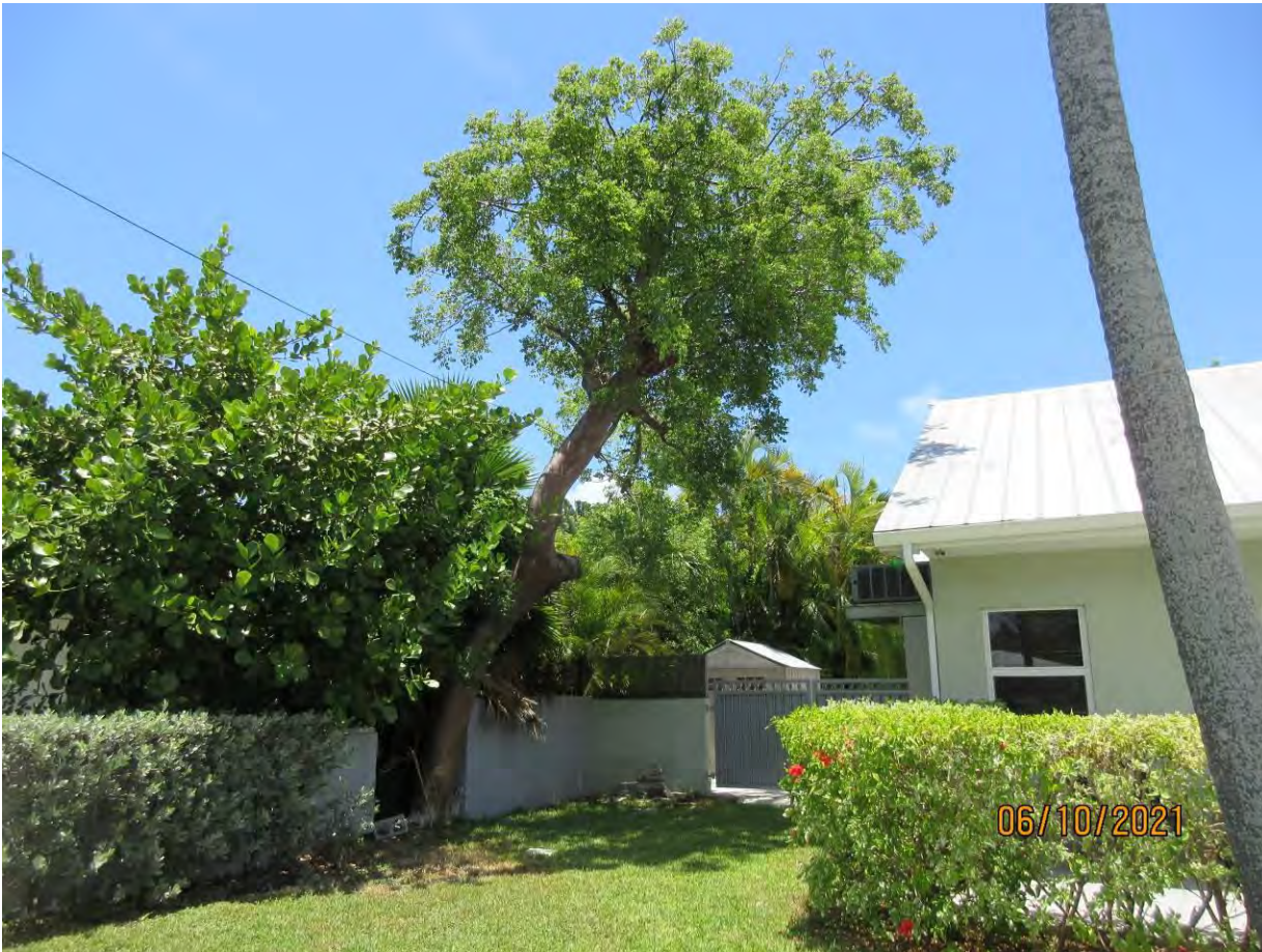
Photo showing location of tree, view 2.