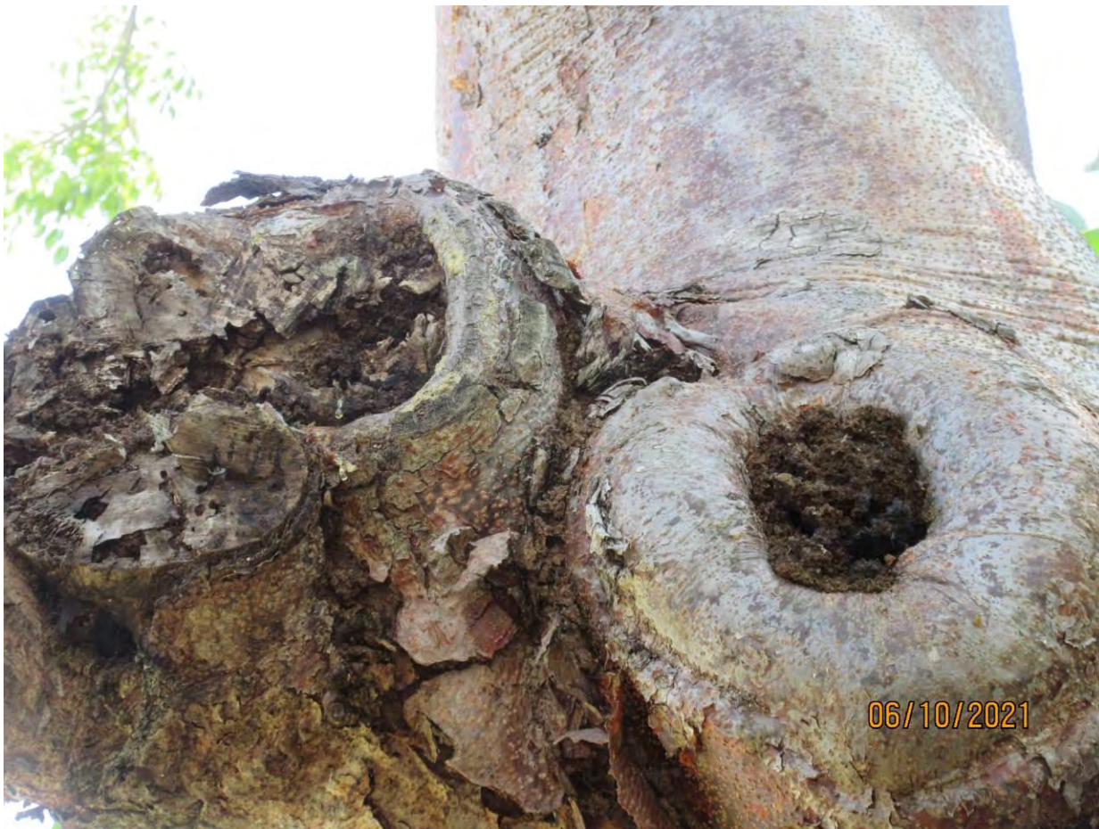
Close up photo of lower trunk damage/decay area.