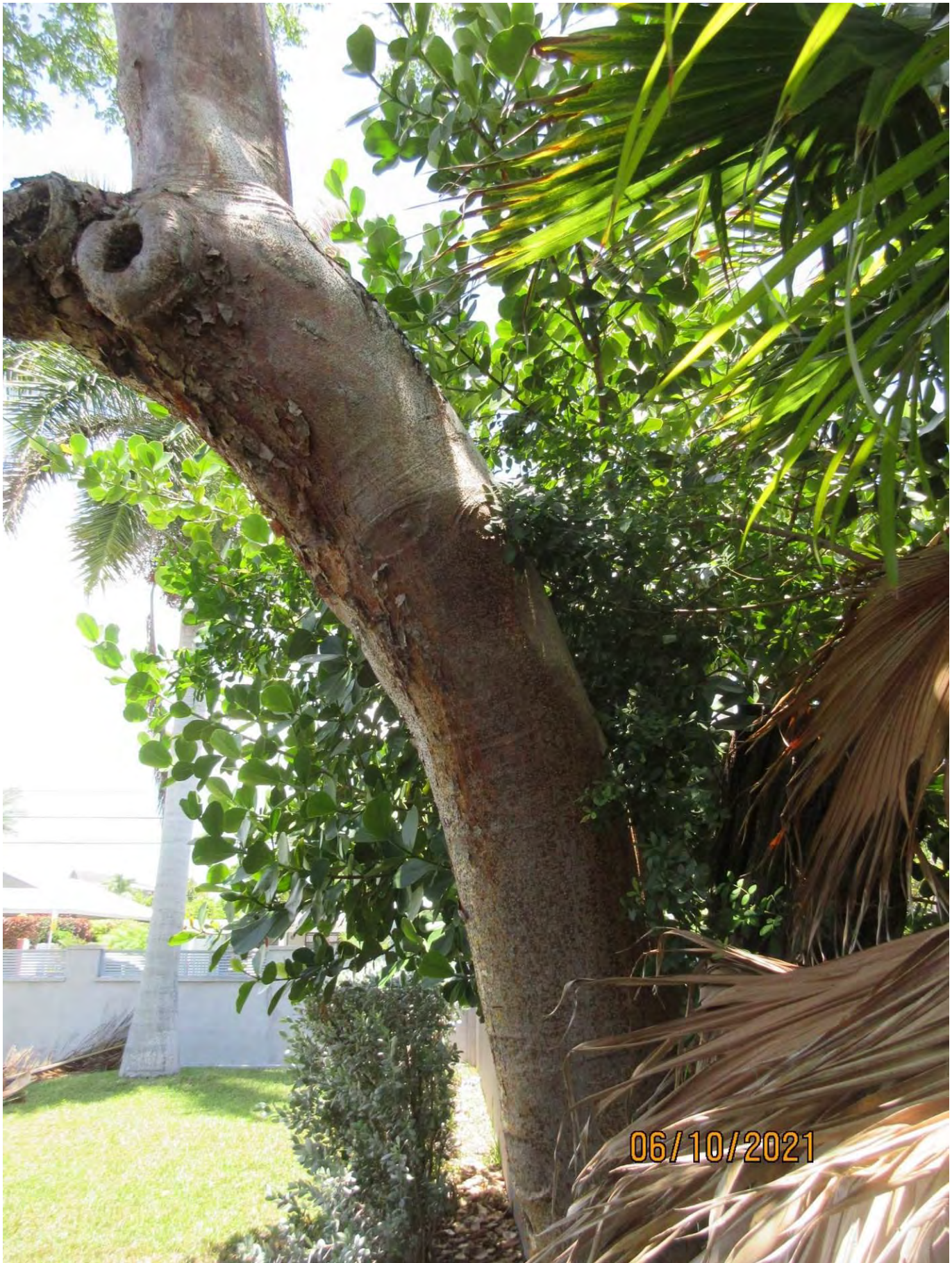
Photo of main trunk lower damage/decay area, view 2.