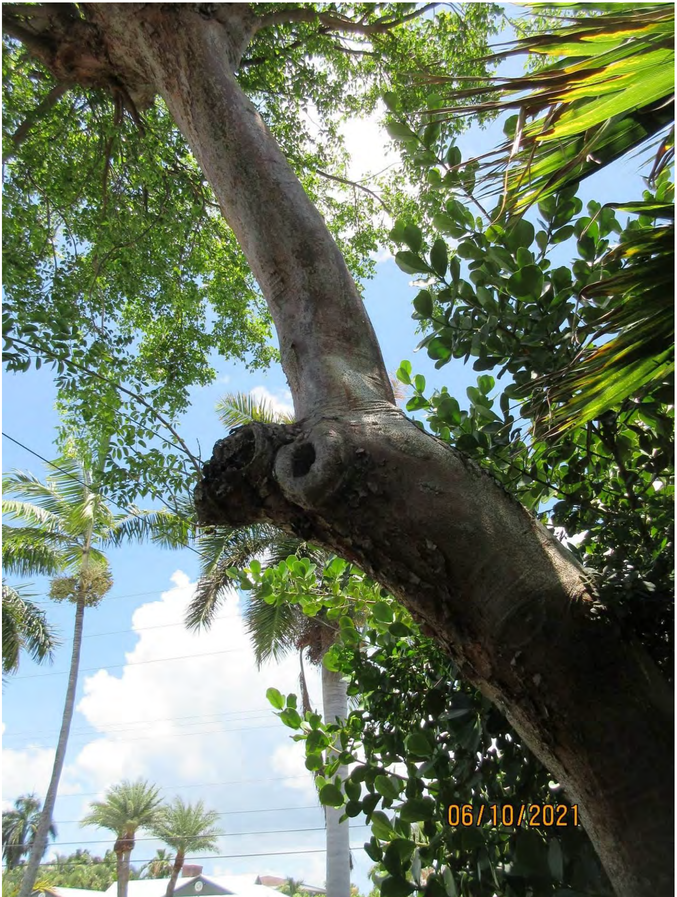
Photo of main trunk lower damage/decay area, view 1.