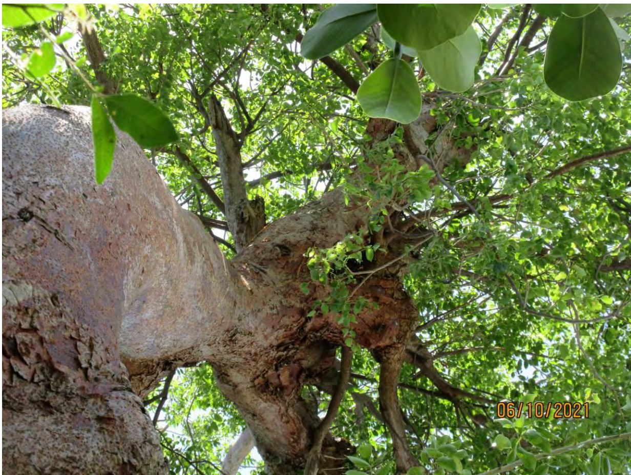
Photo of upper damage/decay area in upper canopy, view 1.