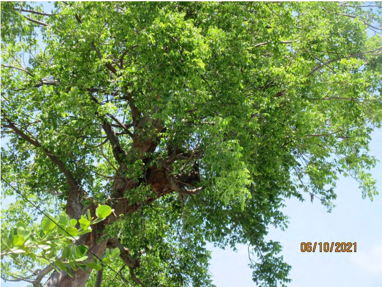
Photo of tree canopy, view 1.