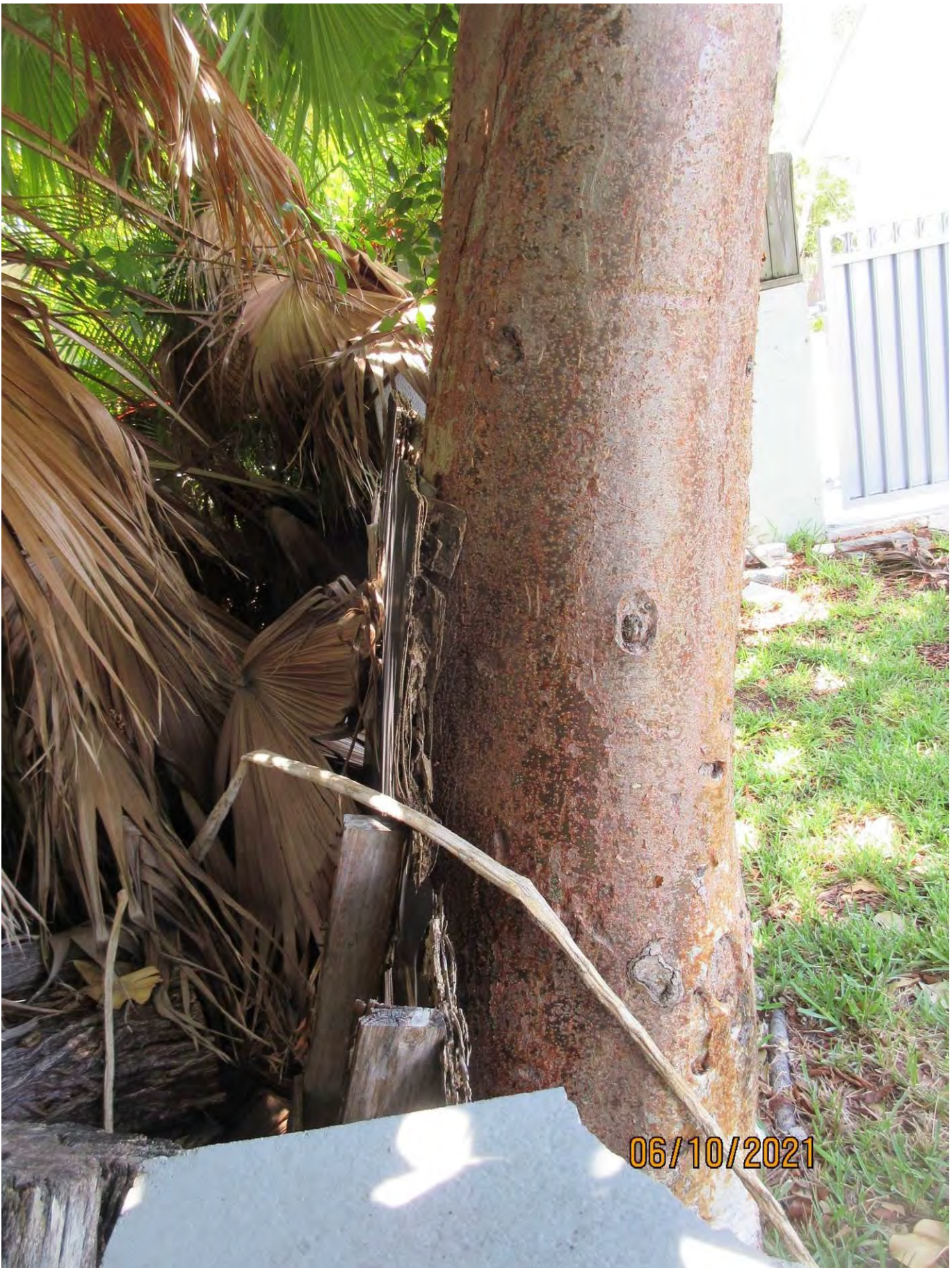
Photo of tree trunk at property line.