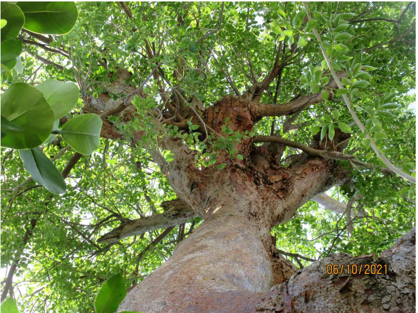
Photo of upper damage/decay area in upper canopy, view 2.