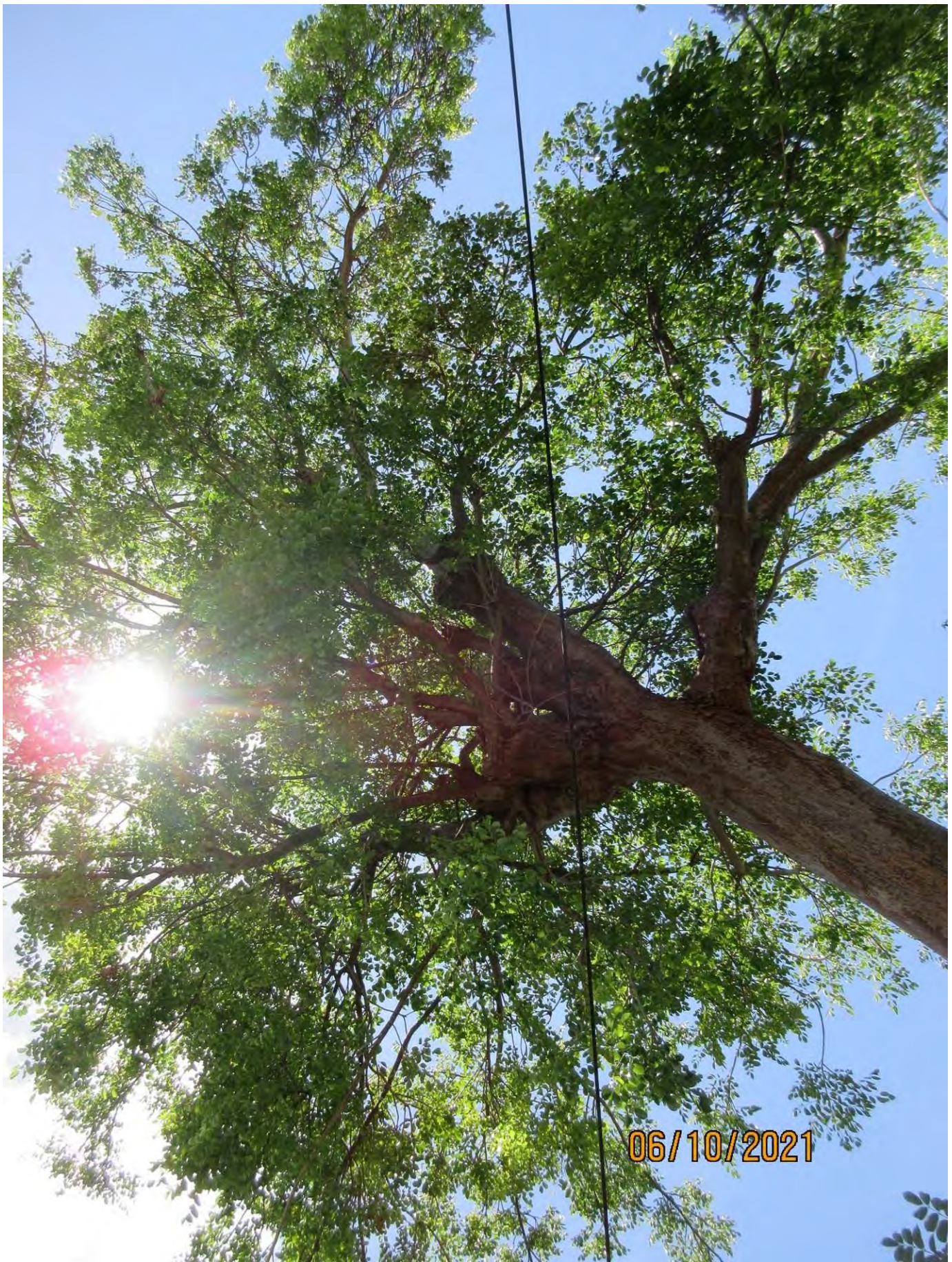
Photo of tree canopy and utility line to house.