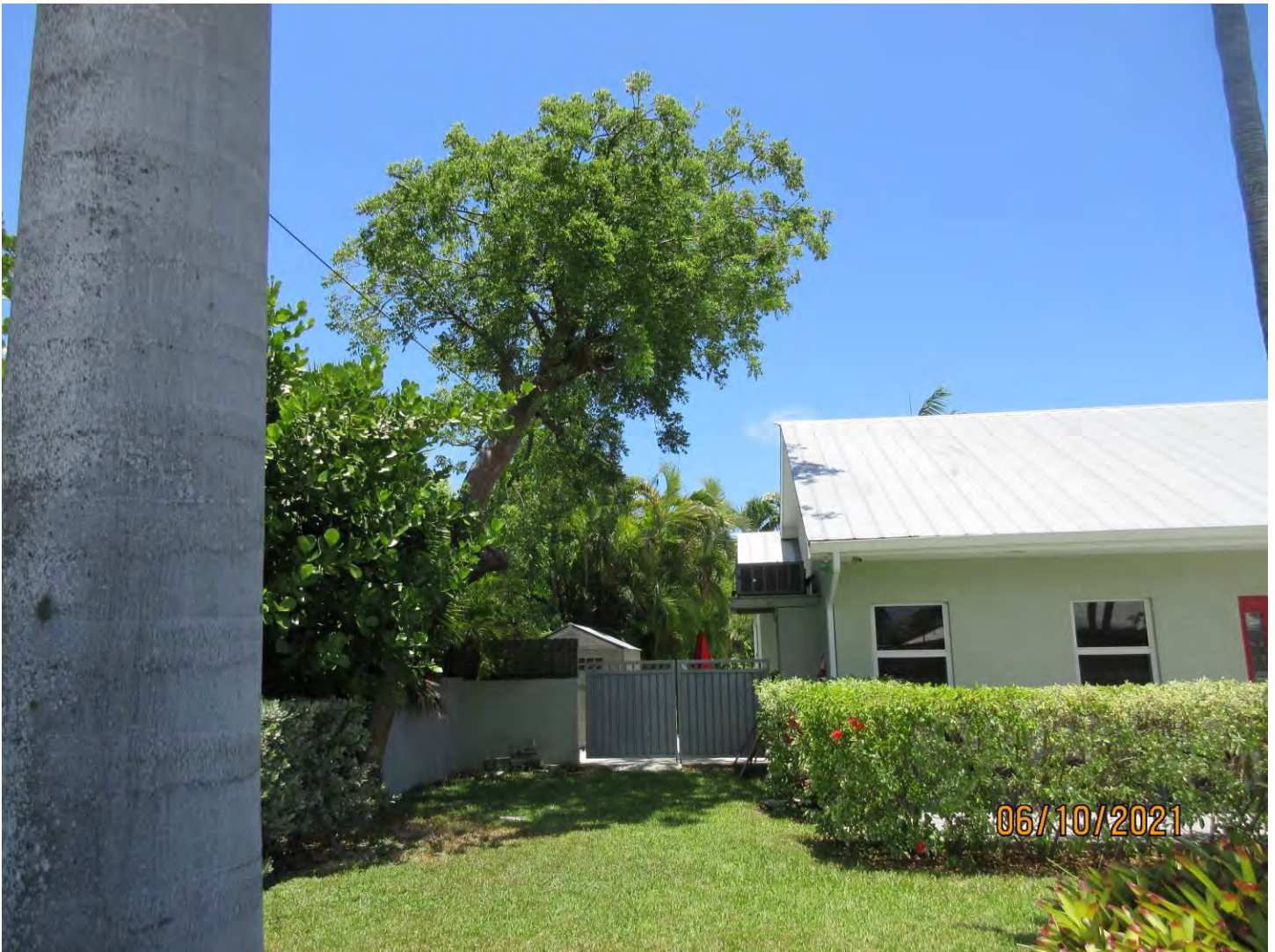
Photo showing location of tree, view 1.

Tree Species: Gumbo Limbo ( Bursera simaruba )