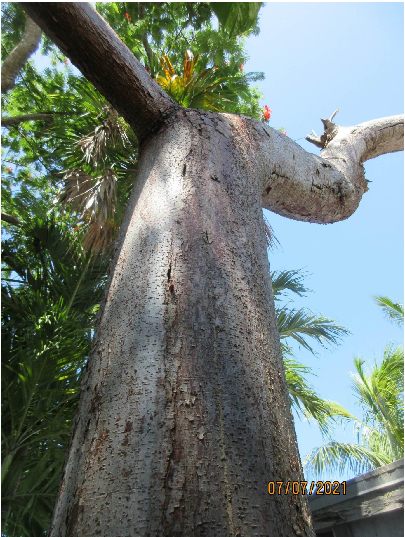
Photo showing tree trunk looking up toward crotch. Note weeping sap, view 1.