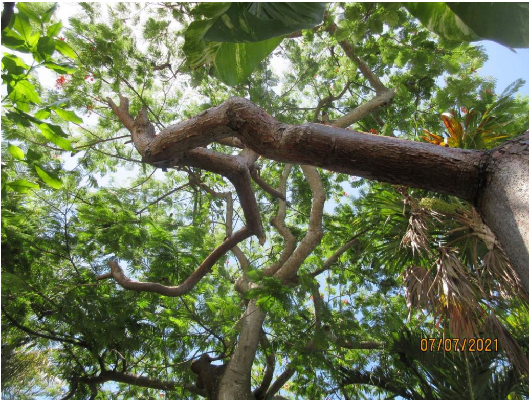
Photo of remaining branch on opposite side of tree, view 2.