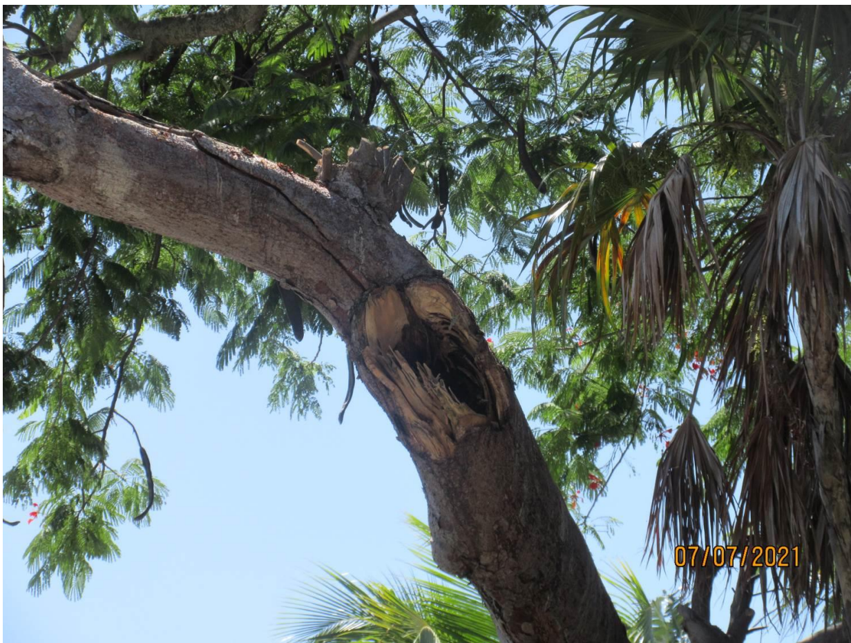
Photo showing broken main tree branch, view 4.