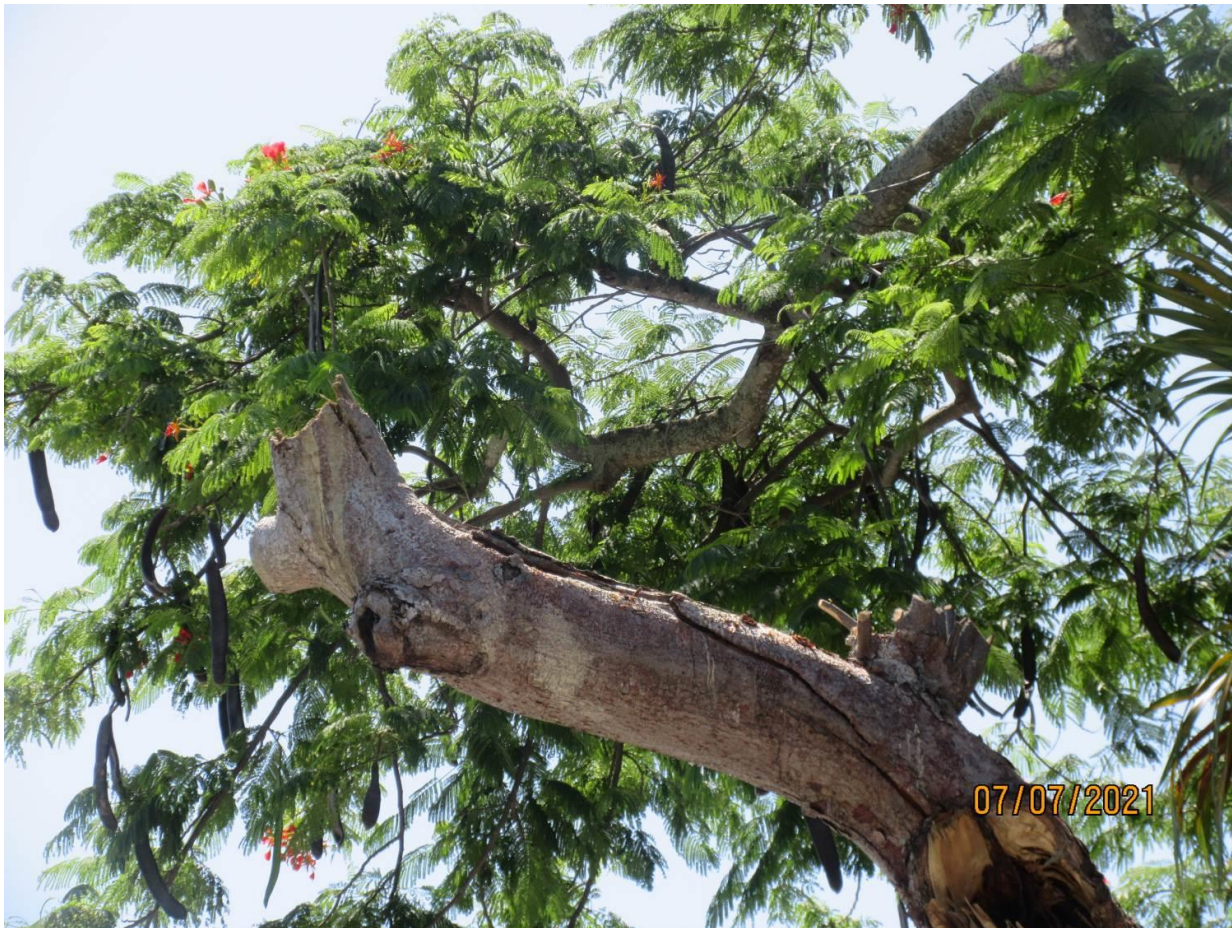
Photo showing broken main tree branch, view 3.