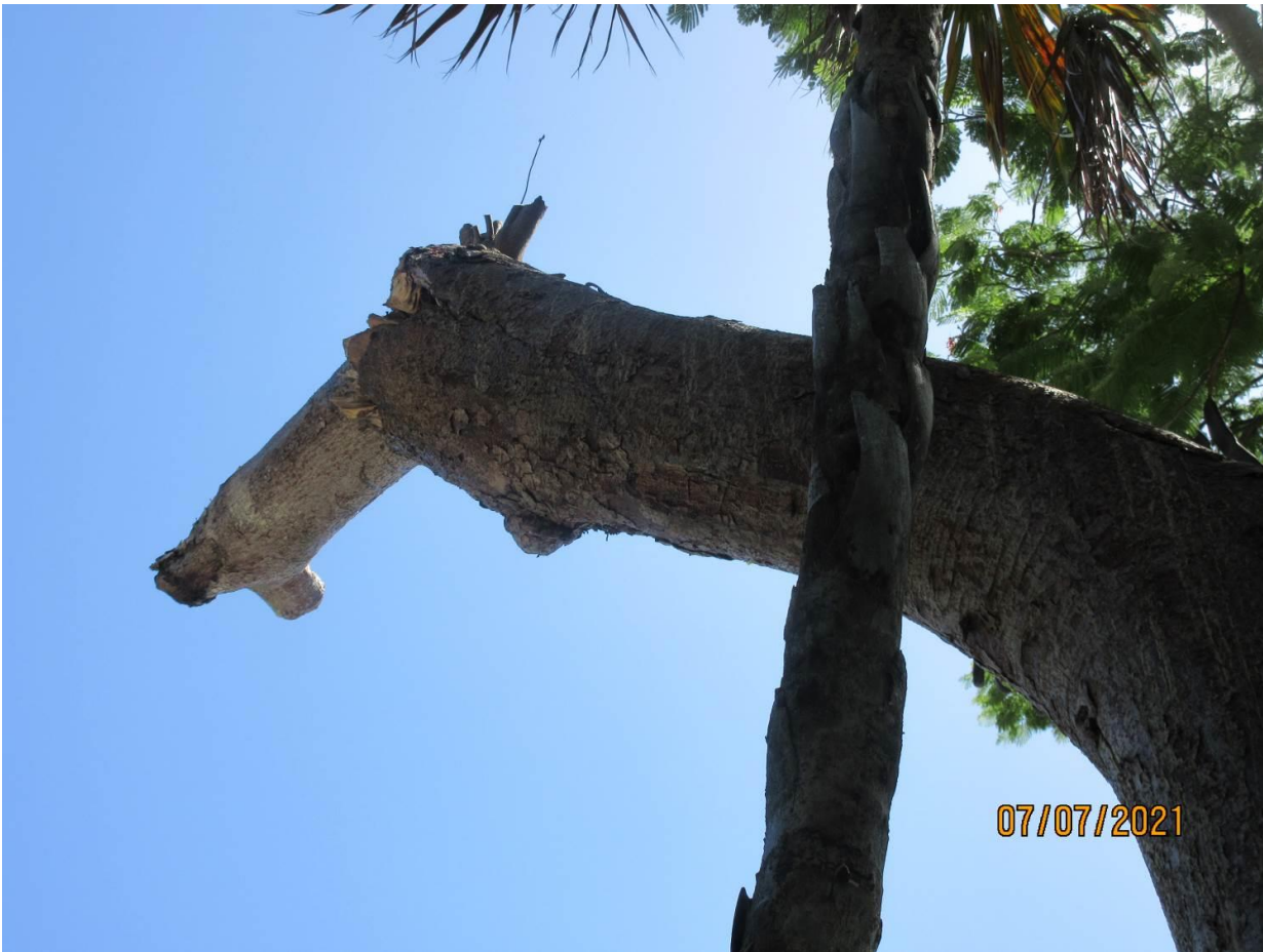
Photo showing broken main tree branch, view 1.