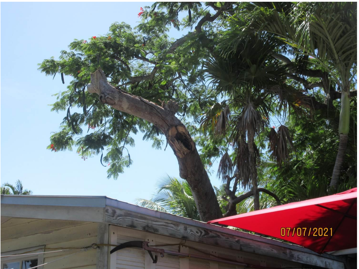
Photo showing location of tree behind structure.

Tree Species: Gumbo Limbo (Bursera simaruba)