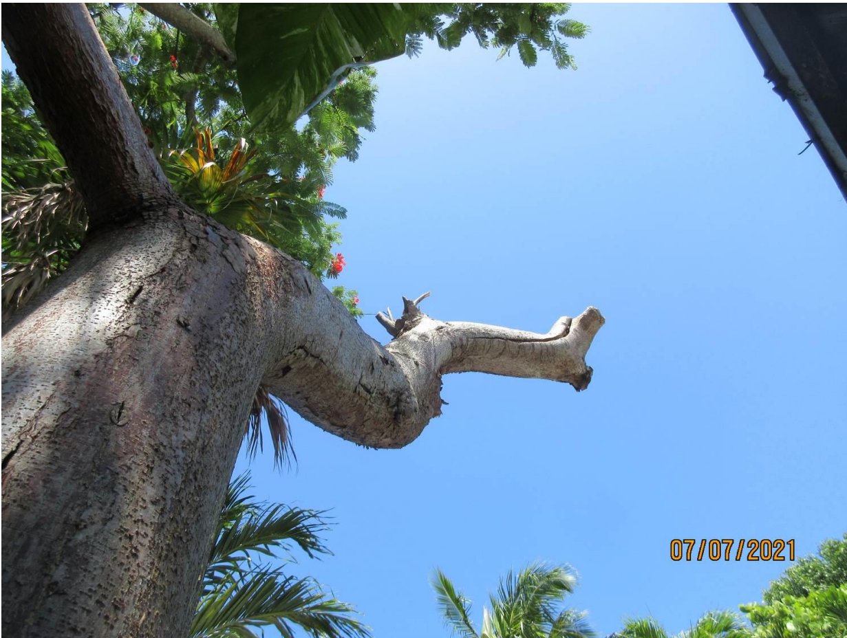
Photo showing broken main tree branch, view 2.