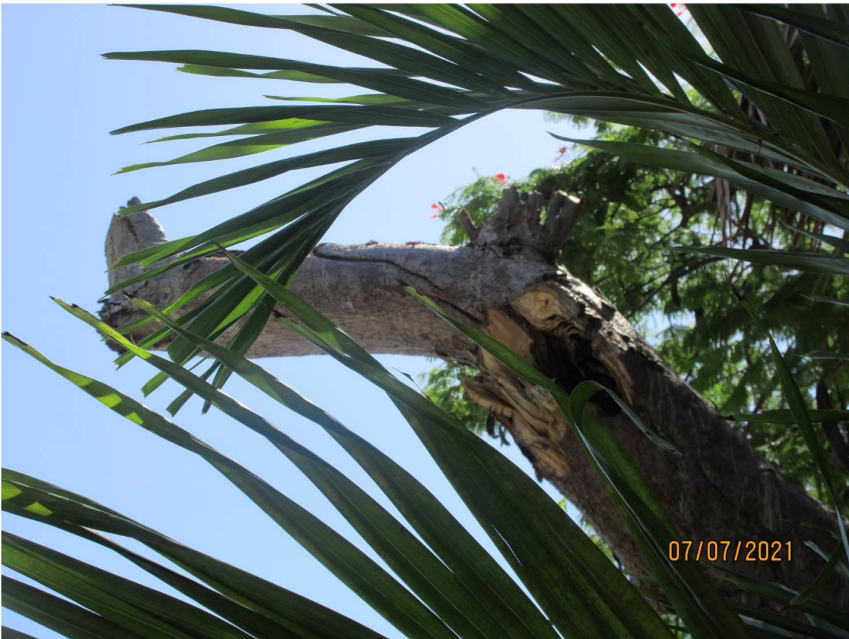
Photo showing broken main tree branch, view 2.