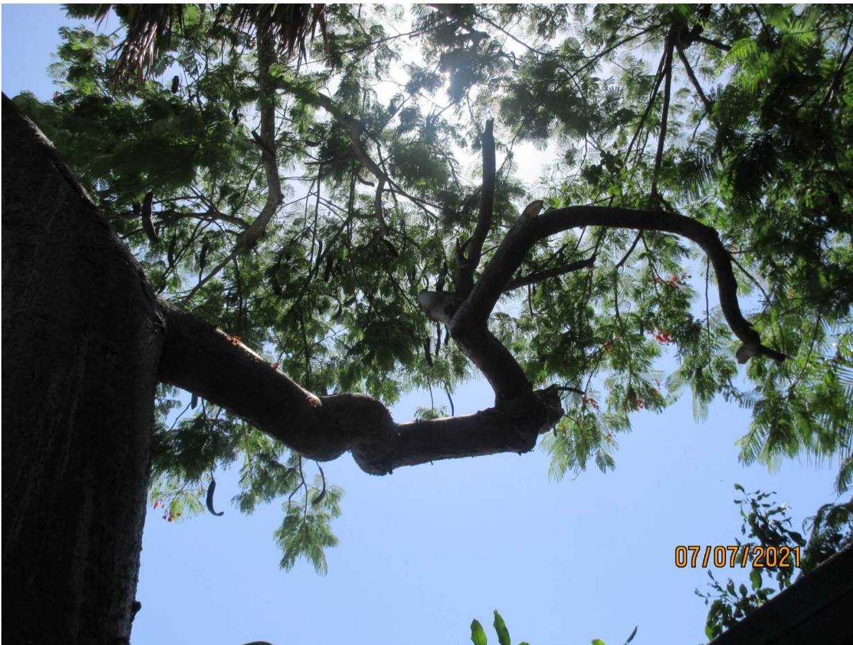
Photo of remaining branch on opposite side of tree, view 1.