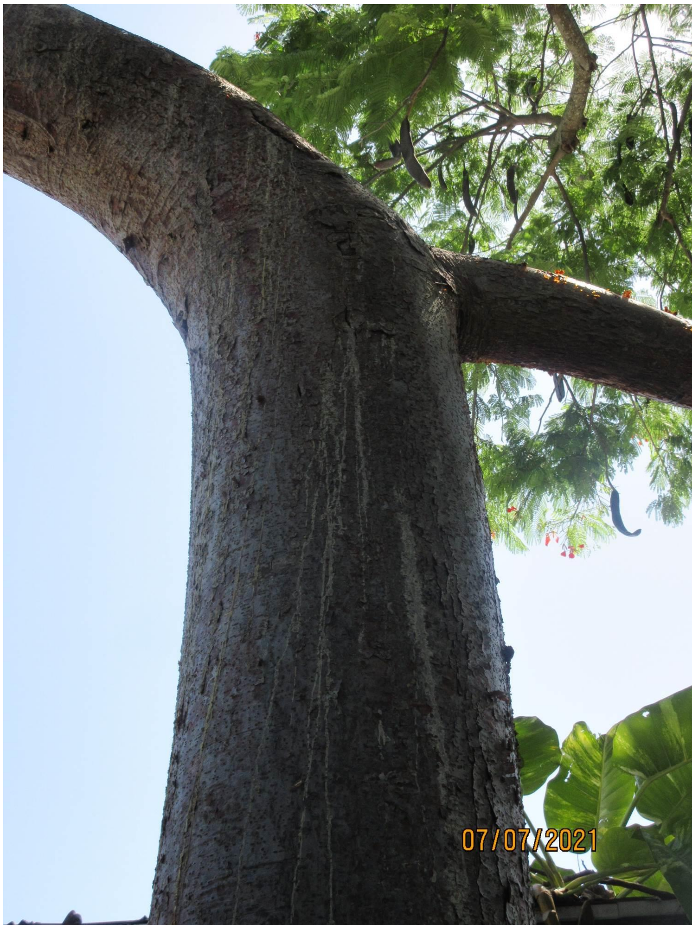
Photo showing tree trunk looking up toward crotch. Note weeping sap, view 2.