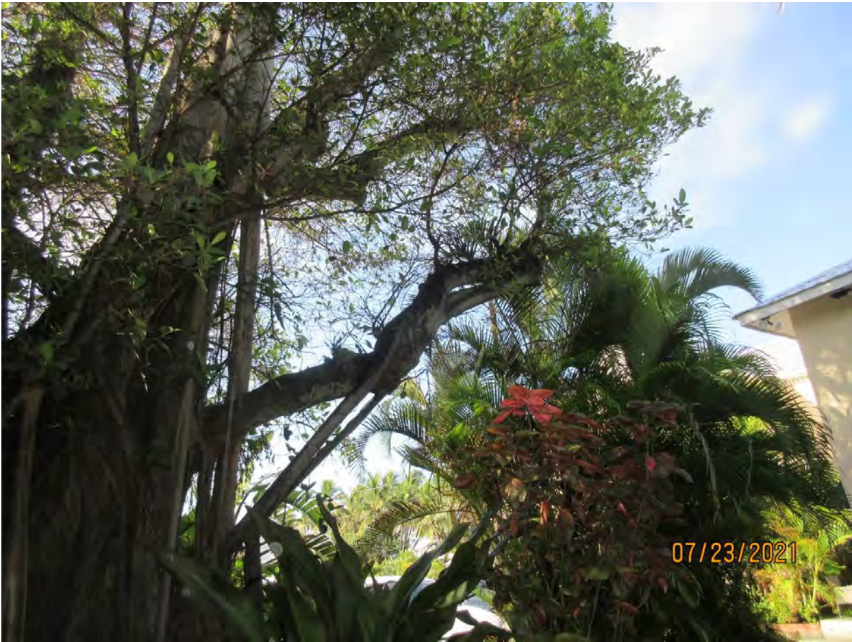
Photo of tree trunks in canopy, view 3.