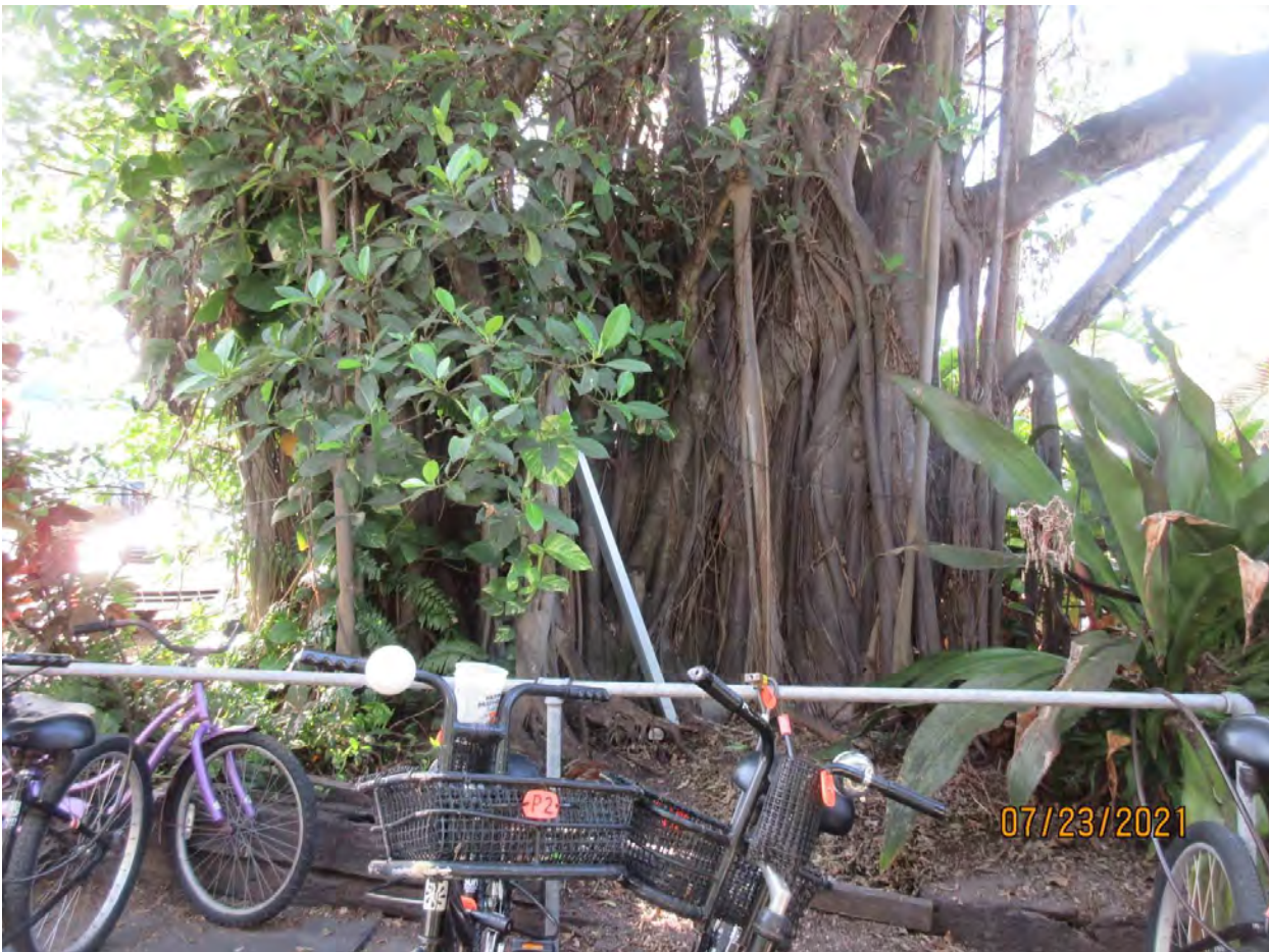
Photo showing base of tree.