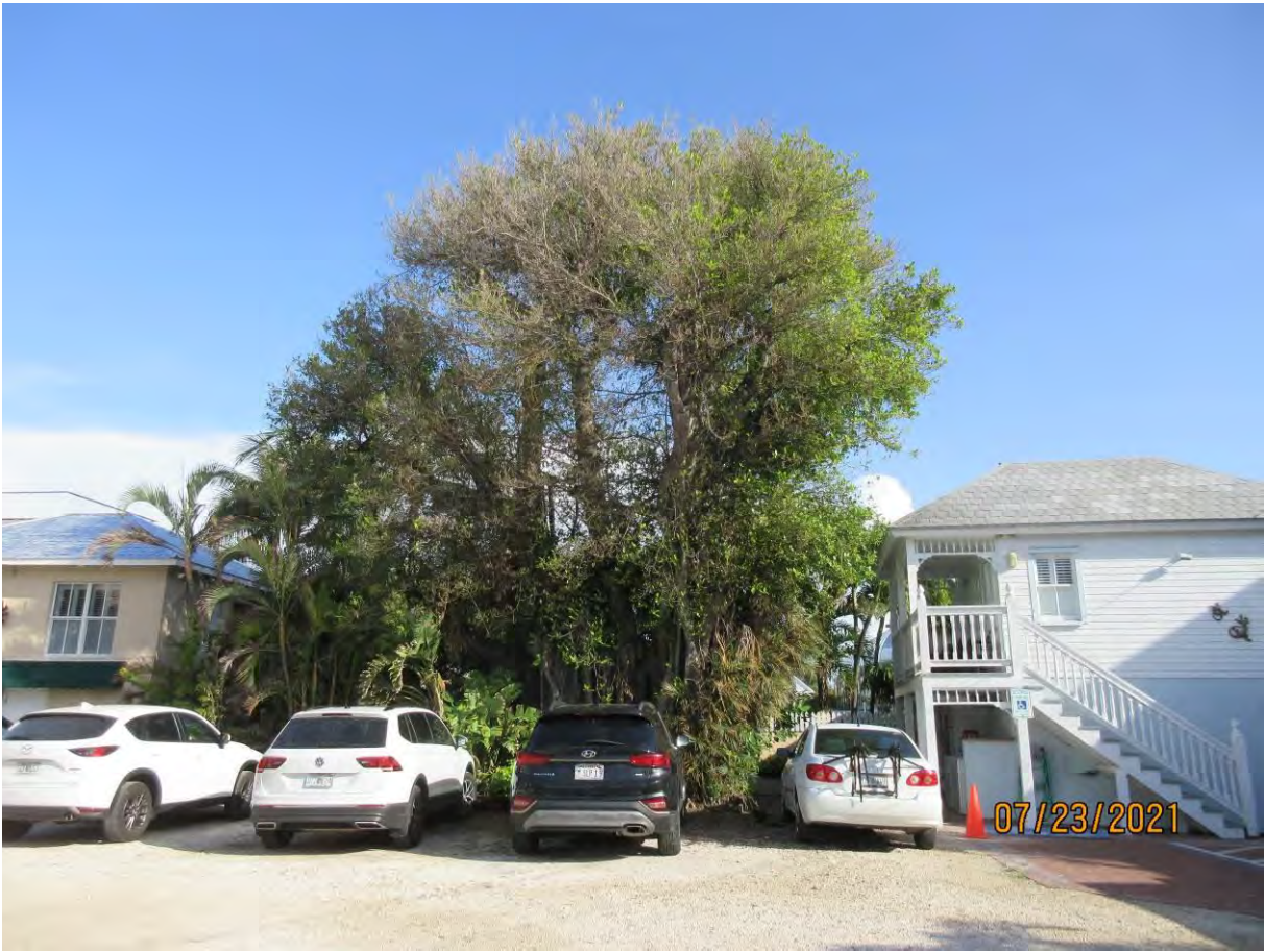
Two photos of the whole tree taken a year apart.