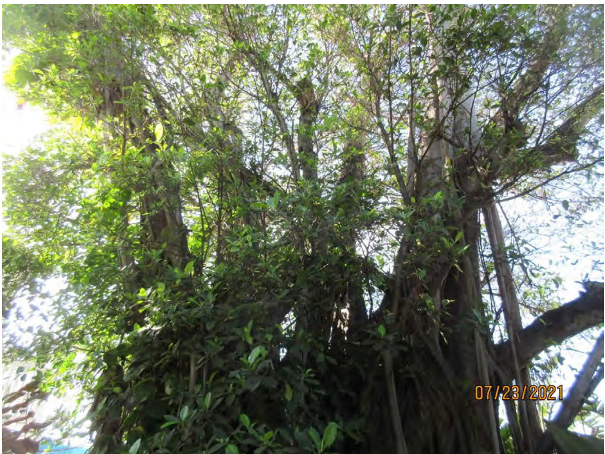
Photo of tree trunks in canopy, view 5.