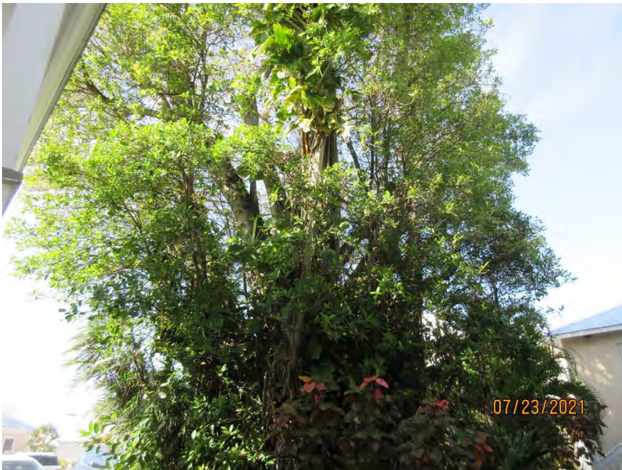
Photo of tree trunks in canopy, view 4.