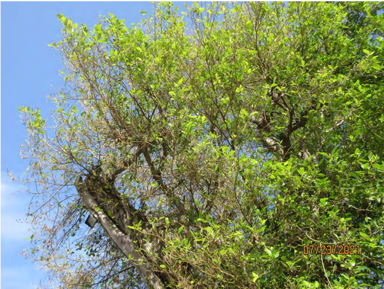
Photo of tree canopy edge, view 3.