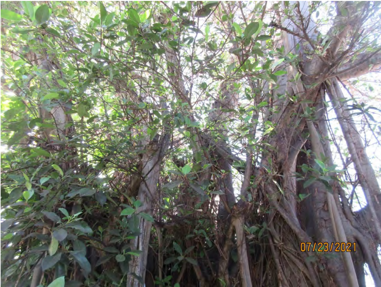
Photo of tree trunks in canopy, view 2.