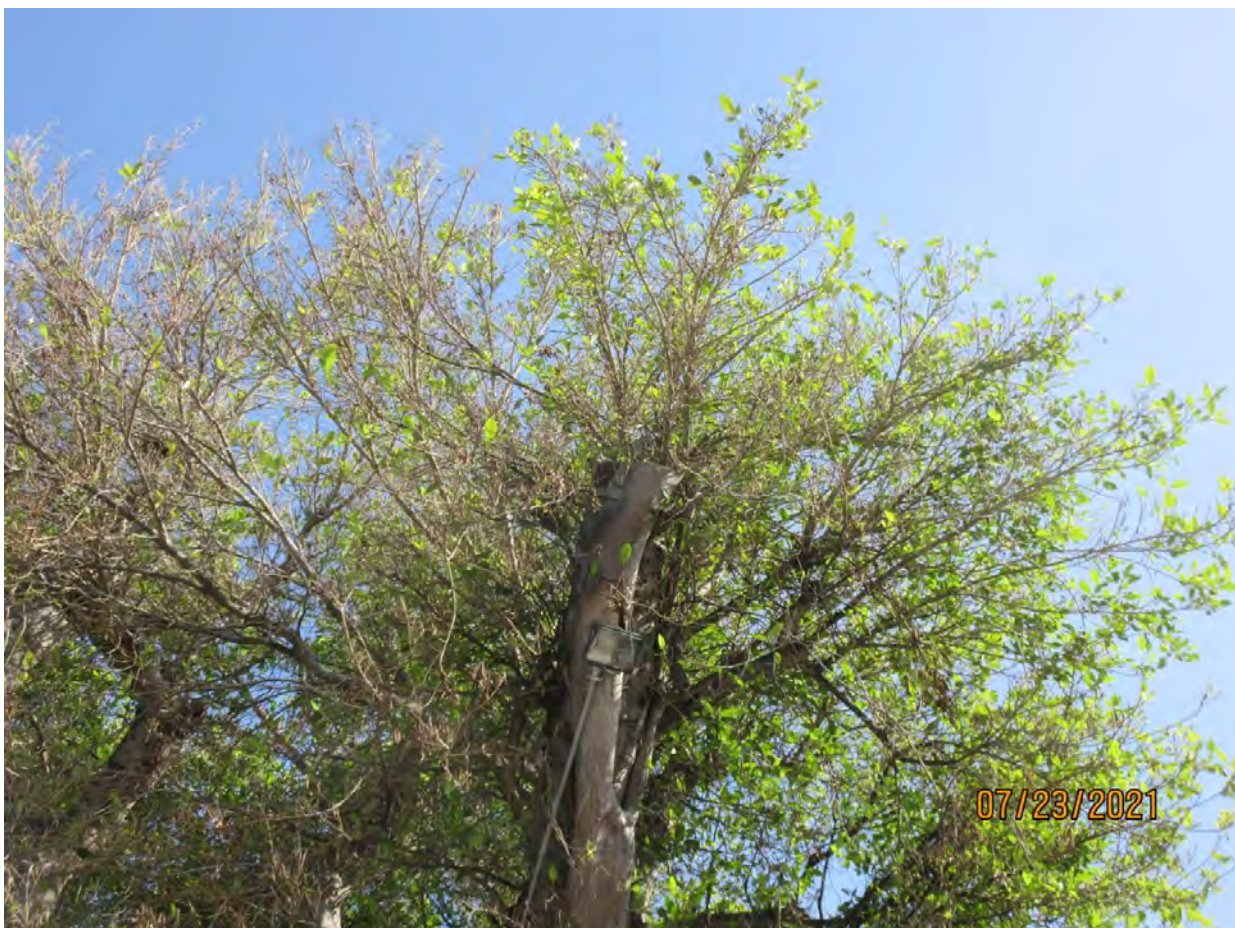
Photo of tree canopy edge, view 1.