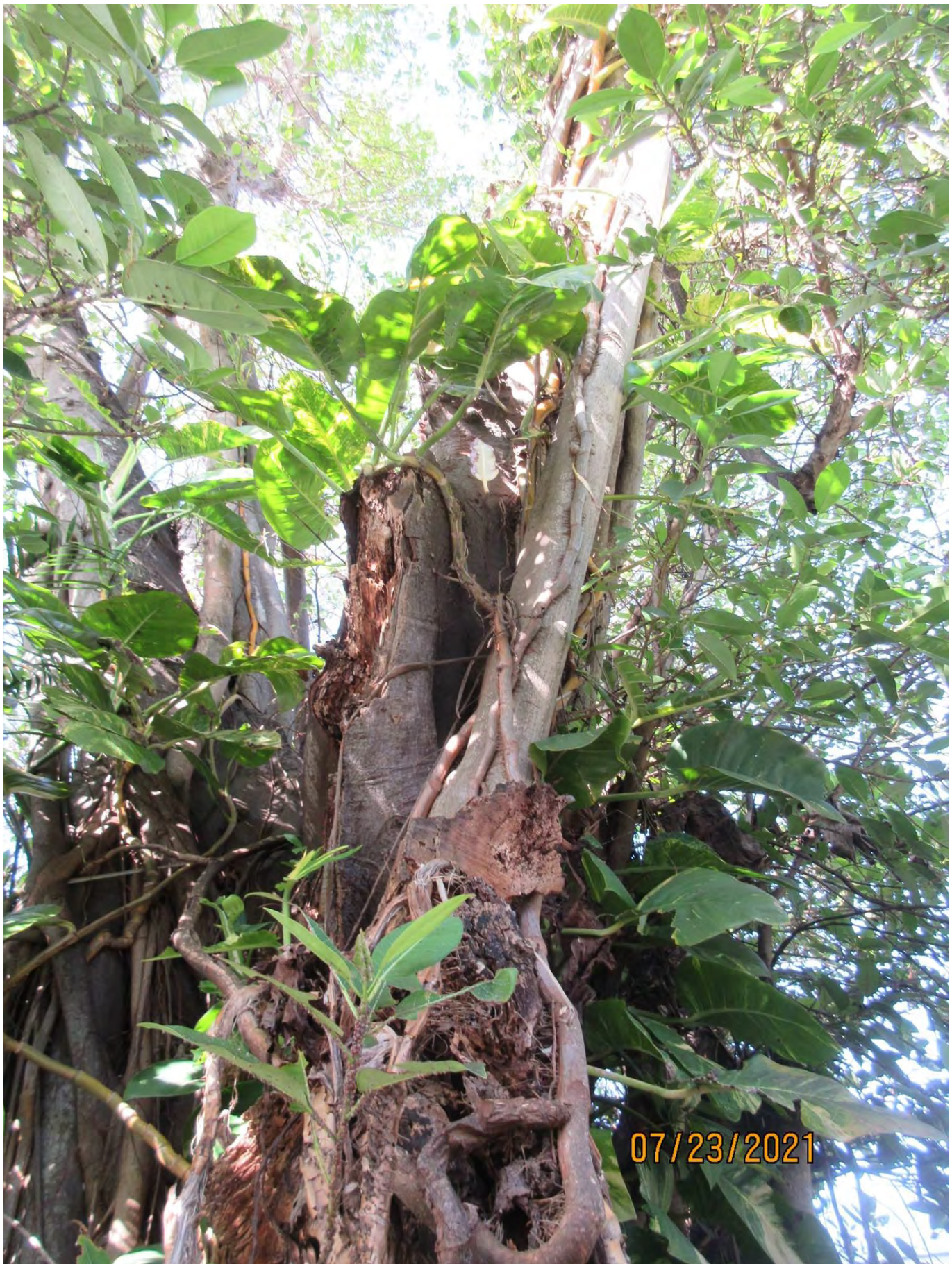
Photo showing some damaged and decay areas in main trunk-canopy area.