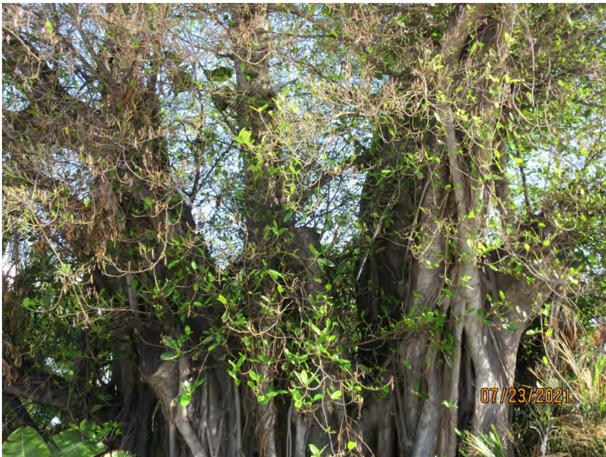
Photo of tree trunks in canopy, view 3.