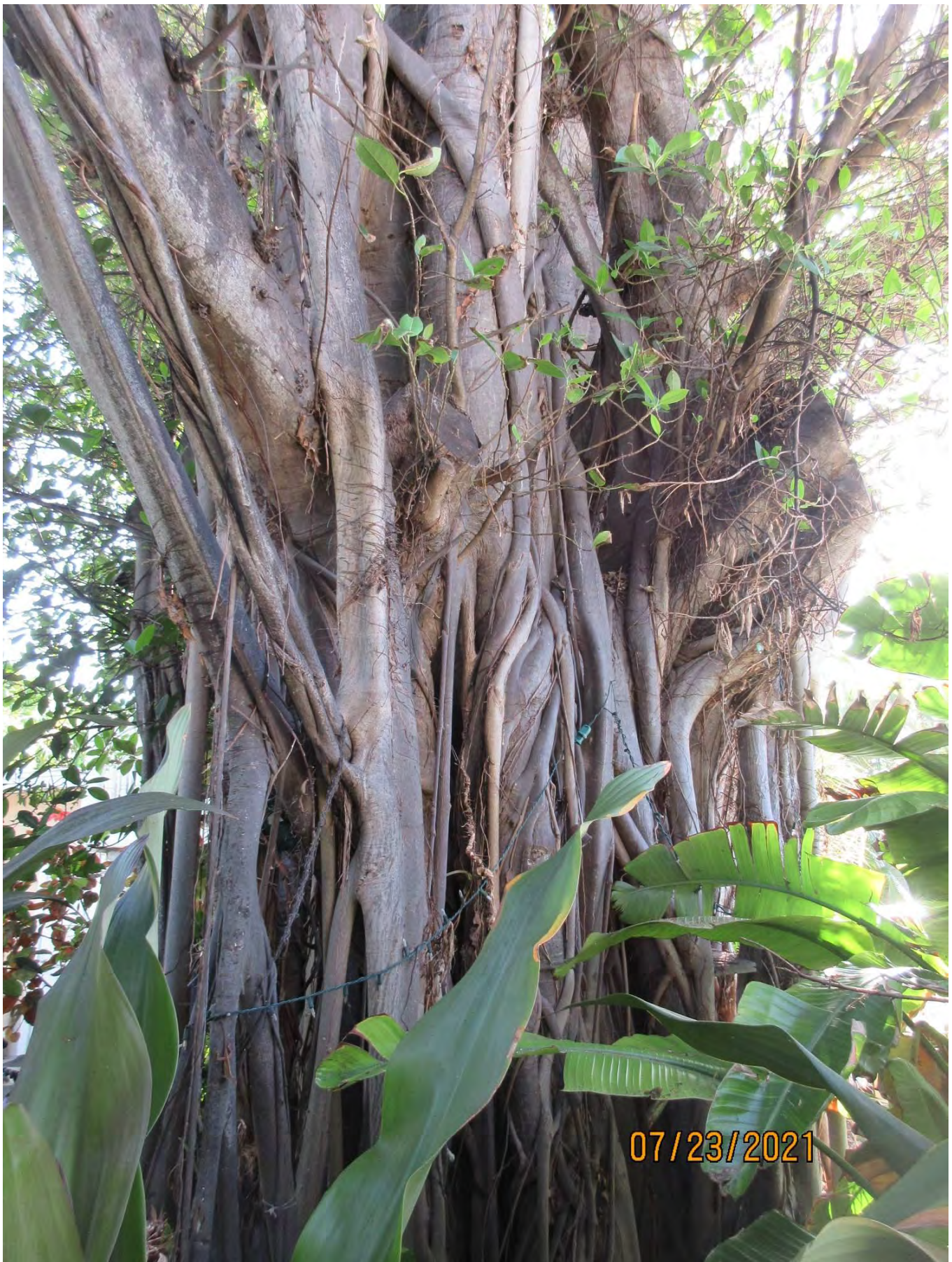
Photo of tree trunk near base, view 1.