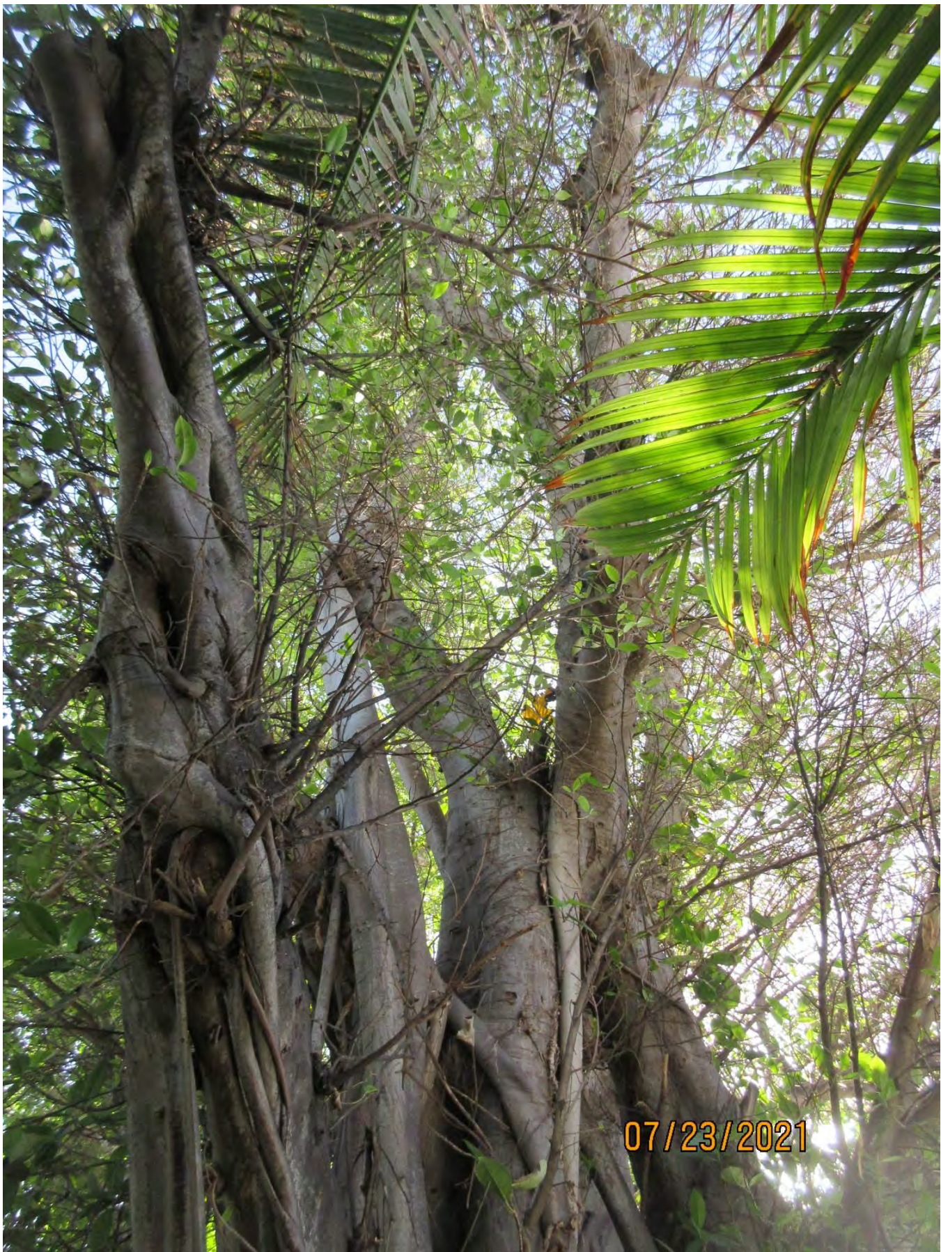
Photo of tree trunks in canopy, view 1.