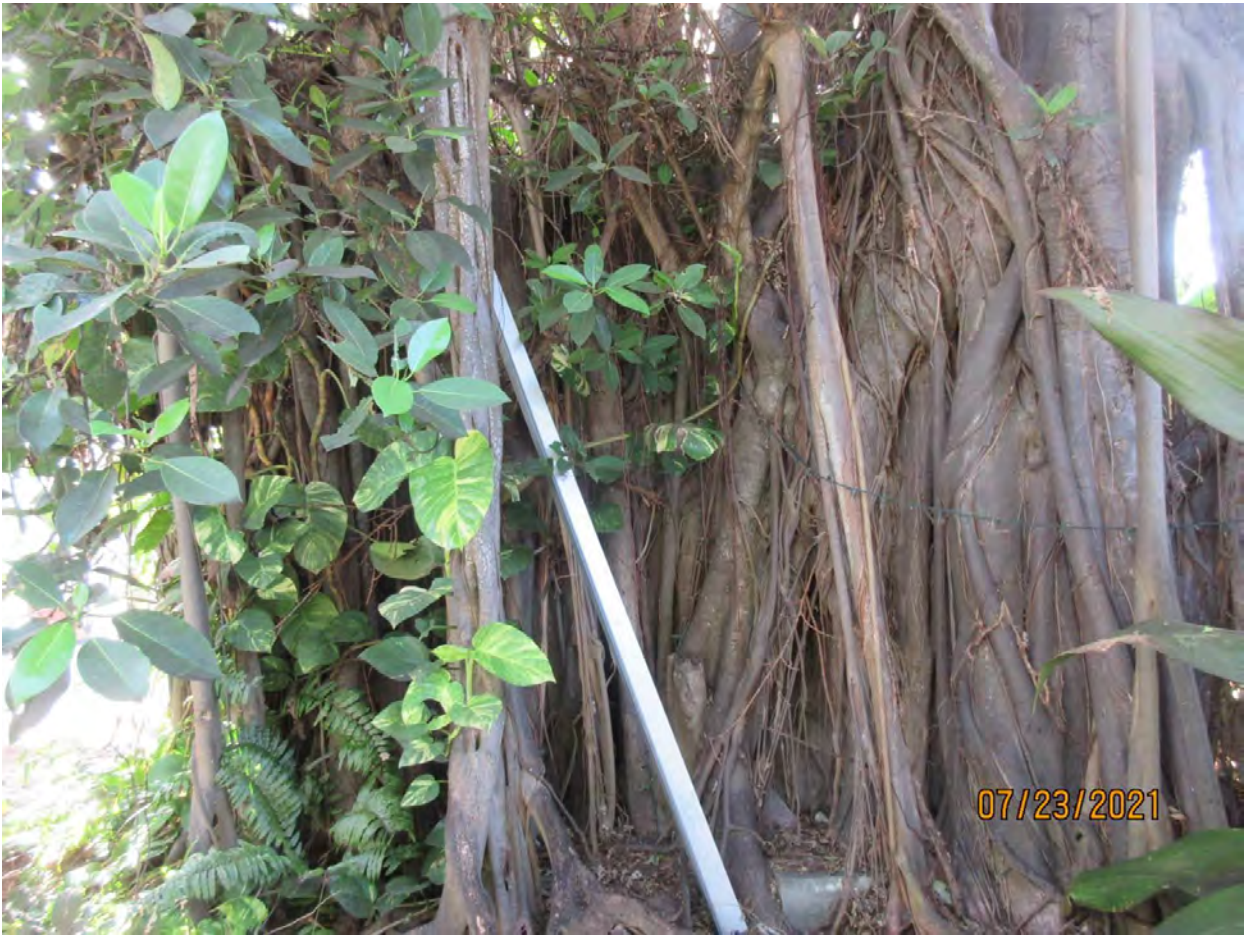
Photo of base and trunk of tree, view 1.