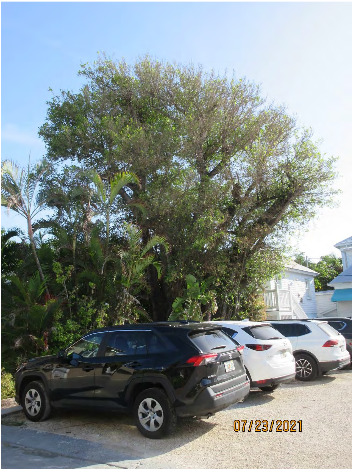
Photo of whole tree, view 2.