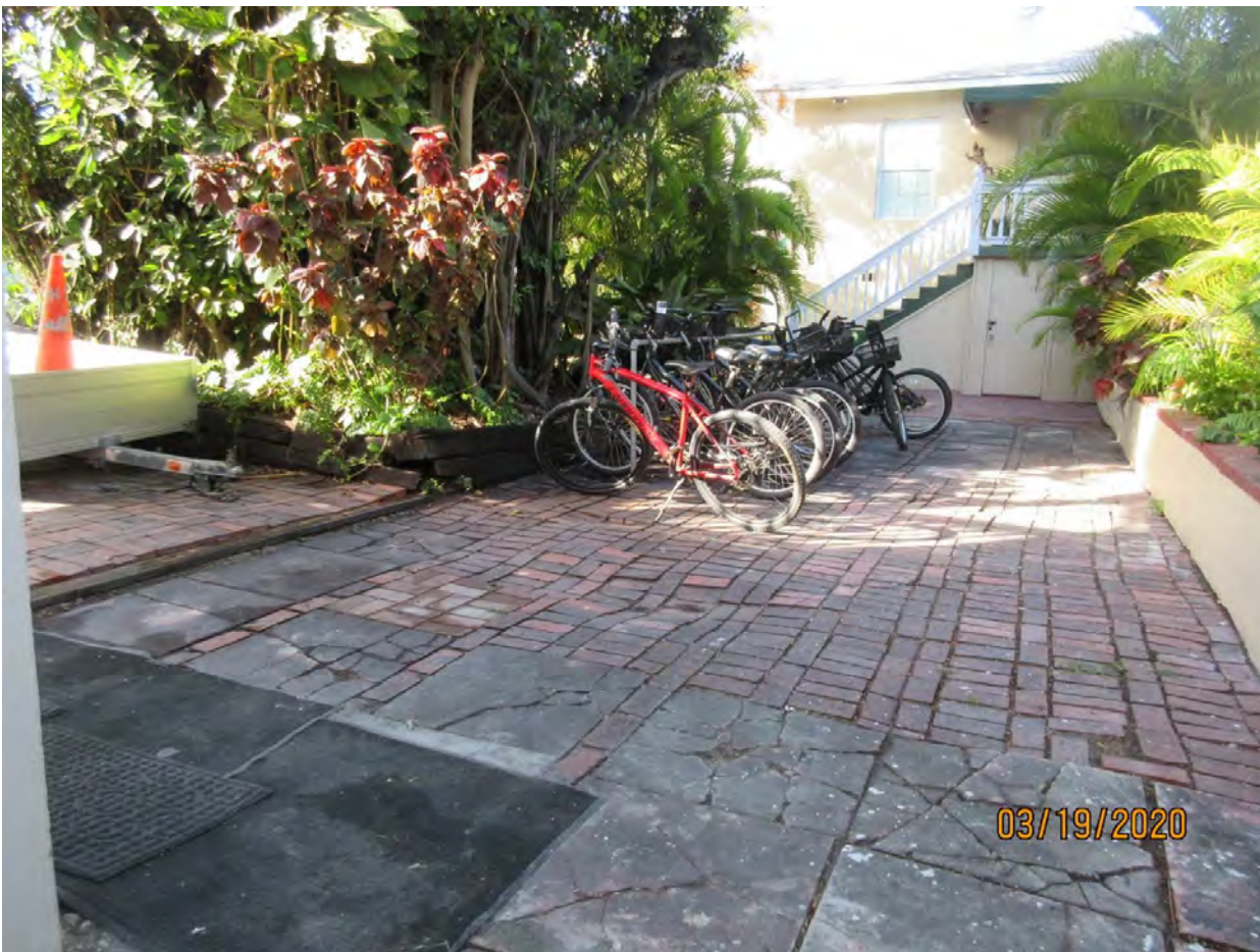
Photo of adjacent paver area and root impacts, view 2.