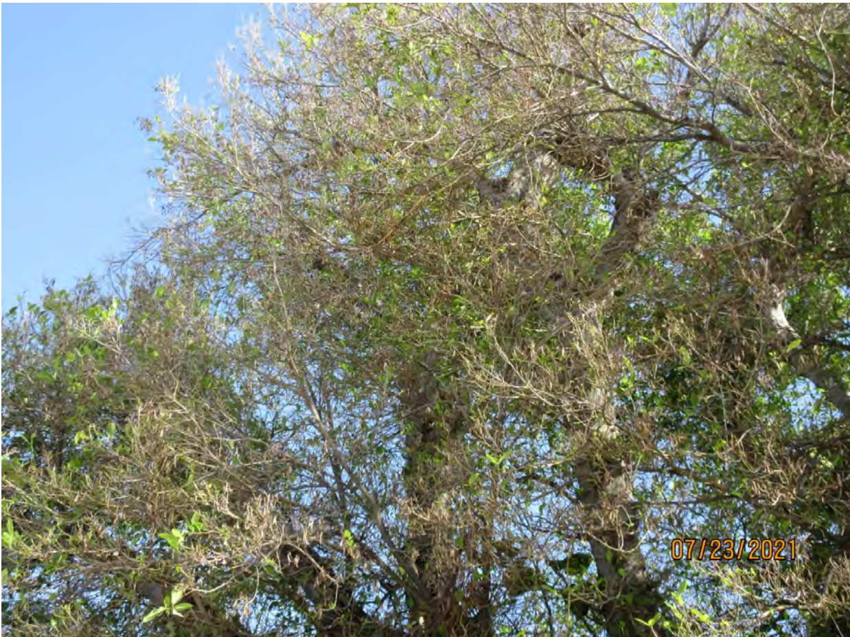
Photo of tree canopy edge, view 2.