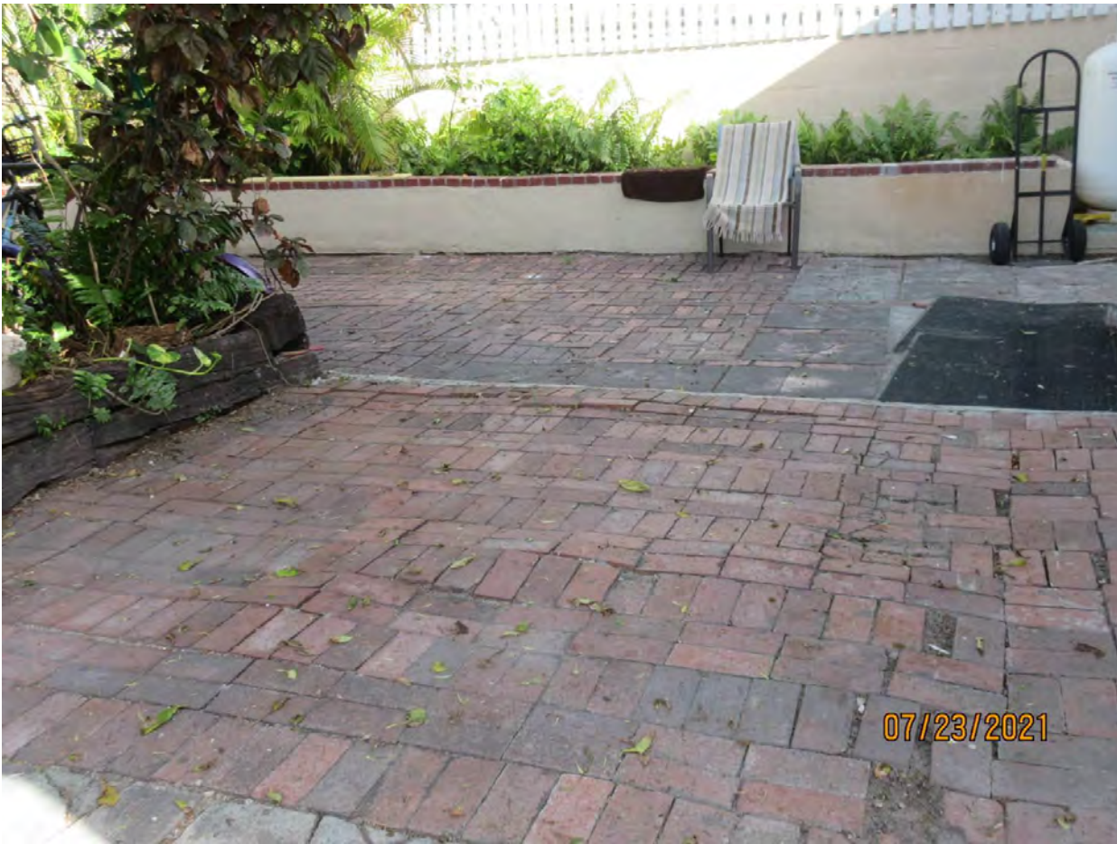
Photo of adjacent paver area and root impacts, view 1.