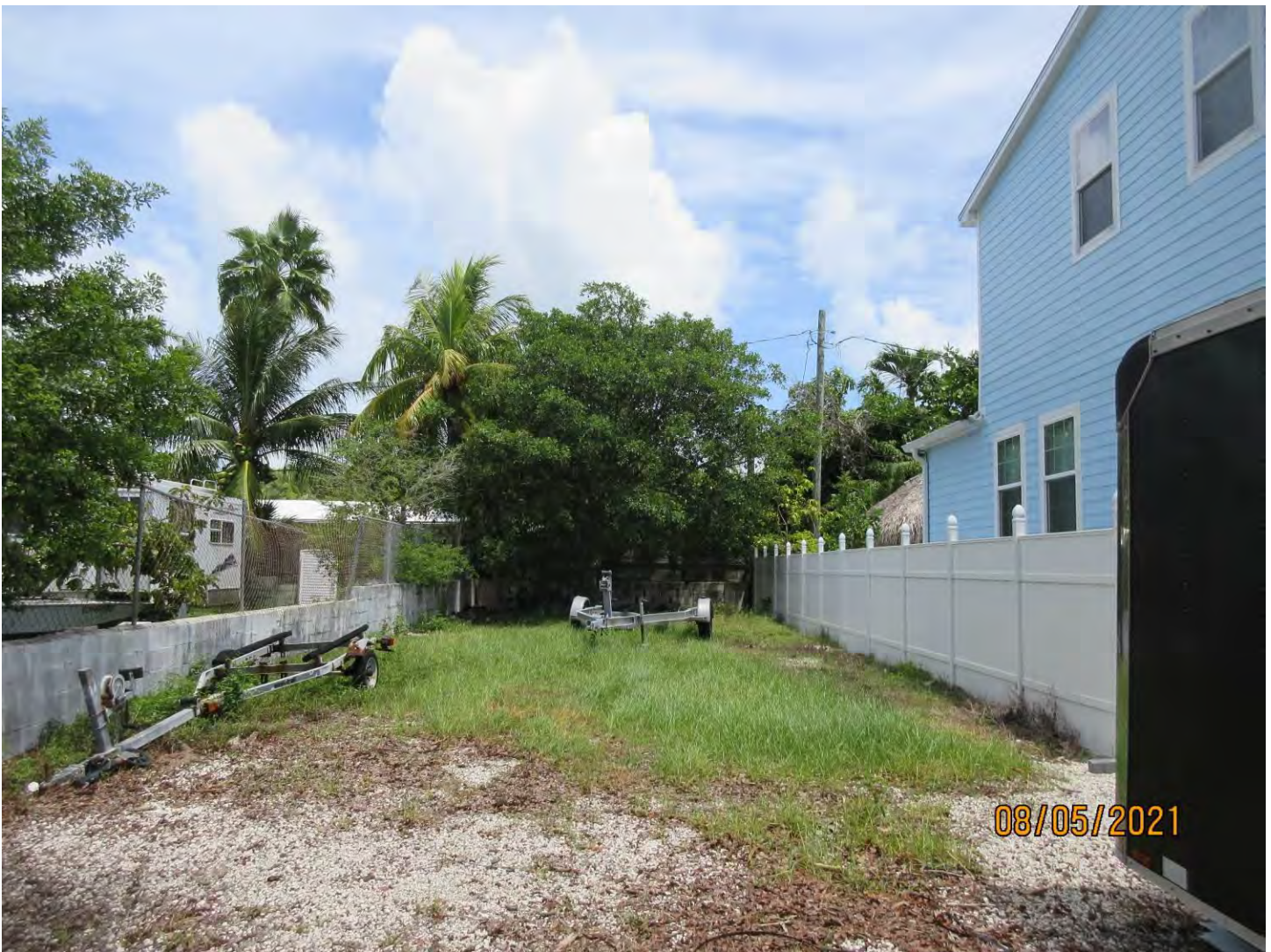
Photo showing location of tree.

Tree Species: Strangler Fig ( Ficus aurea )