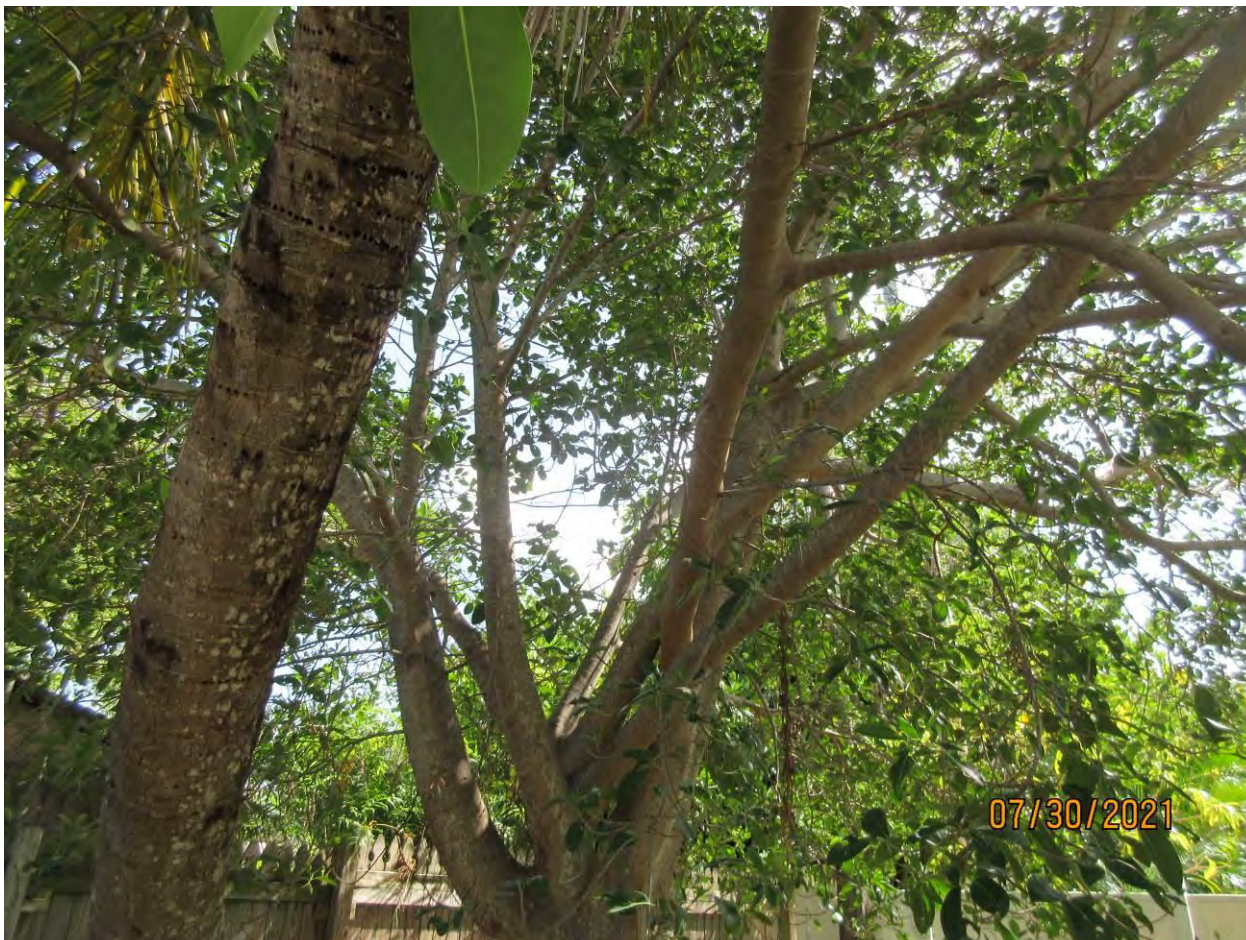
Photo of tree canopy, view 4.