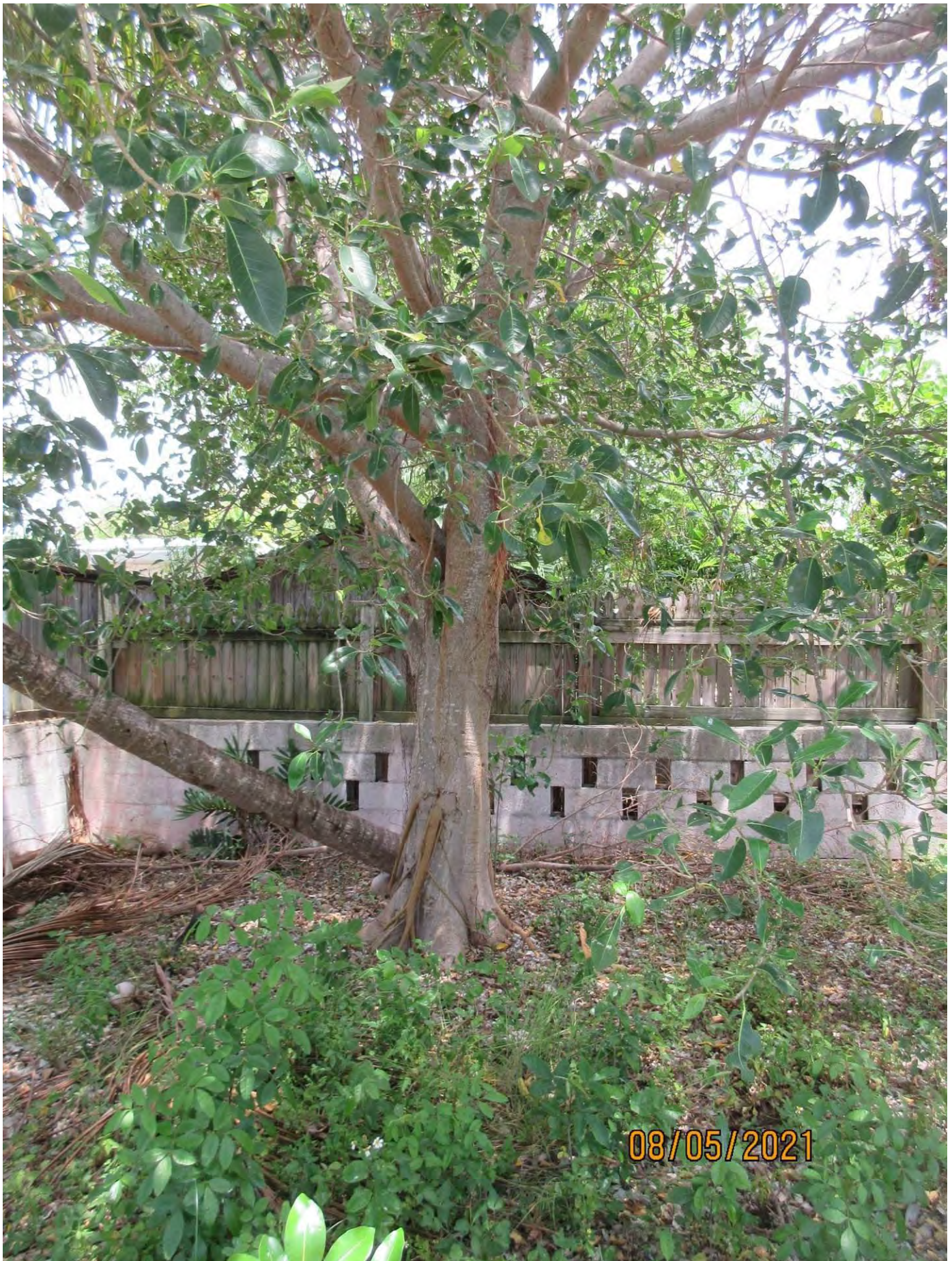
Photo of tree trunk and canopy branches, view 2.