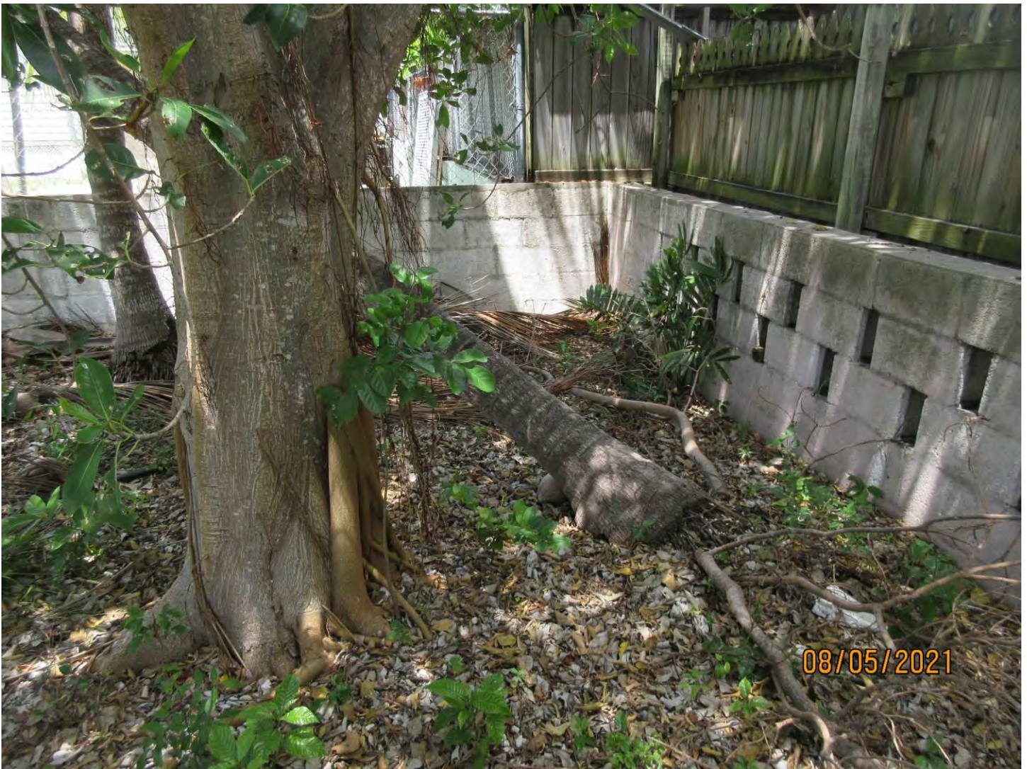
Photo of base and trunk of tree and location regarding rear property line.