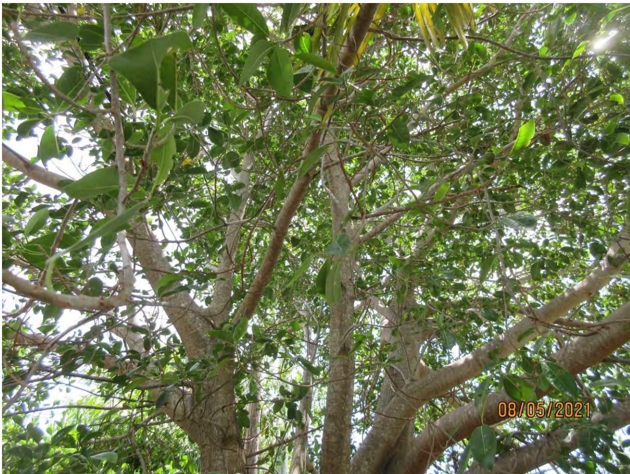
Photo of tree canopy, view 1.