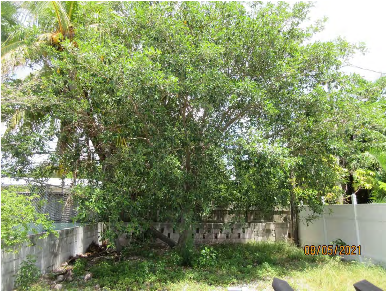
Photo showing entire tree.