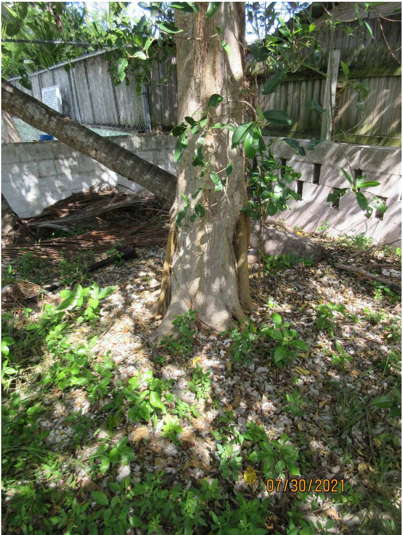
Photo of tree trunk, view 2.