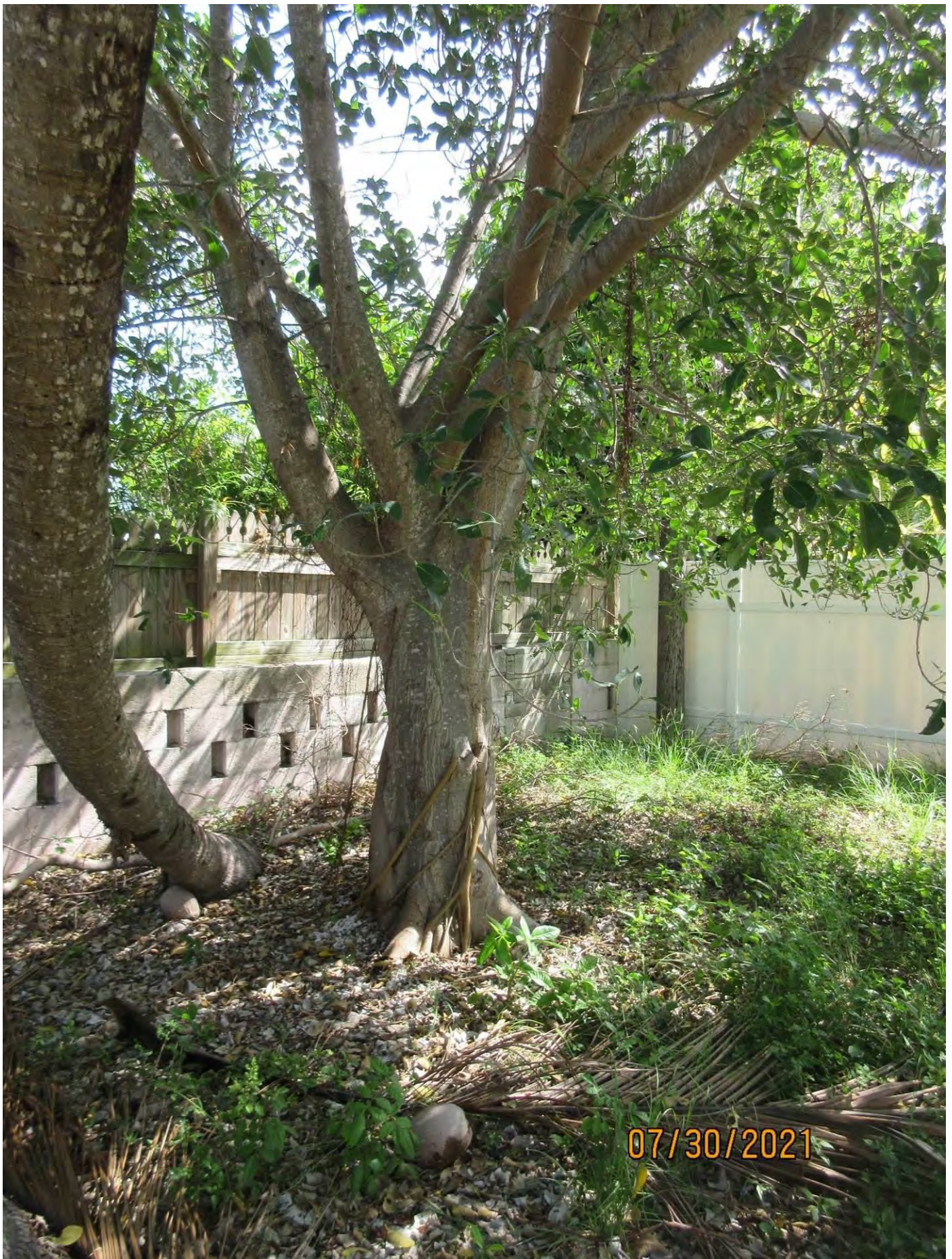
Photo of tree trunk and canopy branches, view 1.