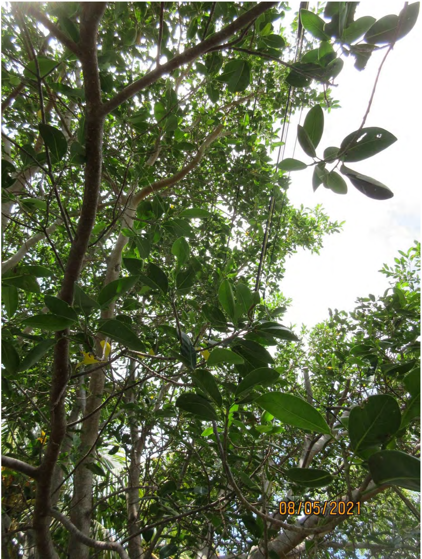
Photo of tree canopy showing location of rear utility lines.