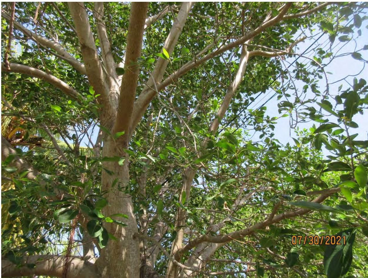
Photo of tree canopy, view 2.