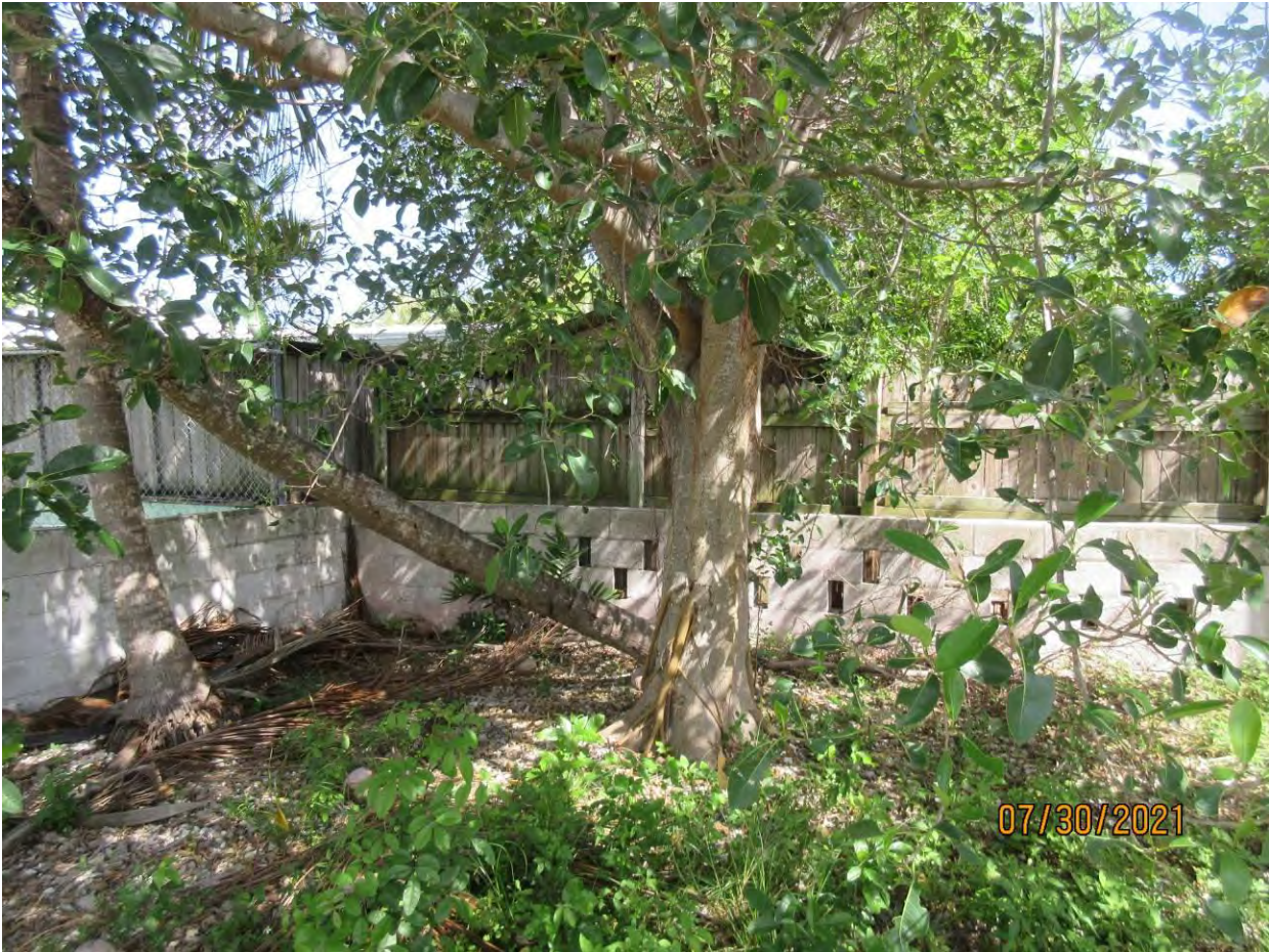
Photo of tree trunk, view 1.