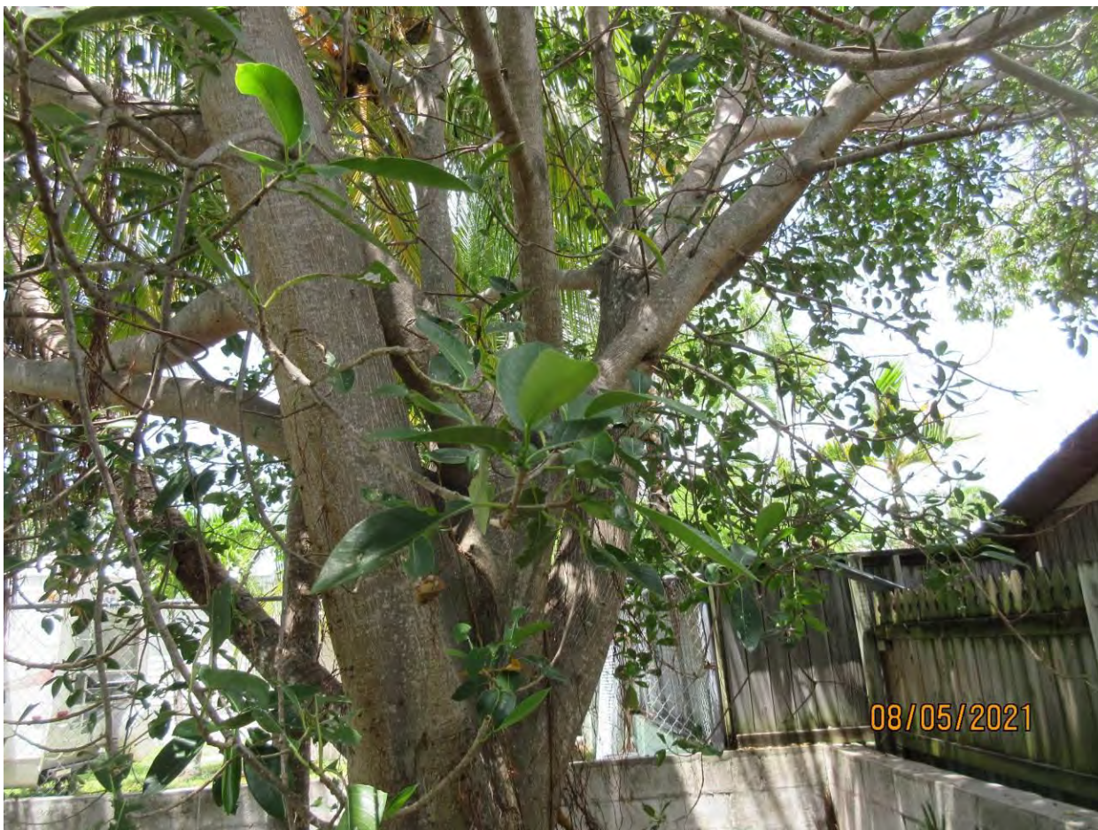
Photo of tree canopy, view 3.