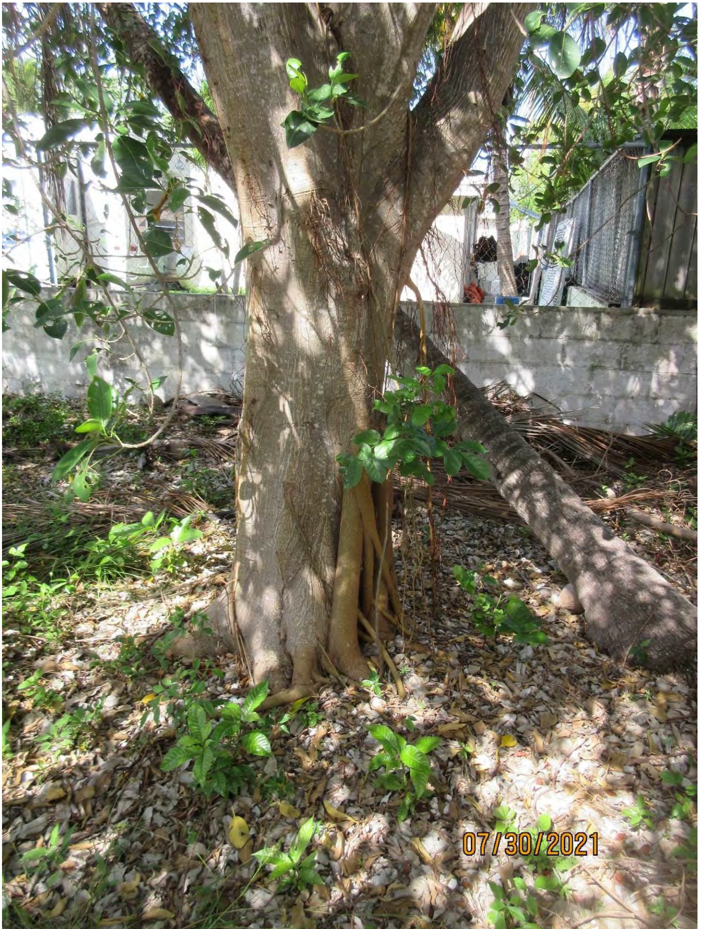
Photo of tree trunk, view 3.