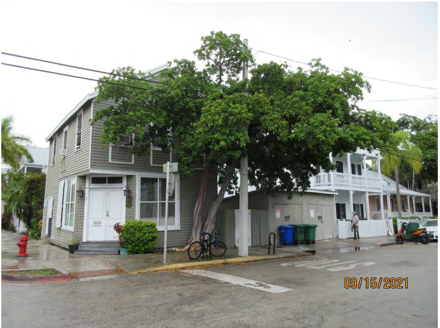
Photo showing location of tree on Margaret Street ROW.

Tree Species: Gumbo Limbo ( Bursera simaruba )