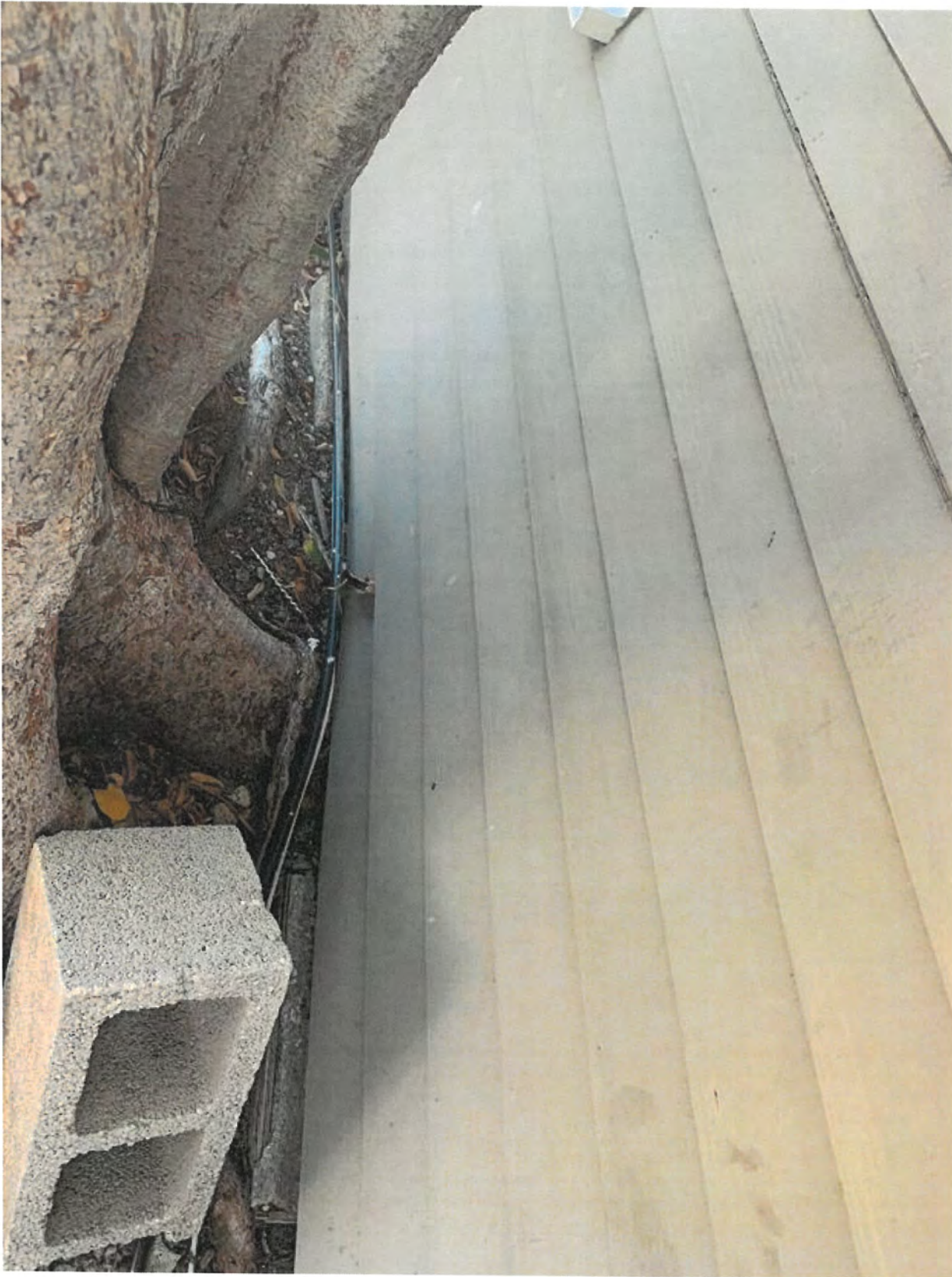
photo showing tree roots growing under structure.