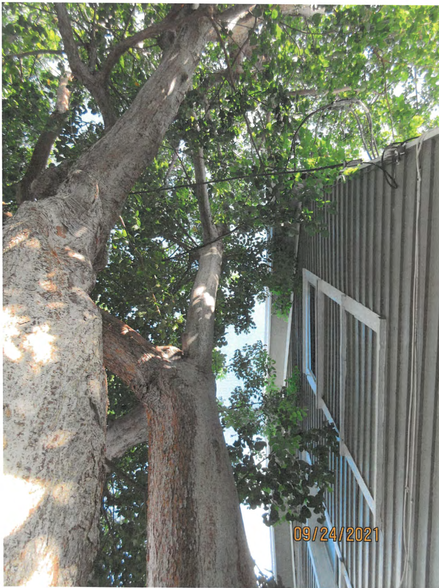
Photo showing tree canopy, utility lines, and structure. KSD