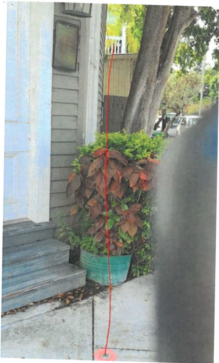
Photo showing approximate property line. RD