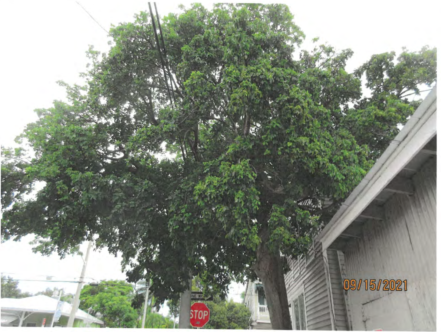
photo of tree canopy. ko