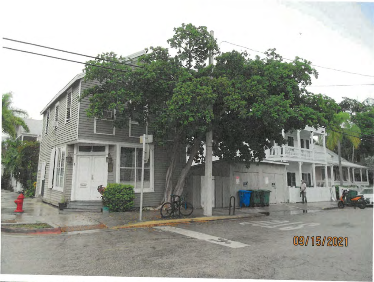
Photo showing location of tree.