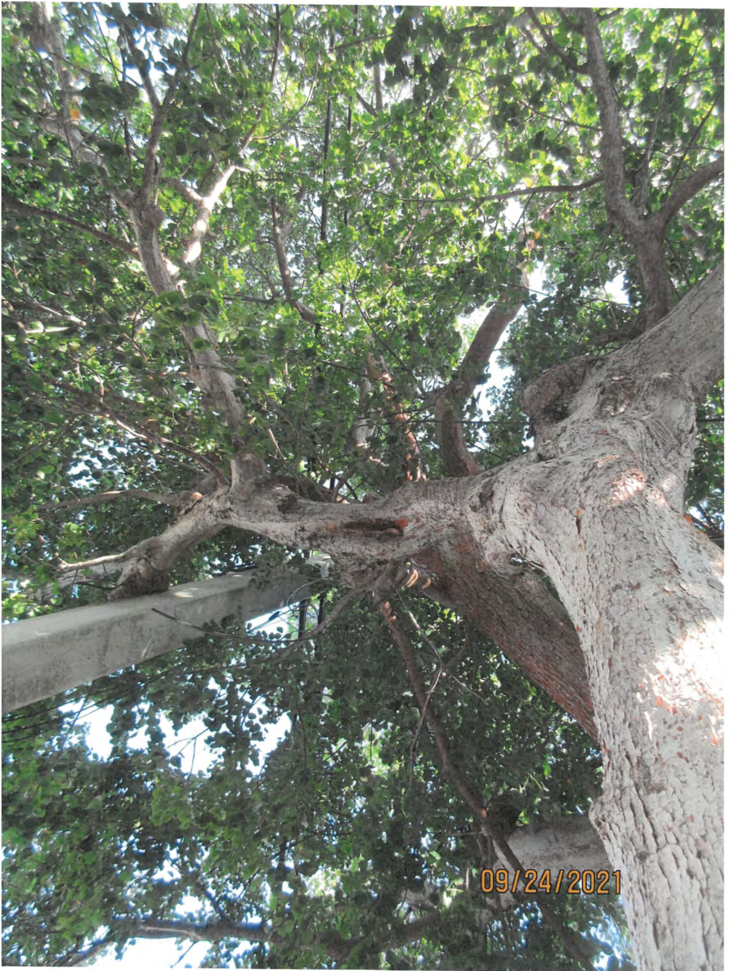
Photo showing tree canopy, and utility pole. ks