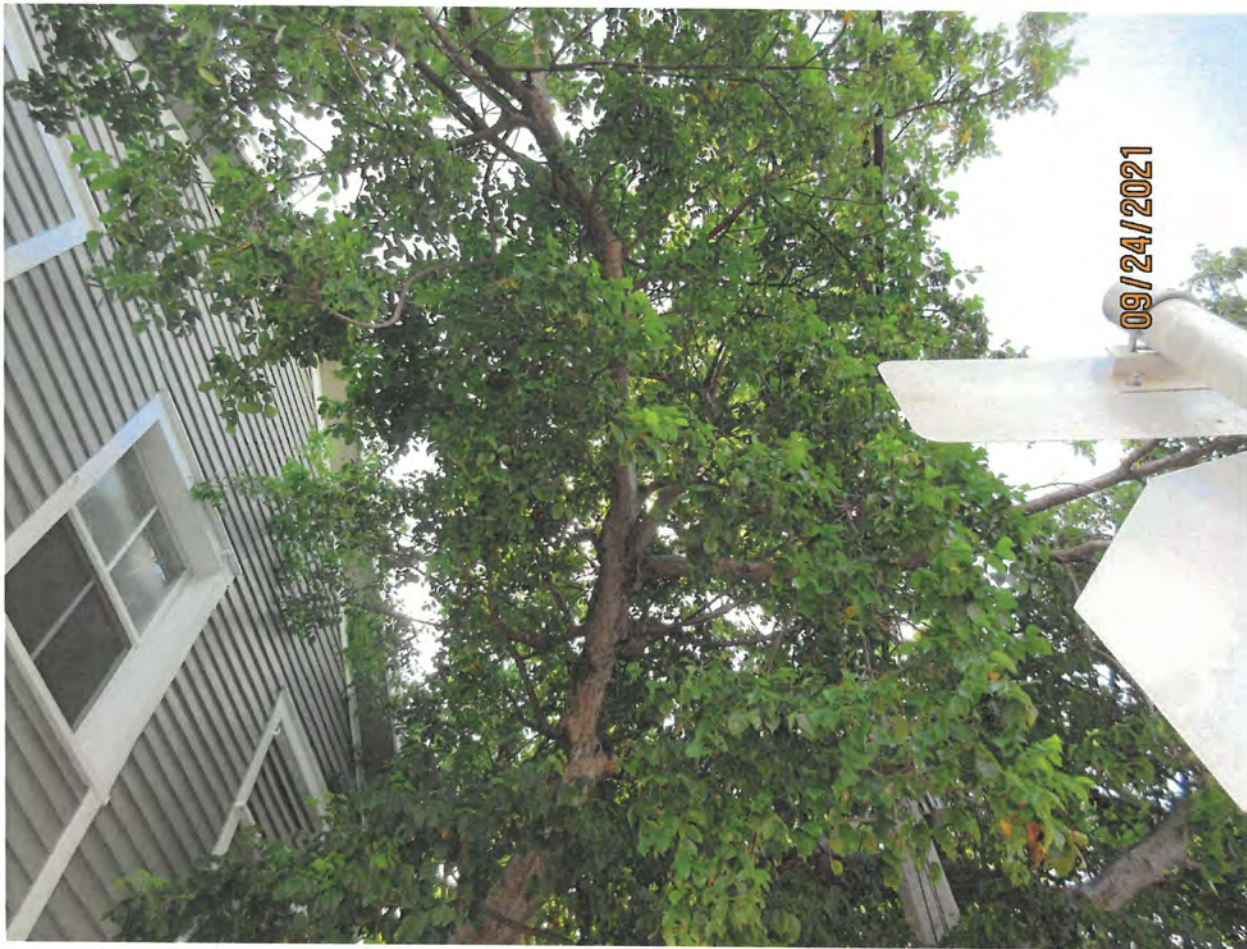
Two photos showing tree canopy.