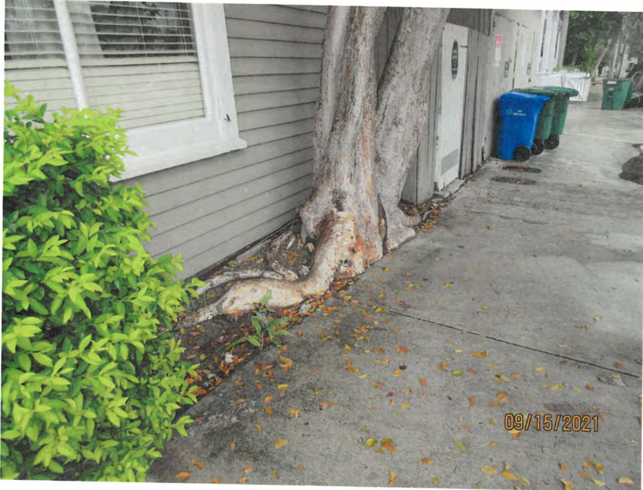
Photo showing base of tree between structure and sidewalk.