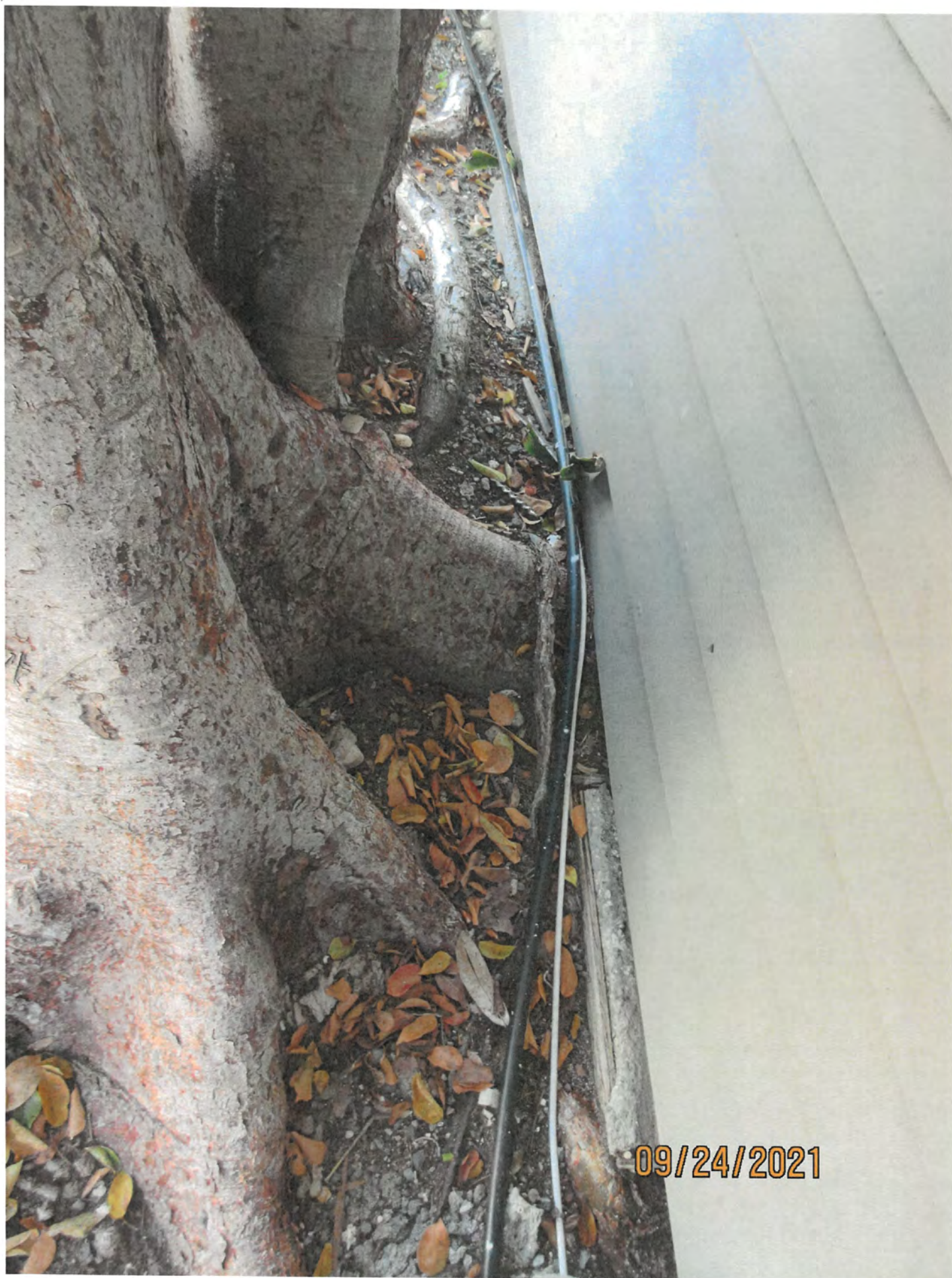
Photo showing tree roots growing under structure.