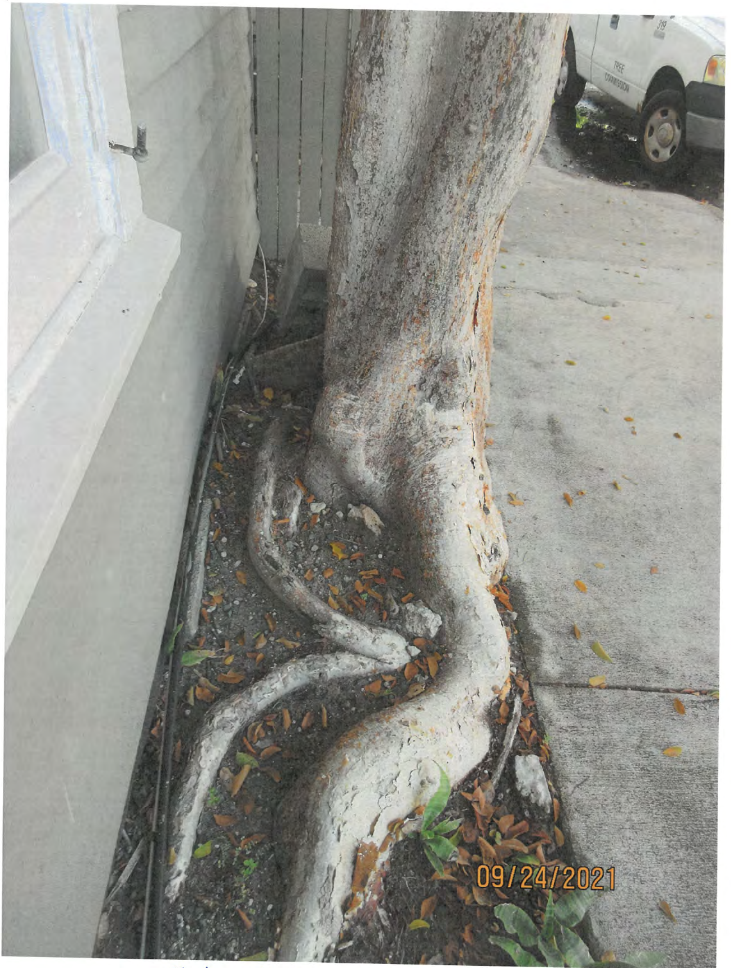
Photo of tree root system.