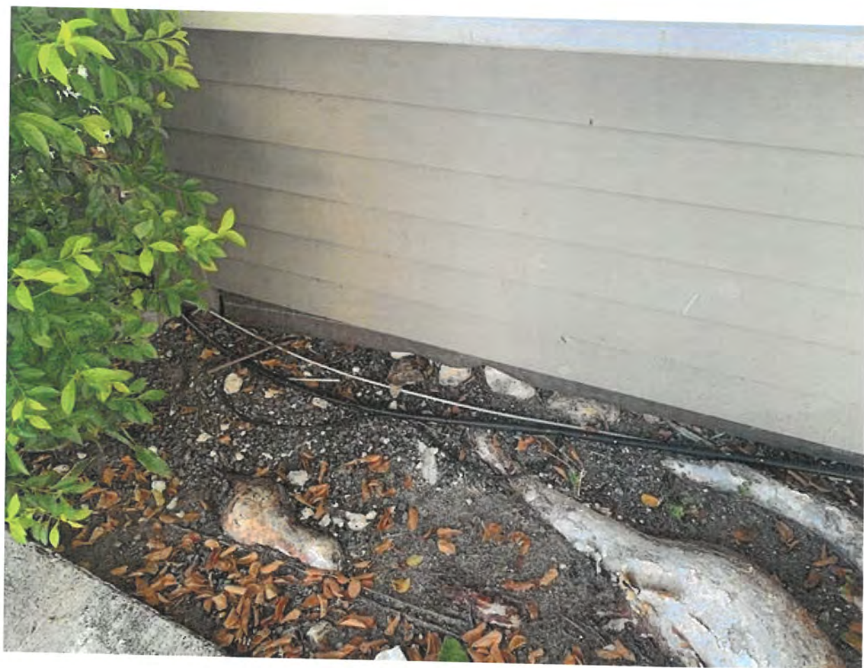
Photo of tree roots and structure. 100