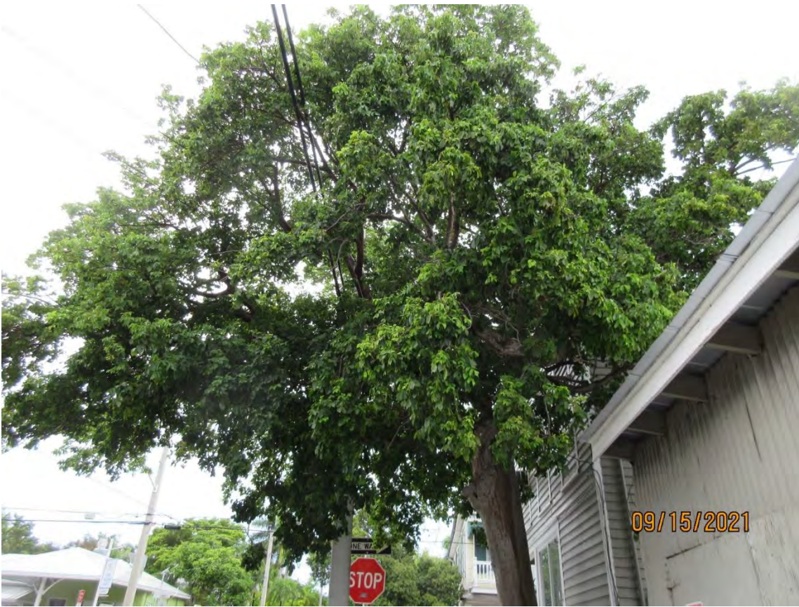
Photo of tree canopy.