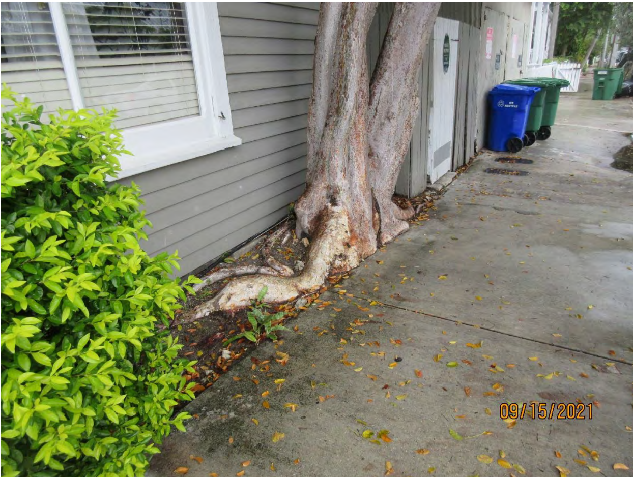
Three photos showing base of tree and growth of roots toward historic structure.