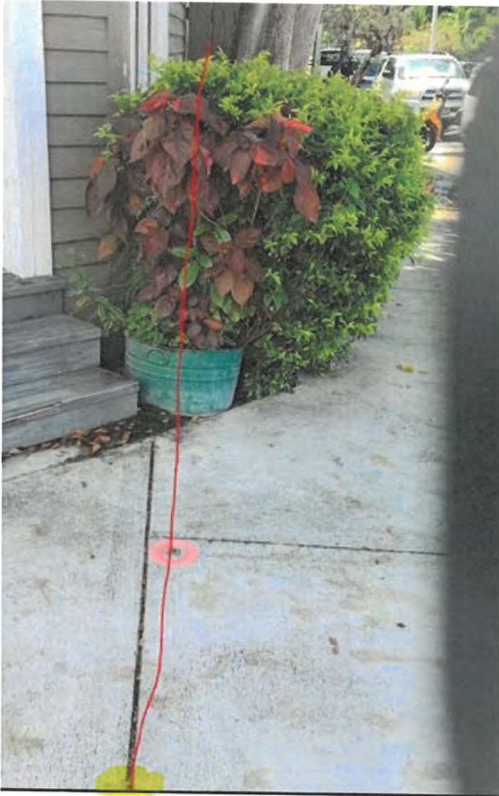
photo showing approximate property line. 100

It's my belief that said tree is on the City RoW. The immediate house appears to be on or very close to the line. Some of the buildings in the vicinity clearly extend beyond the PL as depicted in the bottom clip.