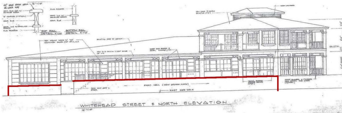
Location of proposed mural

The proposed mural is not part of required art under the Art in Public Places Program, but a contribution from the owner to enhance the existing conditions of her private commercial property. The owner has been inspired by the City’s new design of Clinton Square and wants to become an integral part of enhancing this area of the historic district.