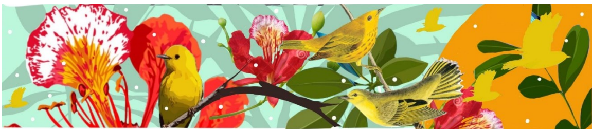
Details of proposed mural.