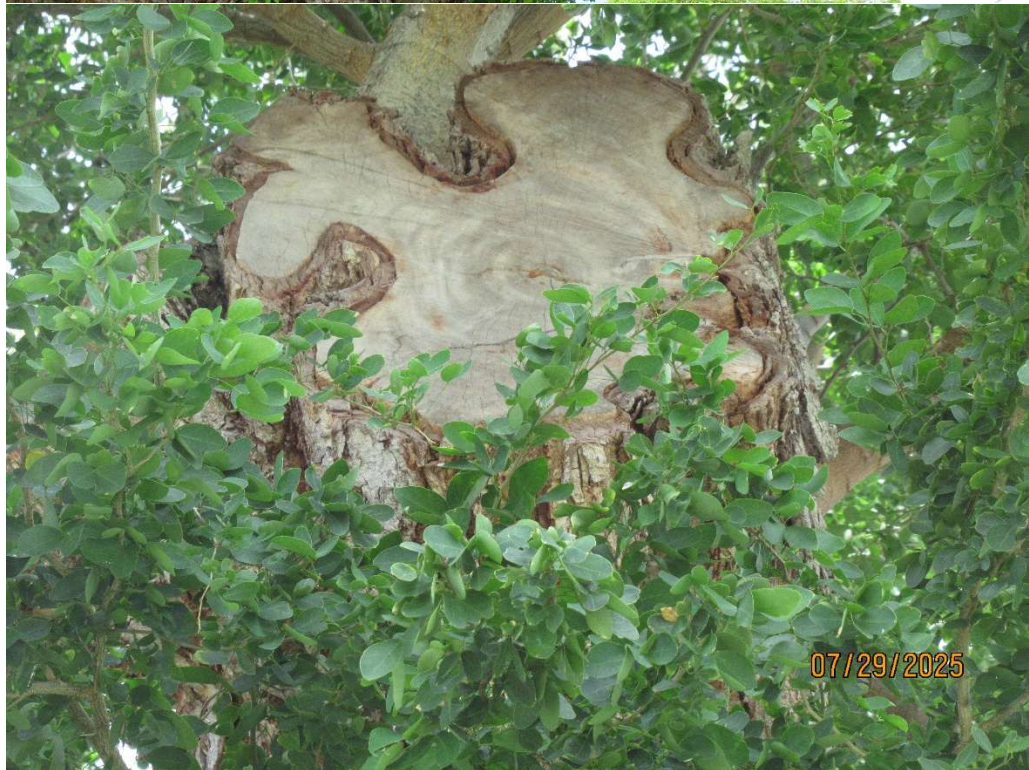
Top photo of large limb that was trimmed after it broke off. Bottom photo shows a large limb that had to be cut back.