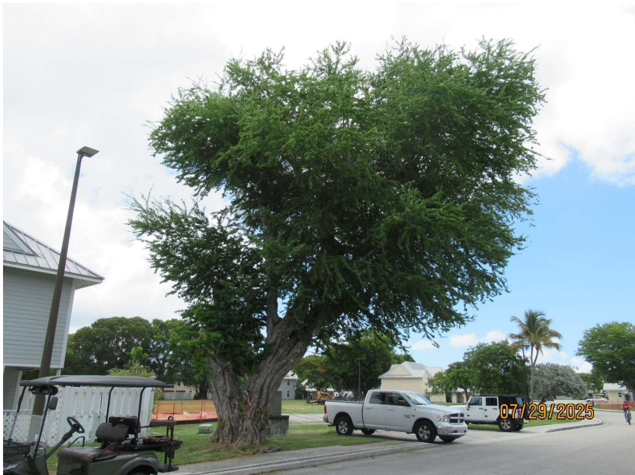
Photo of the tree looking East.