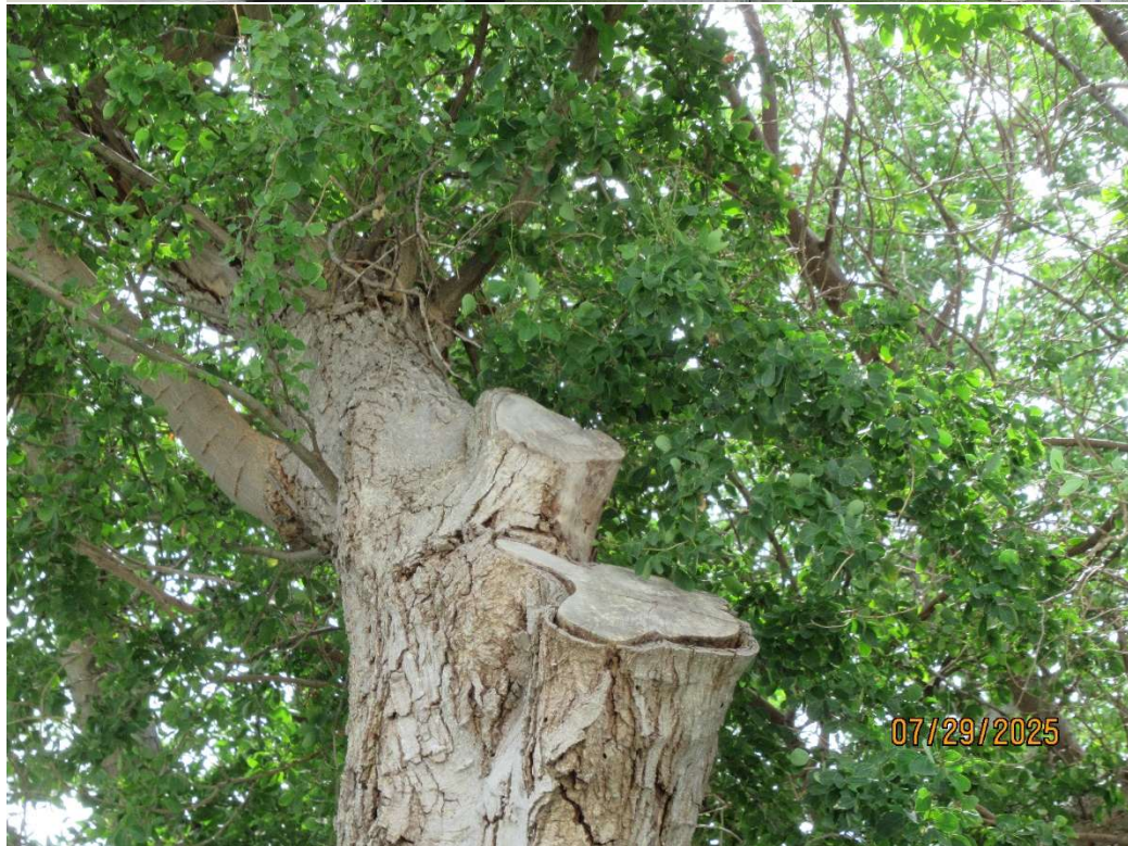
Top photo of tree looking West. Bottom photo shows large cuts made after large limbs broke in a storm.