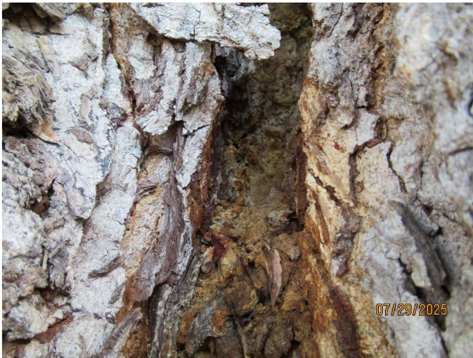
Photos of termite damage.