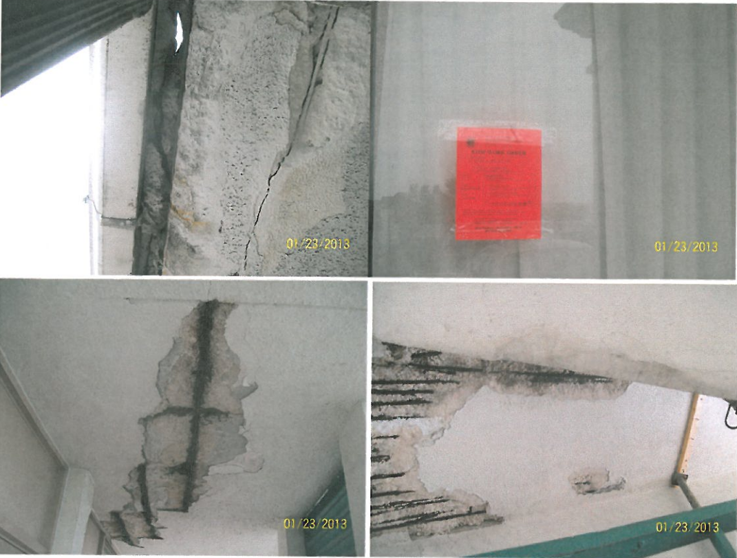
Stairs, balconies, landings and platforms opened to guest's traffic

Case # 13-130 3820 N Roosevelt "Comfort Inn"