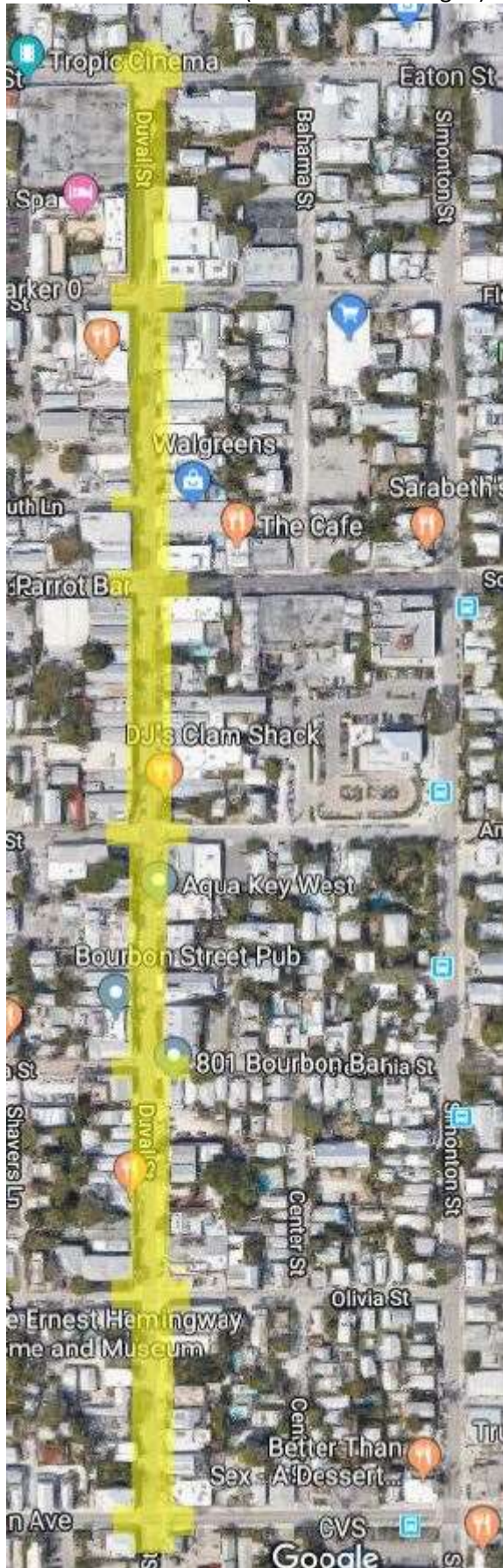
Exhibit 2 – AREA 2: County owned Road Segments Duval (Eaton St. – Truman Ave) Whitehead (Eaton St. – Fleming St)