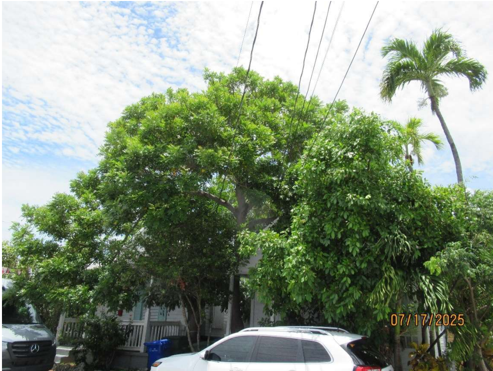
Canopy view standing in front of 1215 Eliza St.