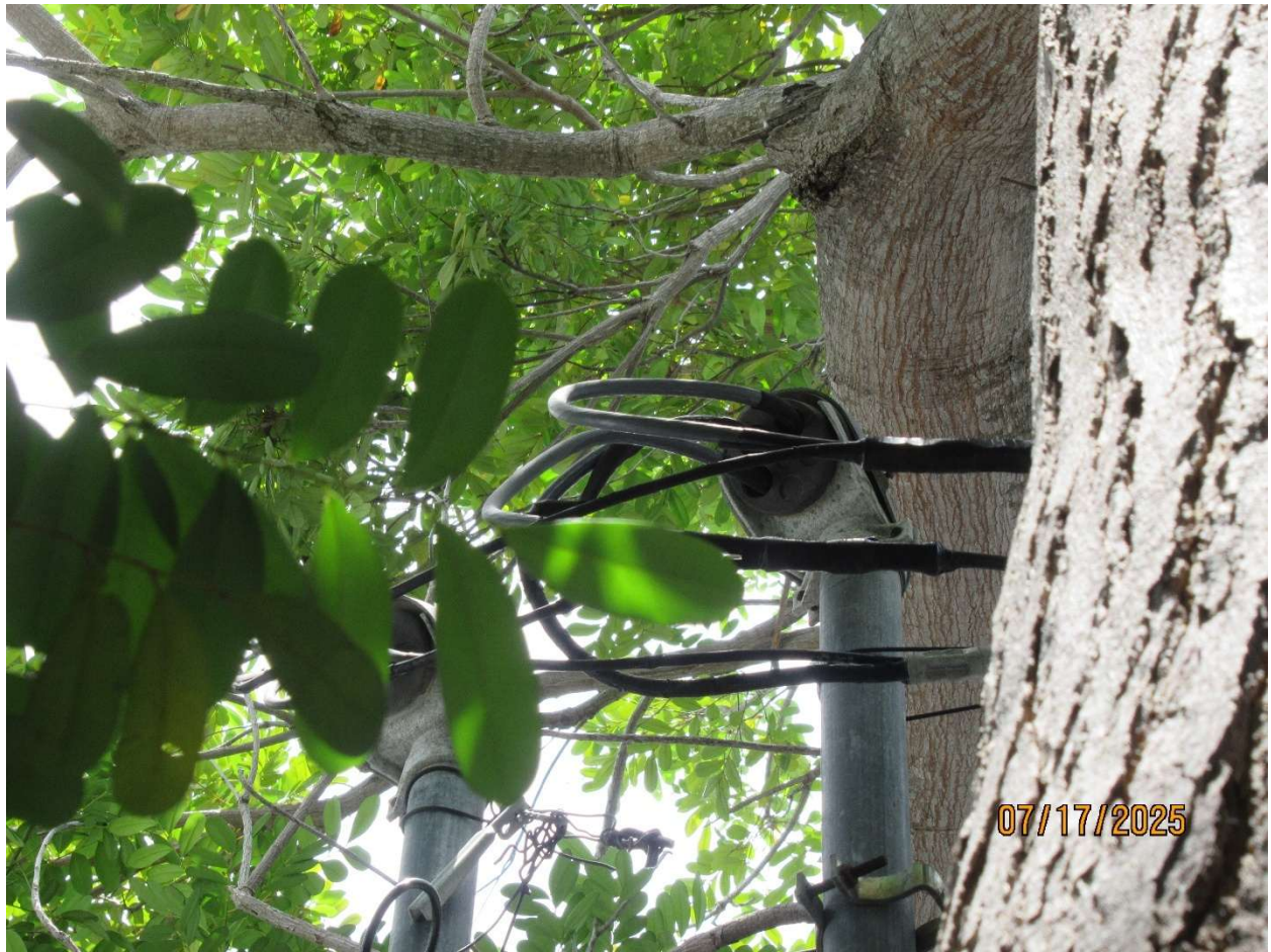
Close up of the electrical service stack for 1215 Eliza St.