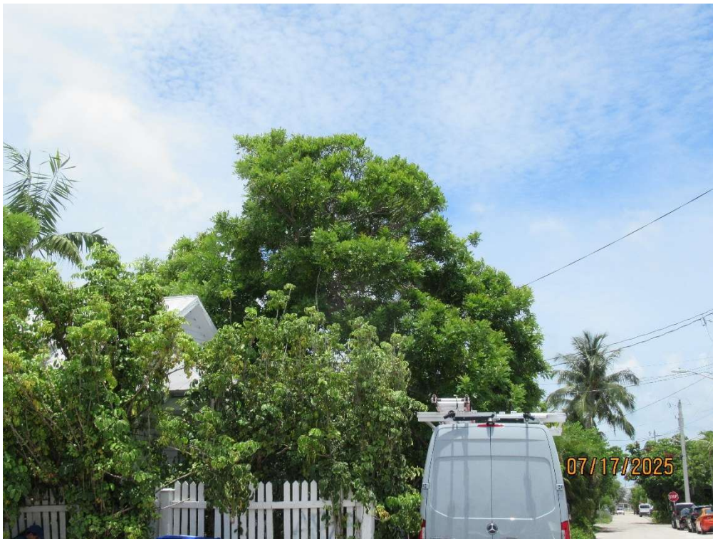
Canopy view looking East-northeast