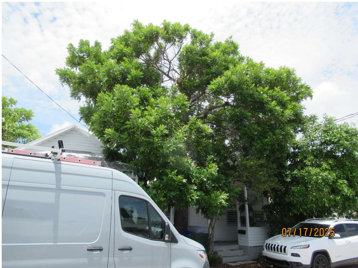
Canopy view standing in front of 1213 Eliza St