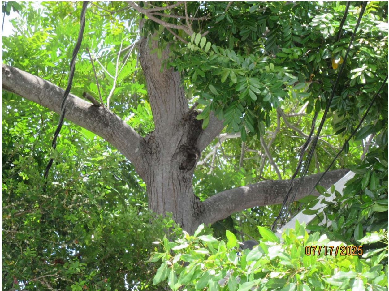
Two of the tree's main leaders hanging just above power conductors for 1213(left) 1215(right) Eliza St.