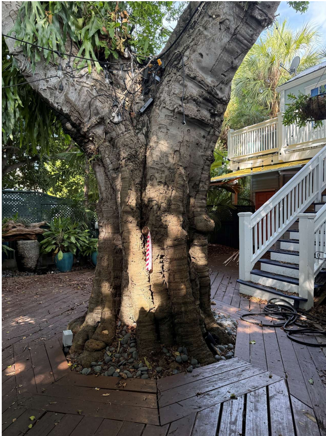
Tree appears to be well over 100 years, although I do not have record of its origin.