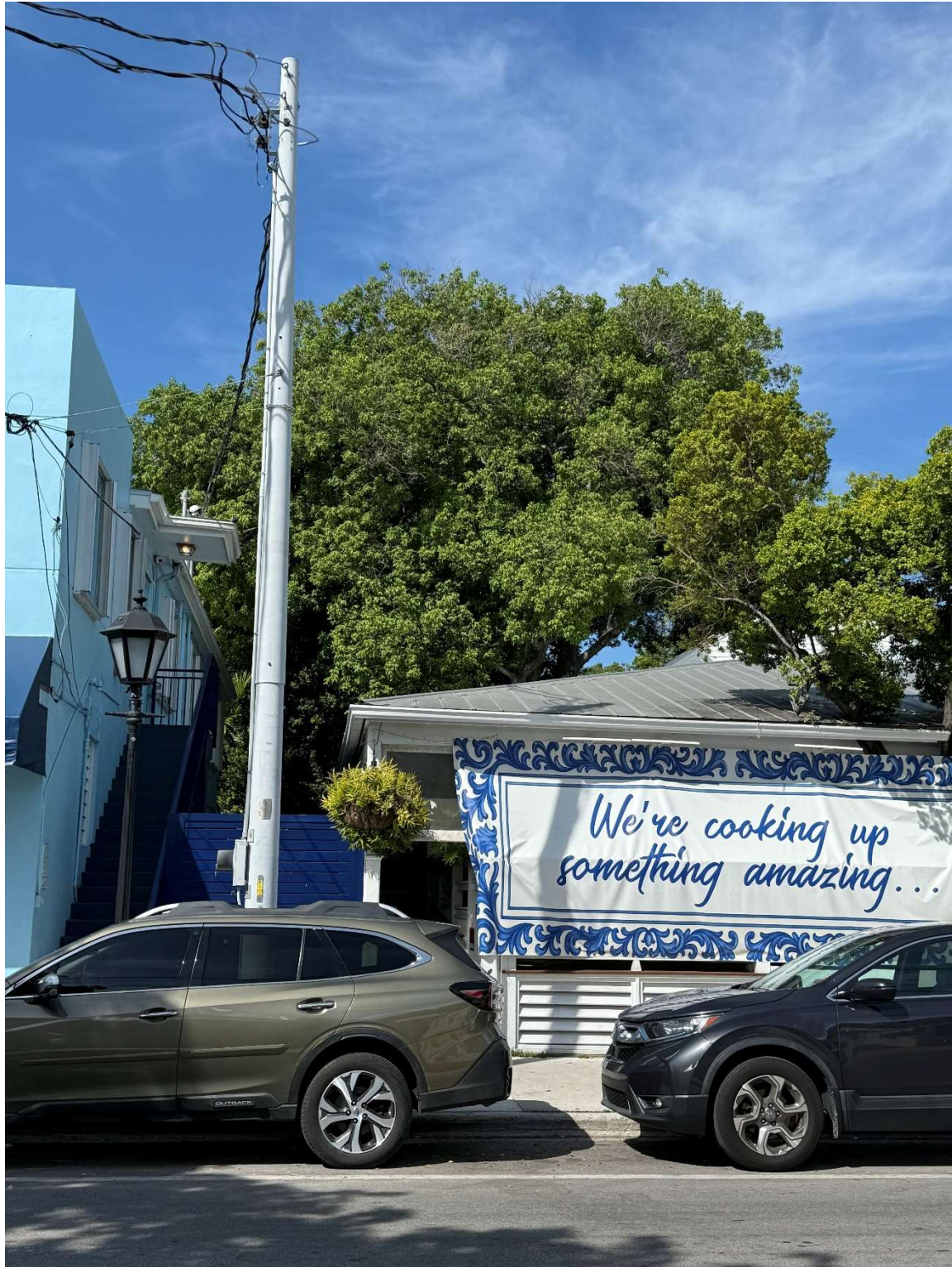
Tree can be seen from Duval Street if you stand across the street.