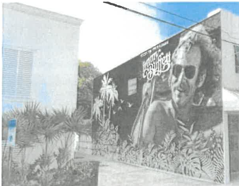
Photoshop of mural.

The mural will be in honor of Jimmy Buffett and will depict his face and some tropical flora and birds. The artwork will be over a dark base and light color tones will create the images. A parrot with bright