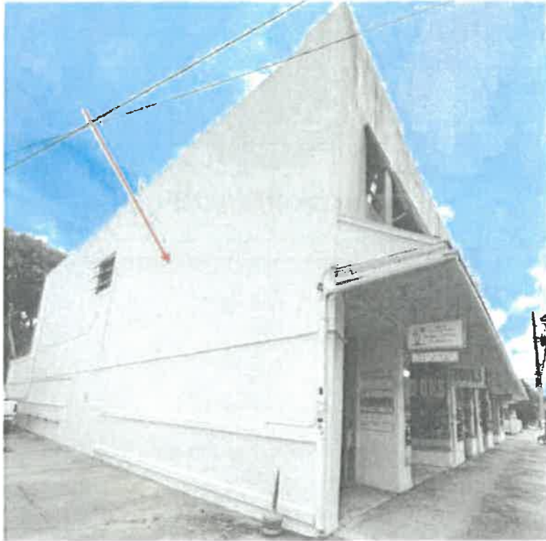
Current photograph of where the mural is proposed.