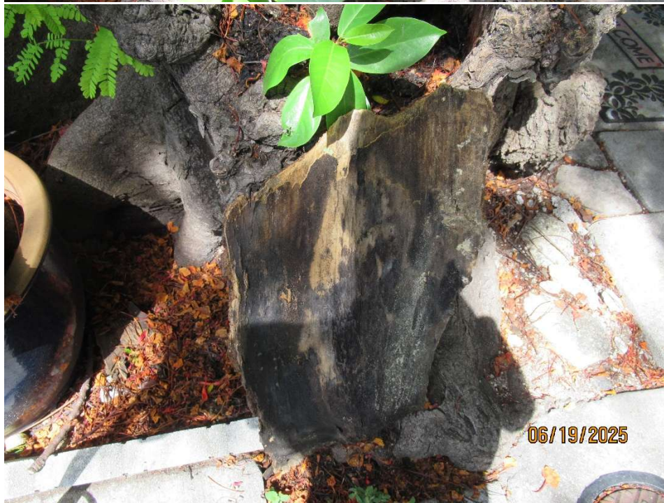
Both photos show a large hole at base of trunk with large sheet of old bark that has fallen off.