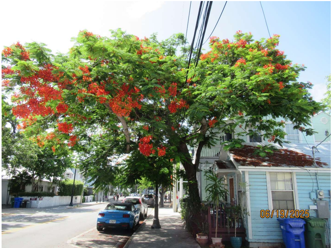
Photo of tree looking towards the Southeast down Whitehead St.