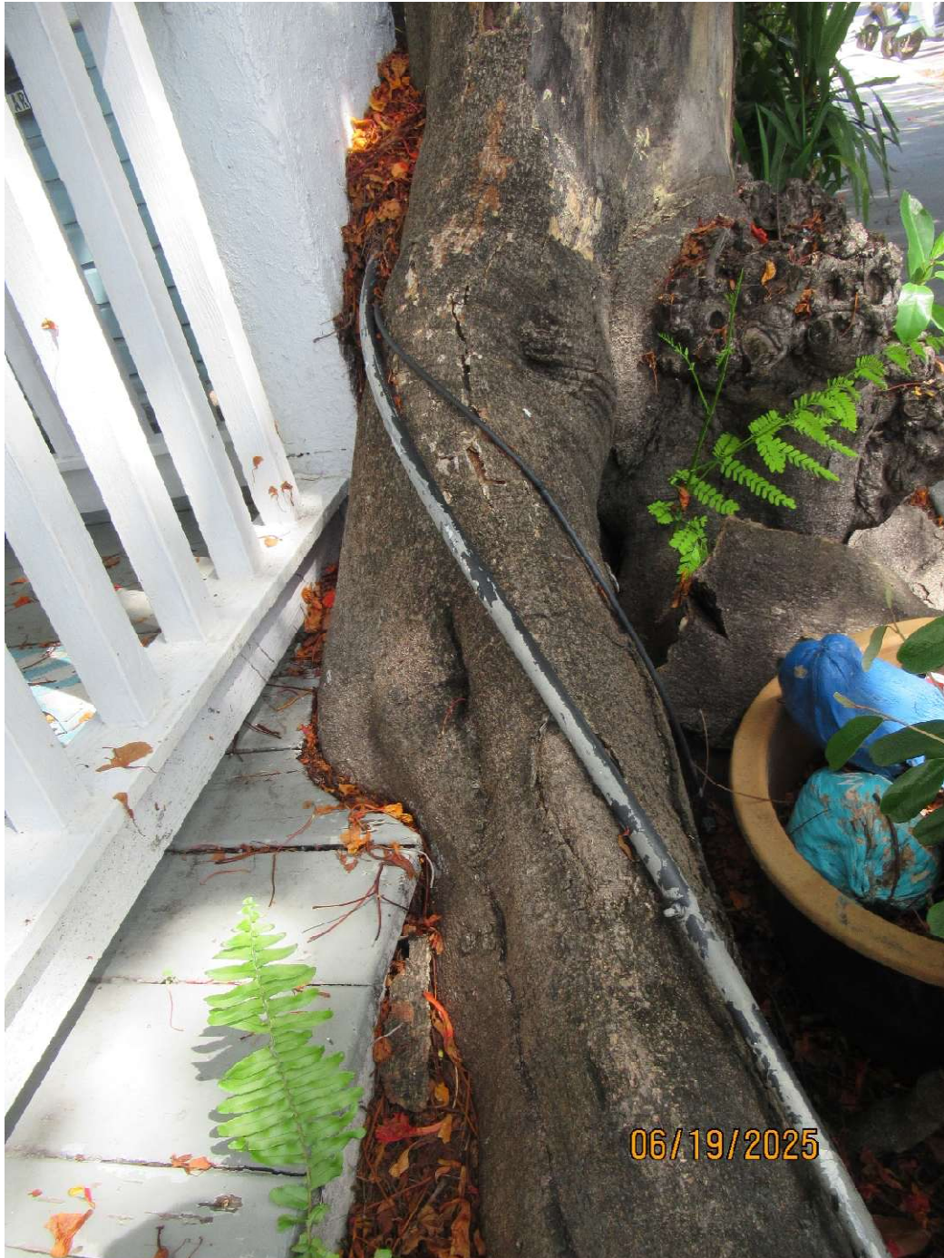
Photo shows porch accommodating the trunk.