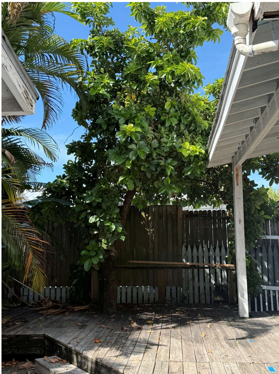
The canopy is in fair shape.