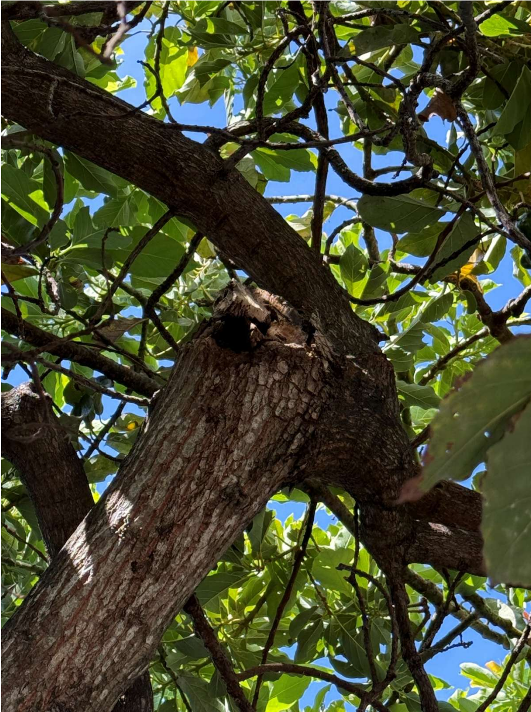
A junction where the tree has been hollowed out possibly by termites.