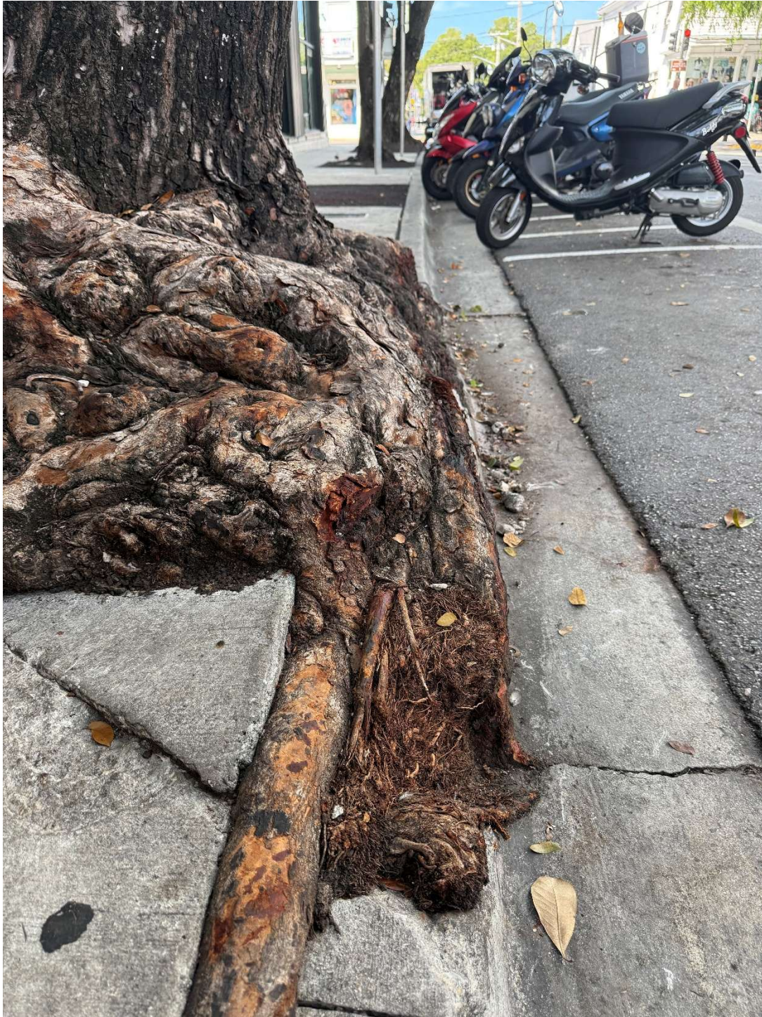
The tree's roots have become so massive that concrete is simply pushed out of the way.