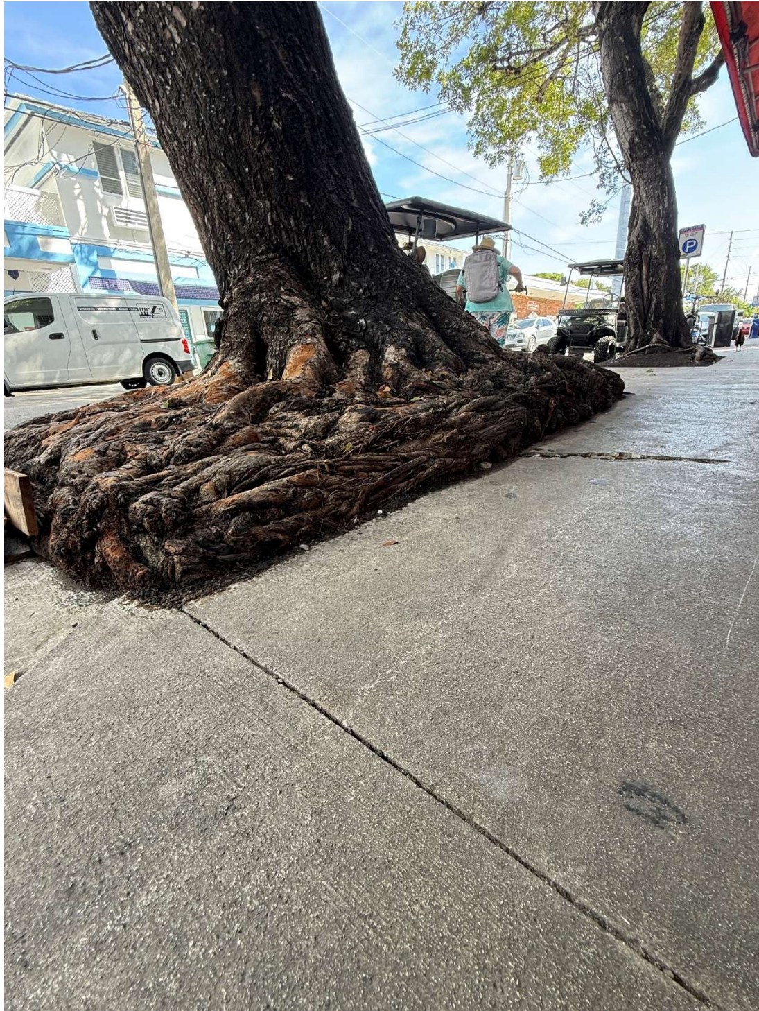
The roots are truly amazing and likely over 100 years old.