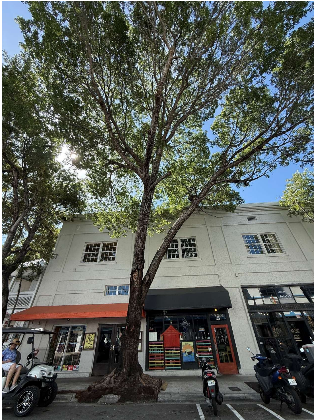
The tree is slowly suffocating in its compacted space.