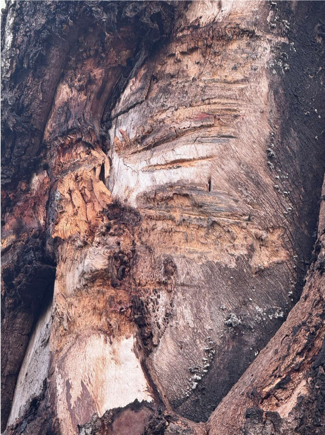
The trunk has a large wound from being struck by delivery trucks over the years.