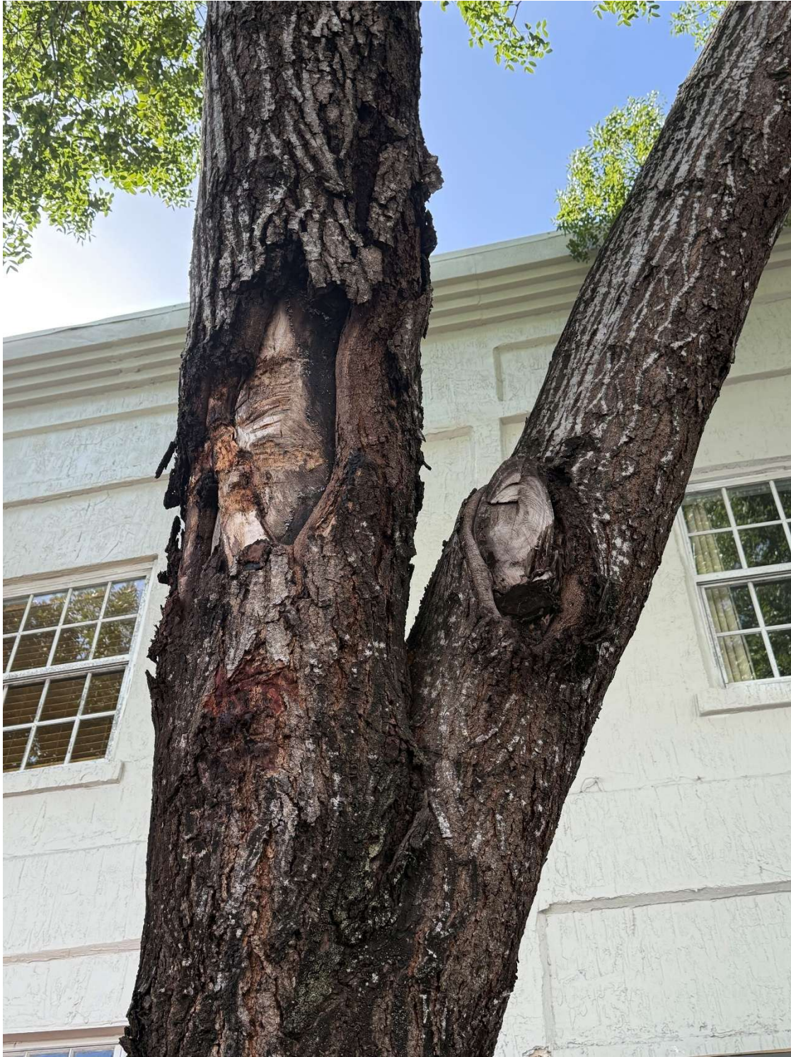
The wound has a crack that run vertically up the main leader.