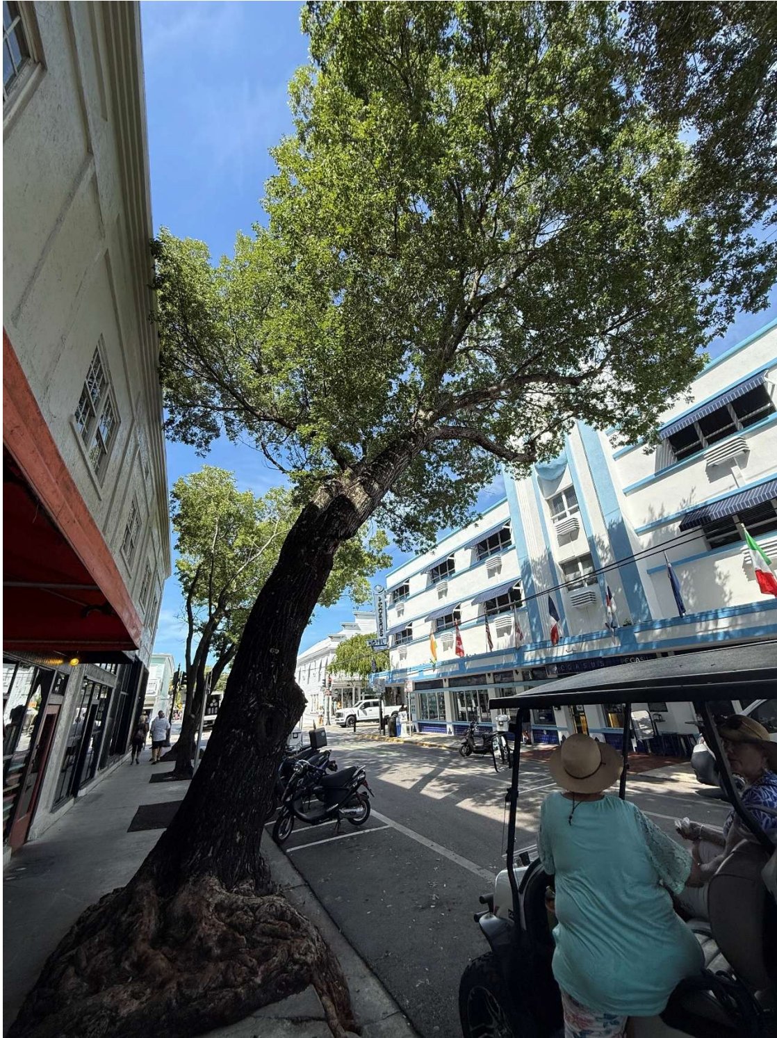
The tree's lean is amazing and defies gravity.