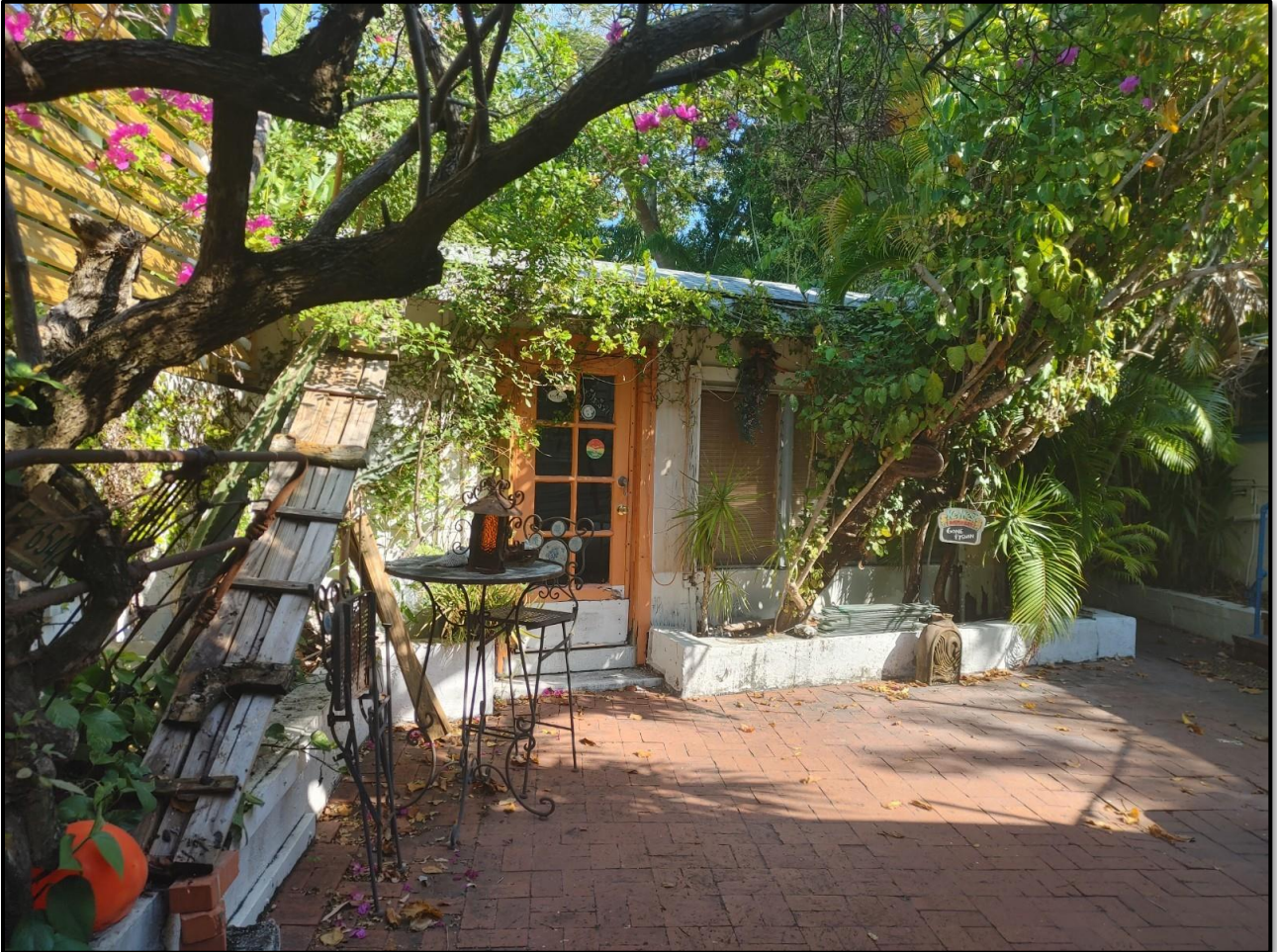
701 Windsor Lane – Existing front entrance

The subject properties of 701 Windsor Lane and 627 Elizabeth Street are under the same ownership and received a unity of title to combine the two parcels on April 6 th , 2021. The subject of this variance request is the one-story residence located at 701 Windsor Lane. Access to the home is currently only through an access easement off Windsor Lane. The unity of title and the proposed addition of a sliding glass door with steps to access 627 Elizabeth’s rear yard will provide another ingress and egress to the residence. The property owner’s intention is to have their mother reside at 701 Windsor Lane. The residential structures at 701 Windsor Lane and 627 Elizabeth have historically been there since 1948 and are contributing to the historic district. The lot size with both parcels now united is a total of 4,030 square feet conforming with the minimum lot size in the HHDR zoning district. The proposed site plan indicates the portions of the structure would be demolished, renovated, and elevated to FEMA compliance.