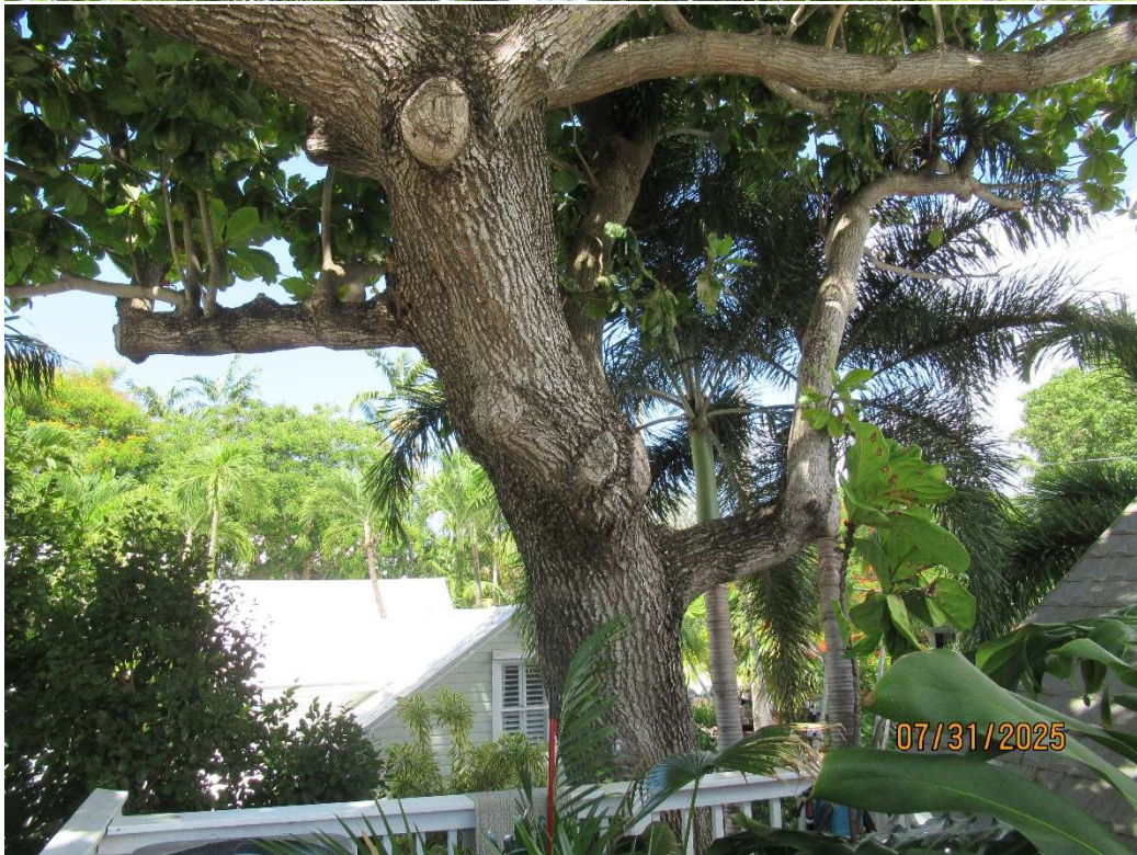
Both photos taken from second story balcony.