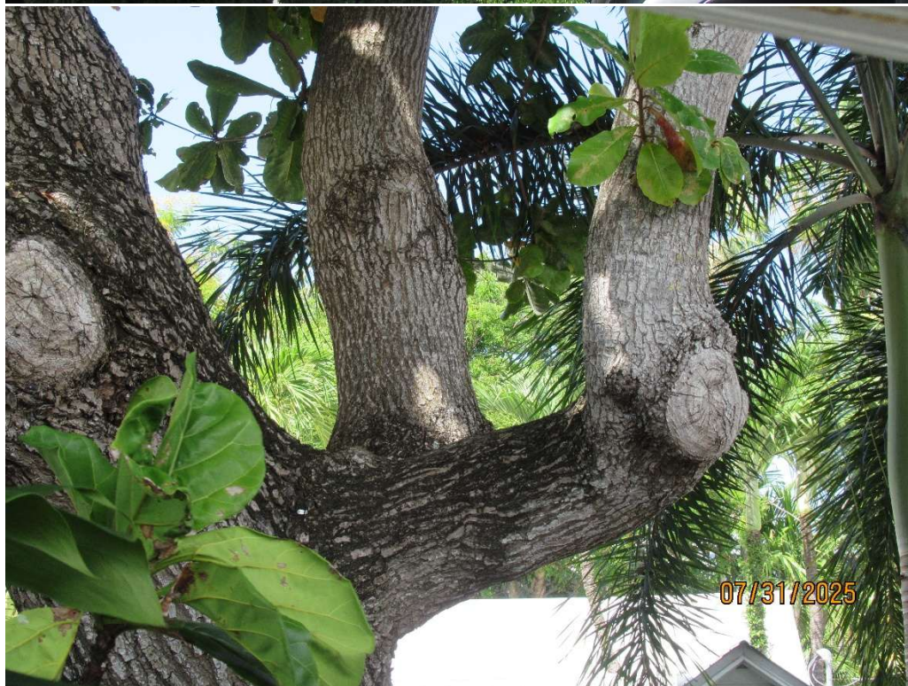
Top Photo taken looking West. Bottom taken from second story balcony.