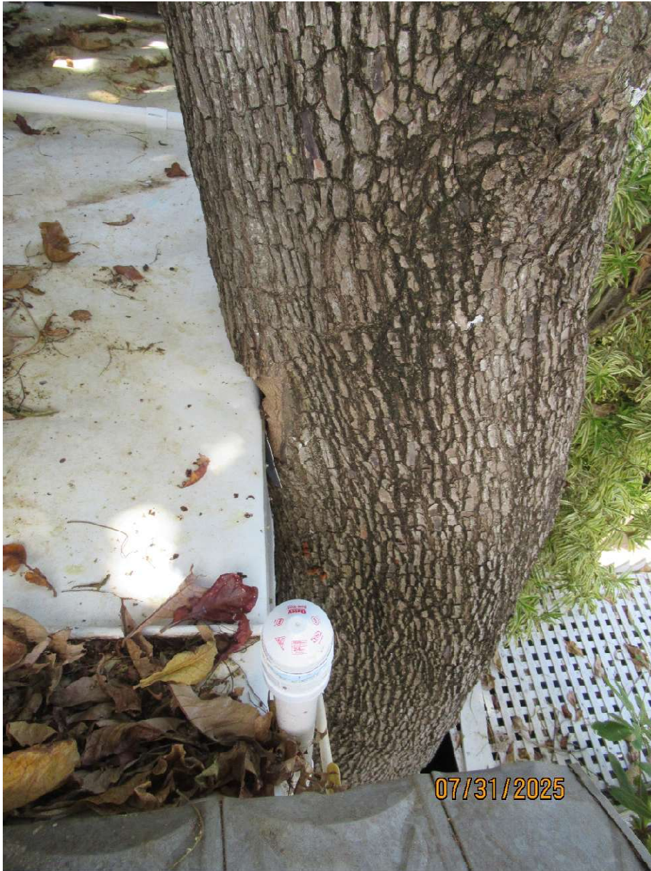
The tree is basically touching the edge of this roof.