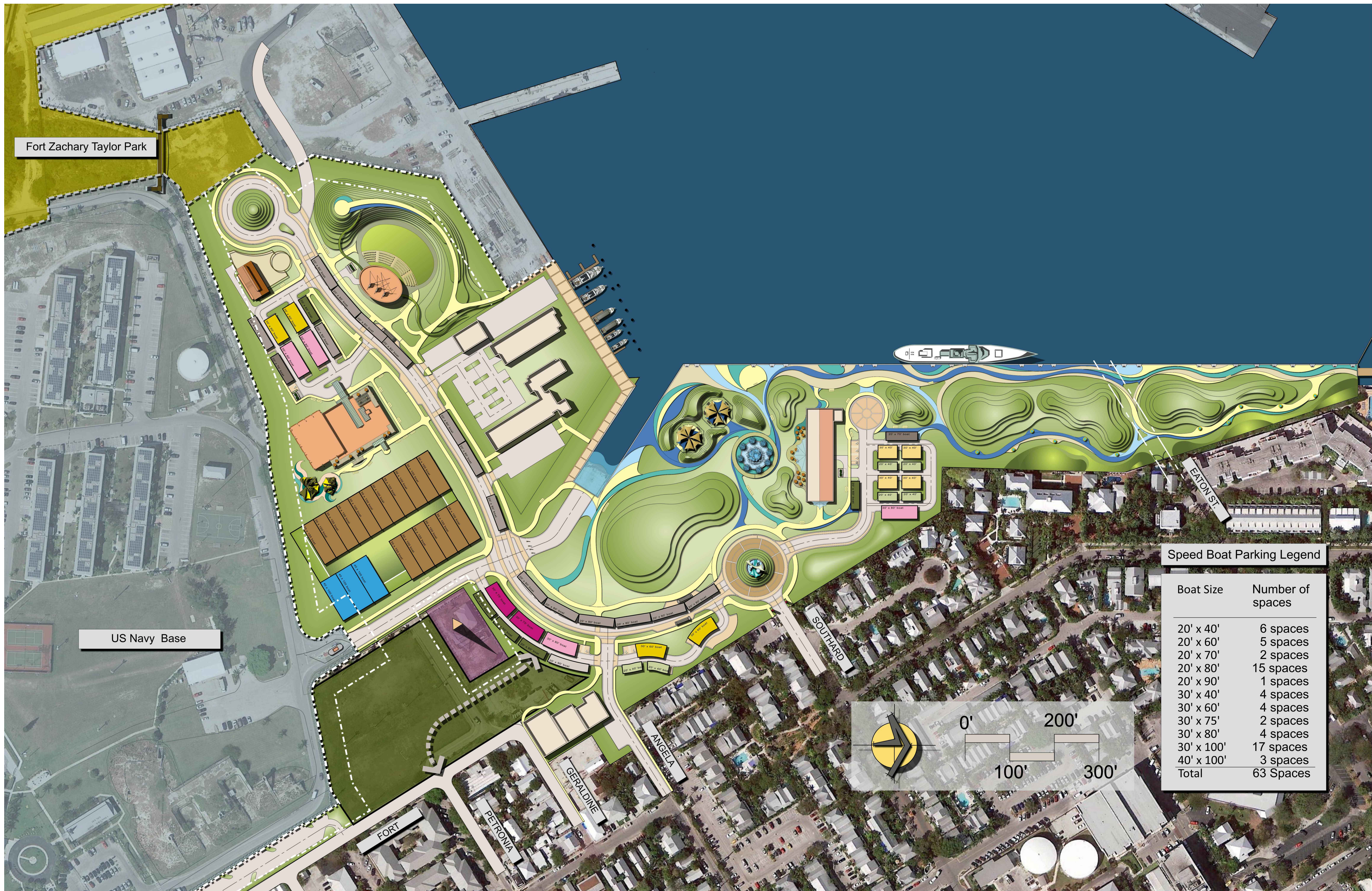
Speed Boat Parking Legend