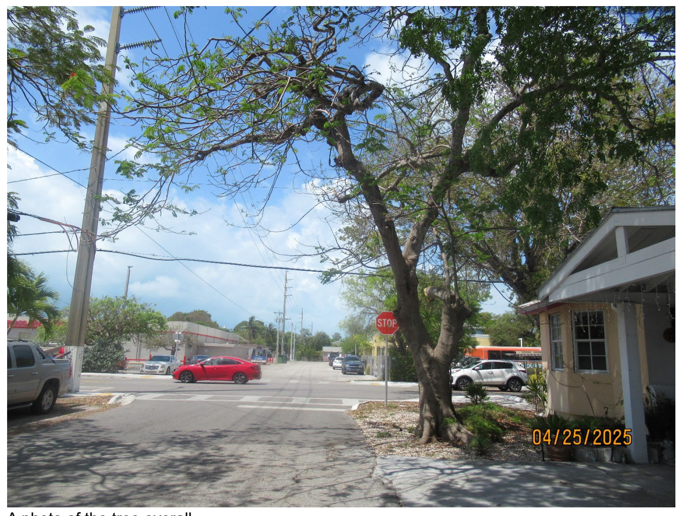
A photo of the tree overall