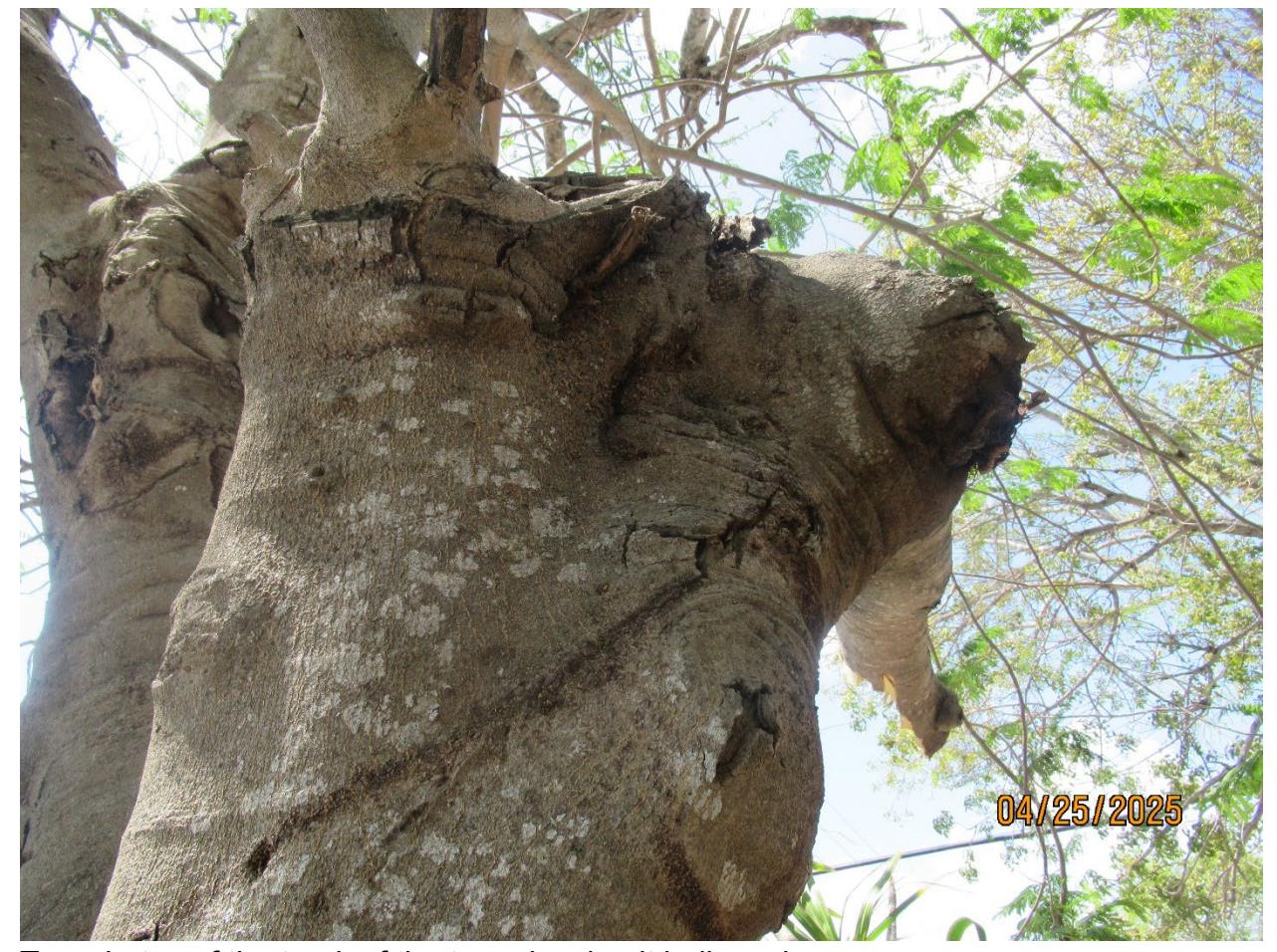
Two photos of the trunk of the tree showing it hollowed