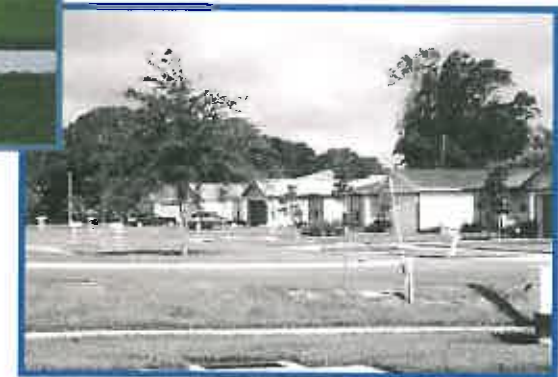
Swinton Community Land Trust: Single-Family Development

Delray Beach serves as a South Florida Best Practice case study for its creation and support of the Delray Beach Community Land Trust