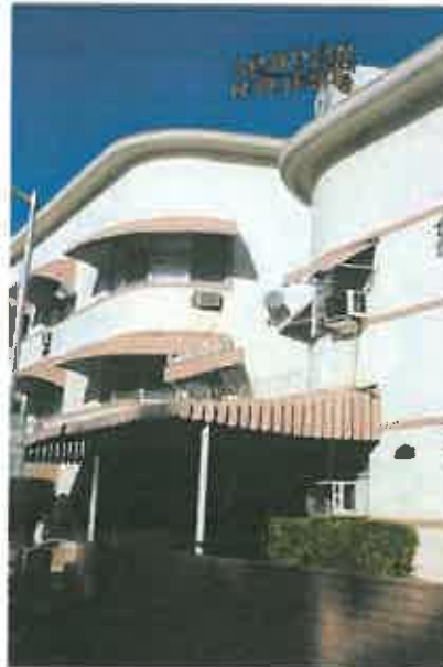
London House in Miami Beach

The projects will provide affordable housing opportunities for low- to moderate-income renters in Miami Beach (including workforce housing and housing for artists and cultural workers)