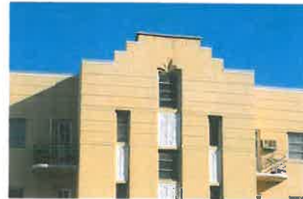
Allen Apartment Hotel in Miami Beach