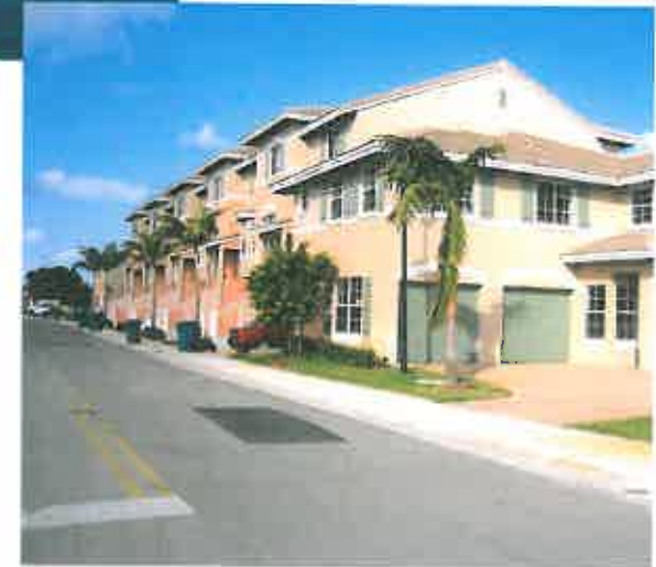
Urban Infill: The Preserve

The Boynton Beach CRA has been active in other workforce housing infill projects including providing a $3 million land write-down for Ocean Breeze, a mixed-income development consisting of 84 rental units for low and moderate income household and 56 town home units