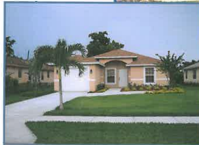
Community Land Trust Purchase/ Rehabilitation

Delray Beach serves as a South Florida Best Practice case study for its creation and support of the Delray Beach Community Land Trust