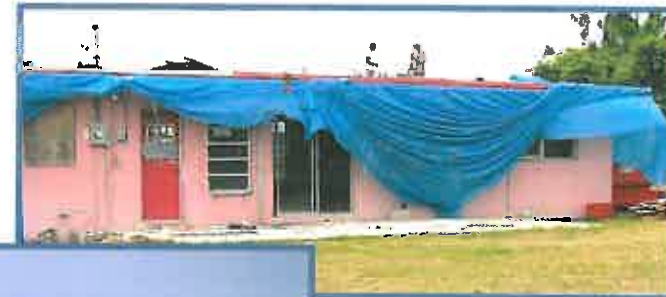
Community Land Trust Purchase/ Rehabilitation