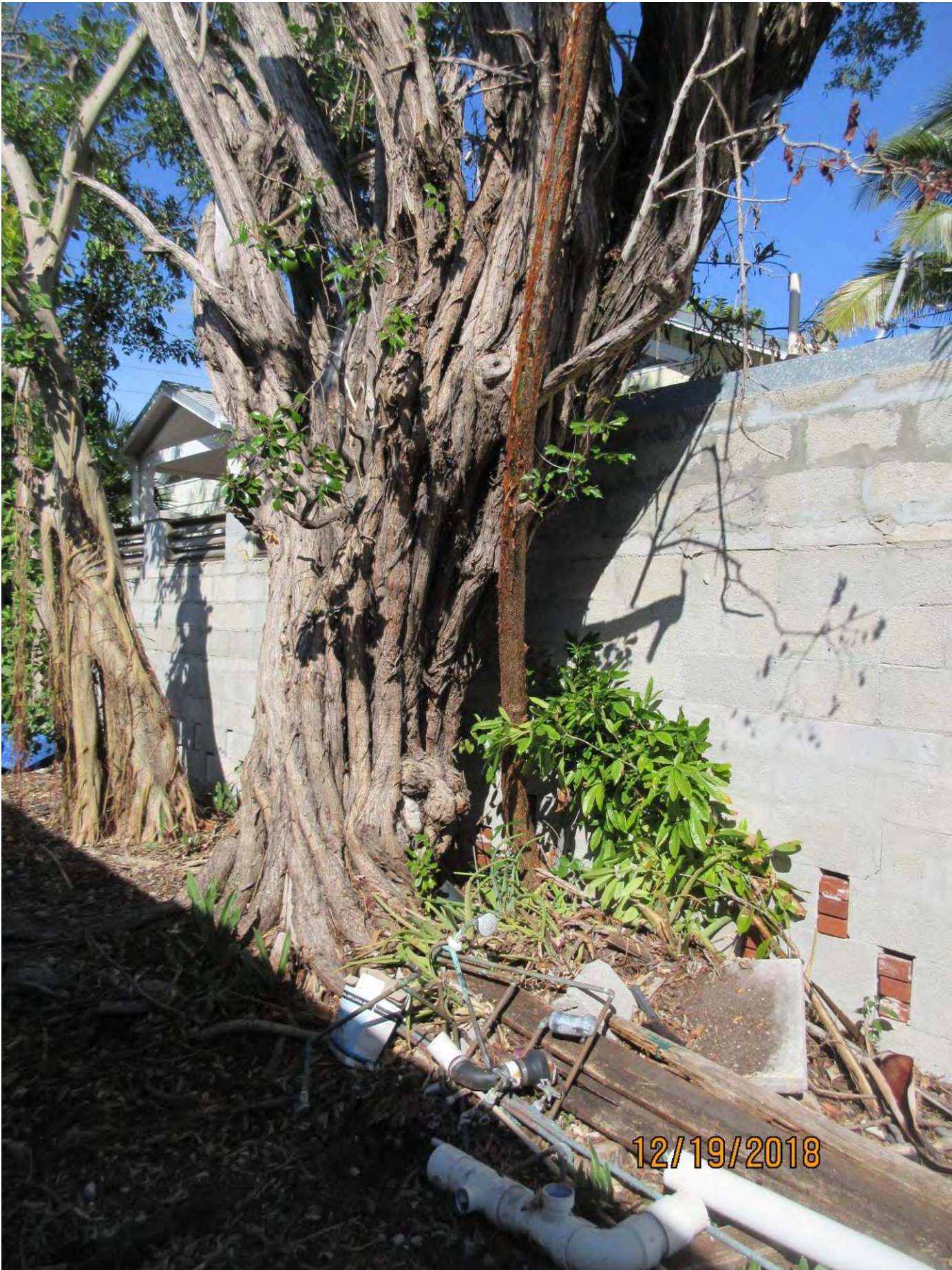
Gumbo Limbo #2