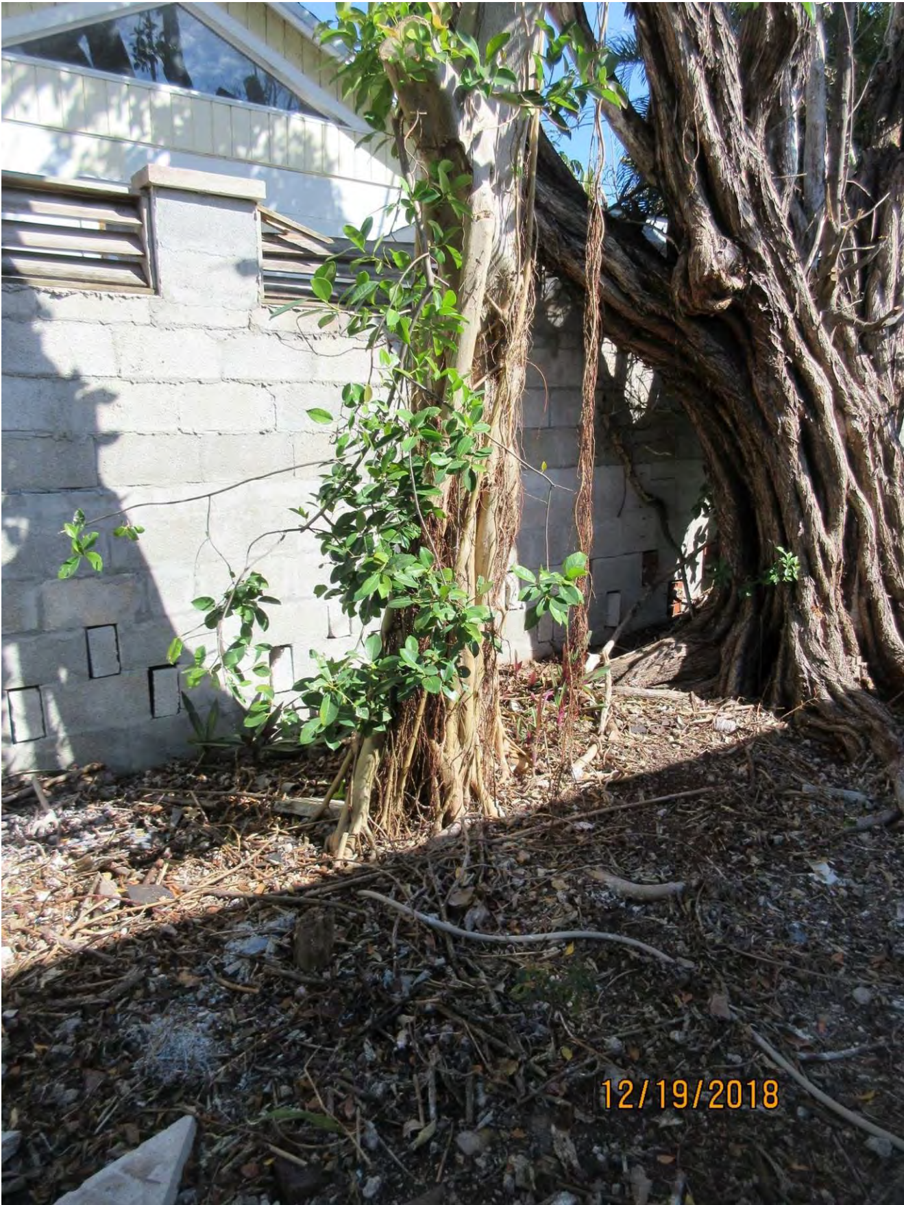
Tree Species: Strangler Fig ( Ficus aurea )