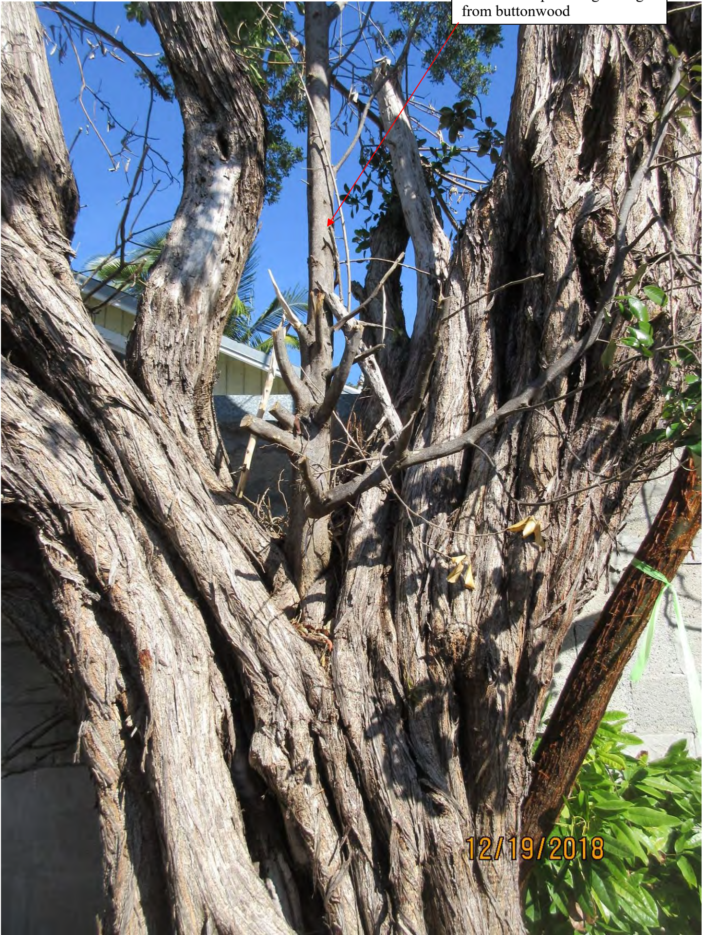
Jamaican Caper tree growing from buttonwood