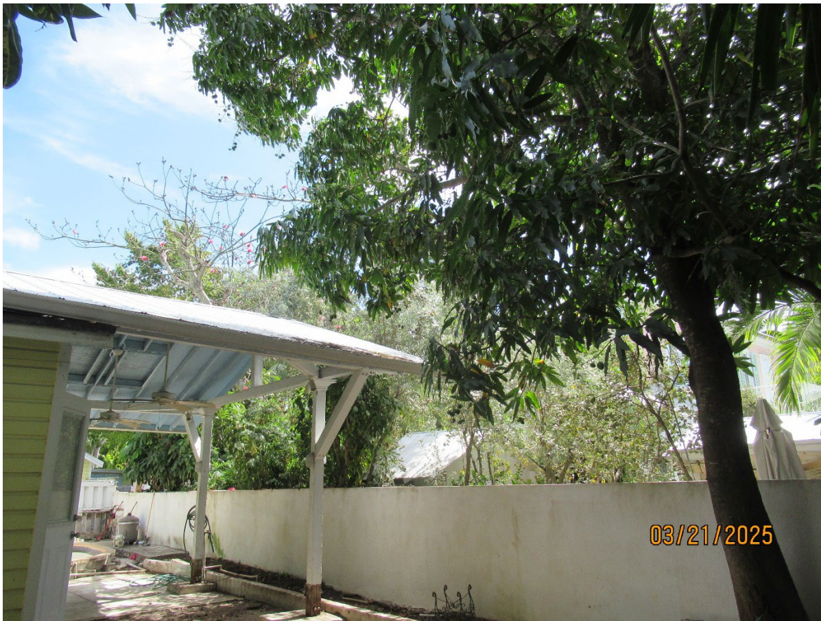
A photo of the canopy and tree's proximity to the house and a photo of the tree fruiting