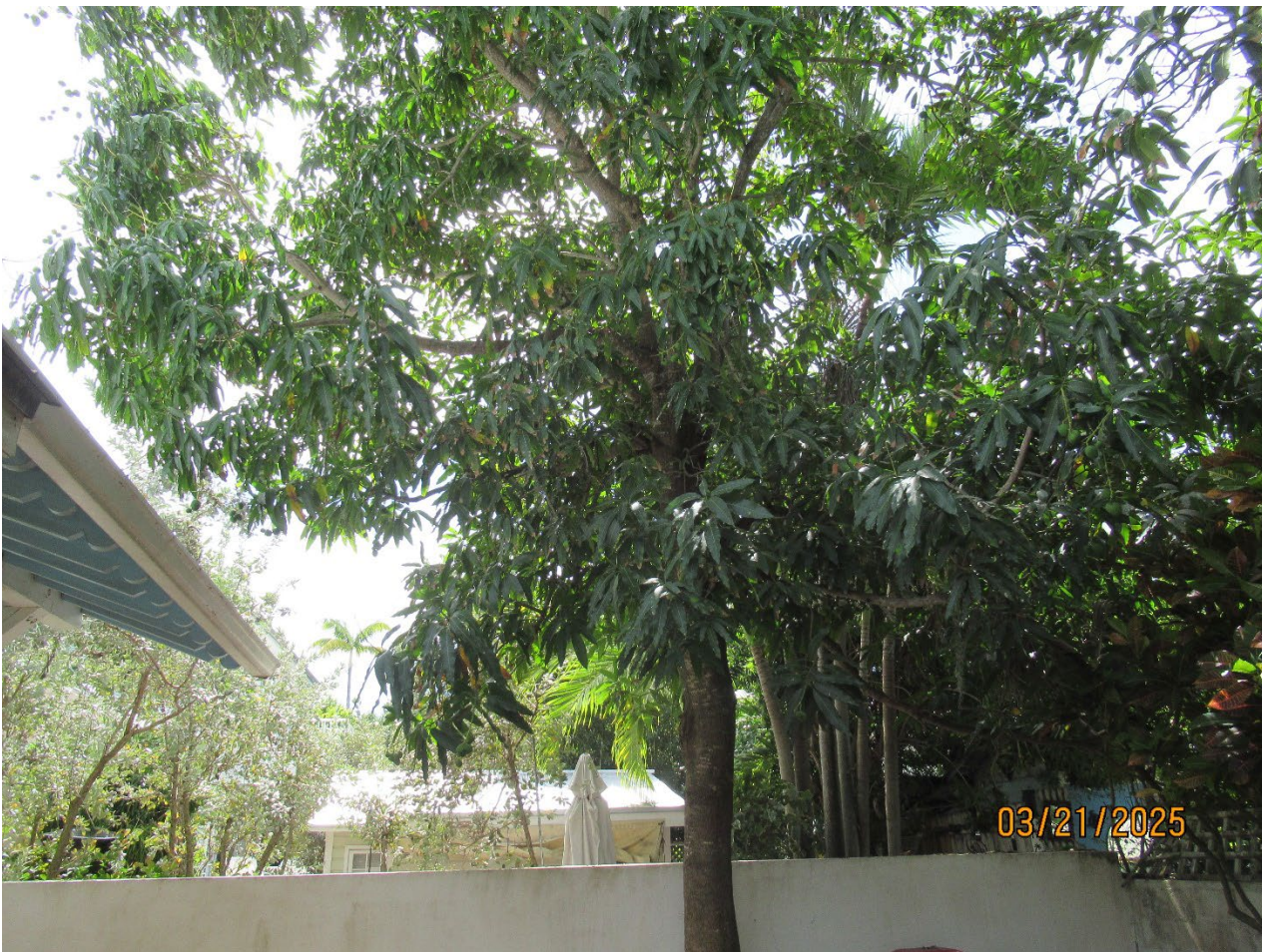
A photo of the tree overall