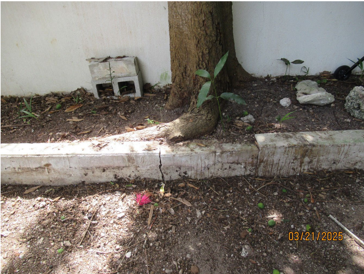
2 photos of the concrete cracking on the raised bed