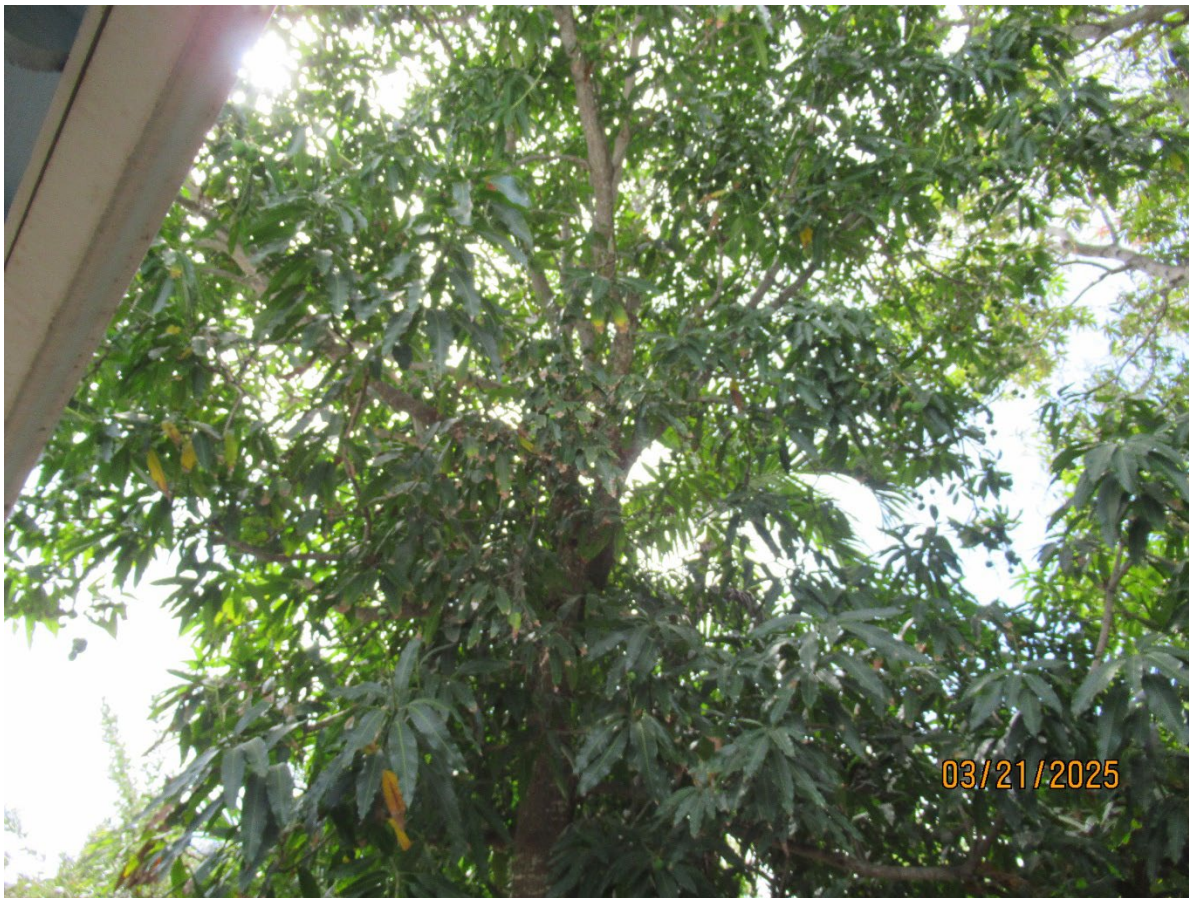
A photo of the canopy and a photo of the base of the tree