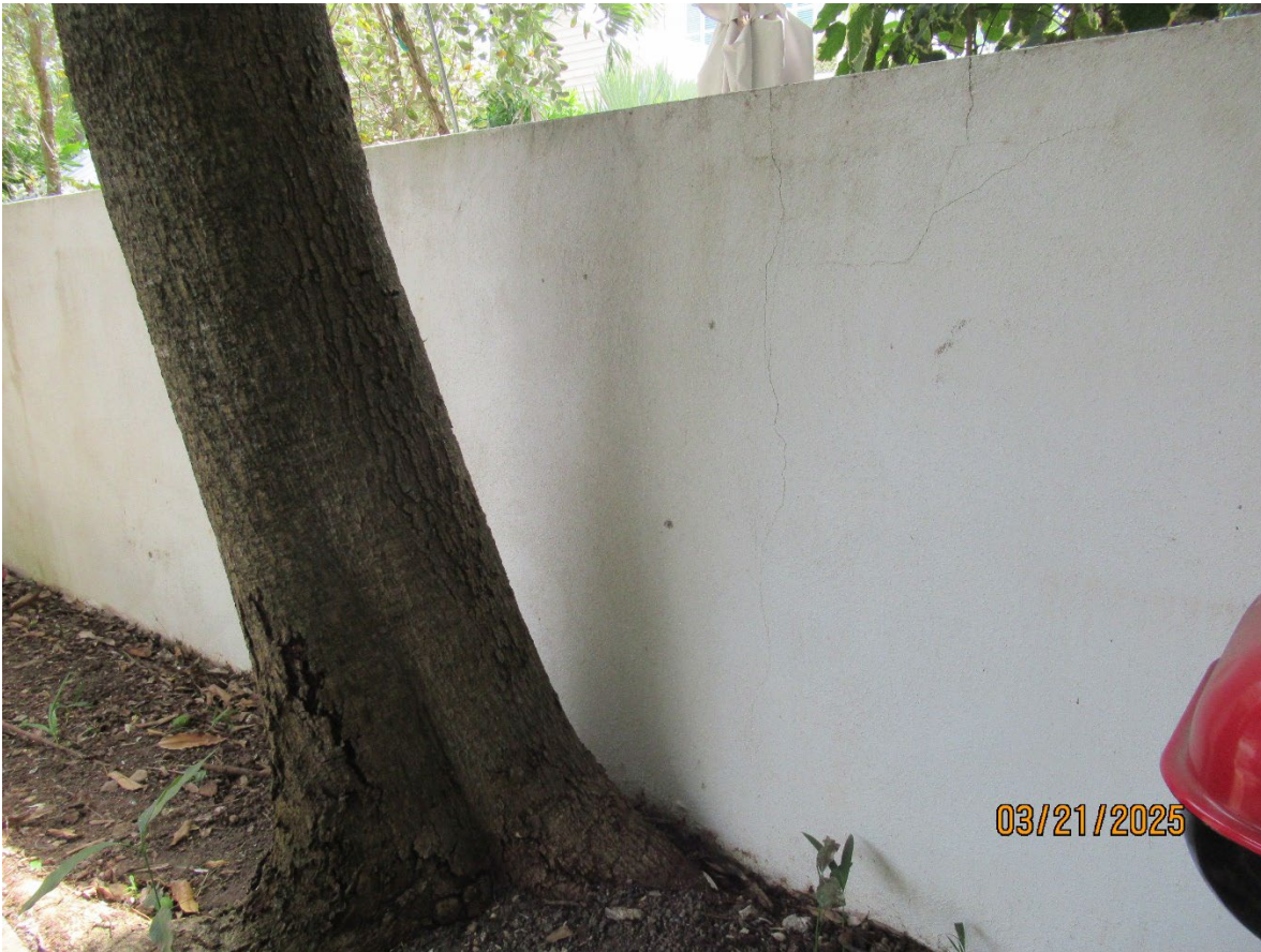
2 photos of the base of the tree and the location in the flowerbed