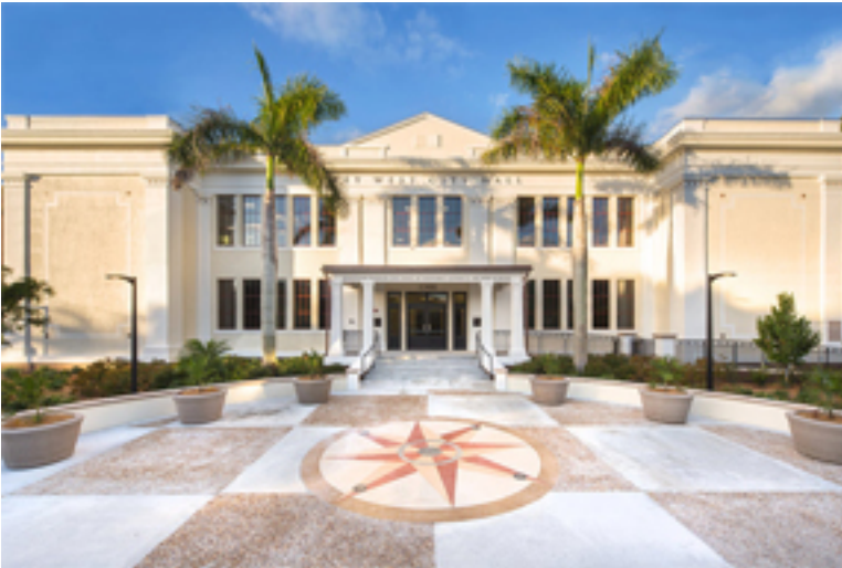
Figure 1# 1. Front Entrance - retaining wall