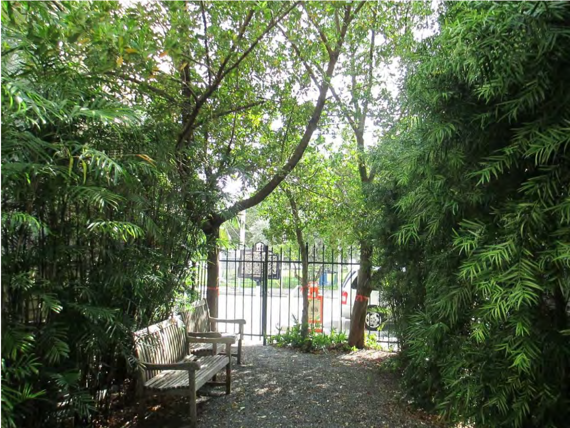
Photo taken from inside the armory garden.

Tree Species: Green Buttowood ( Conocarpus erectus )