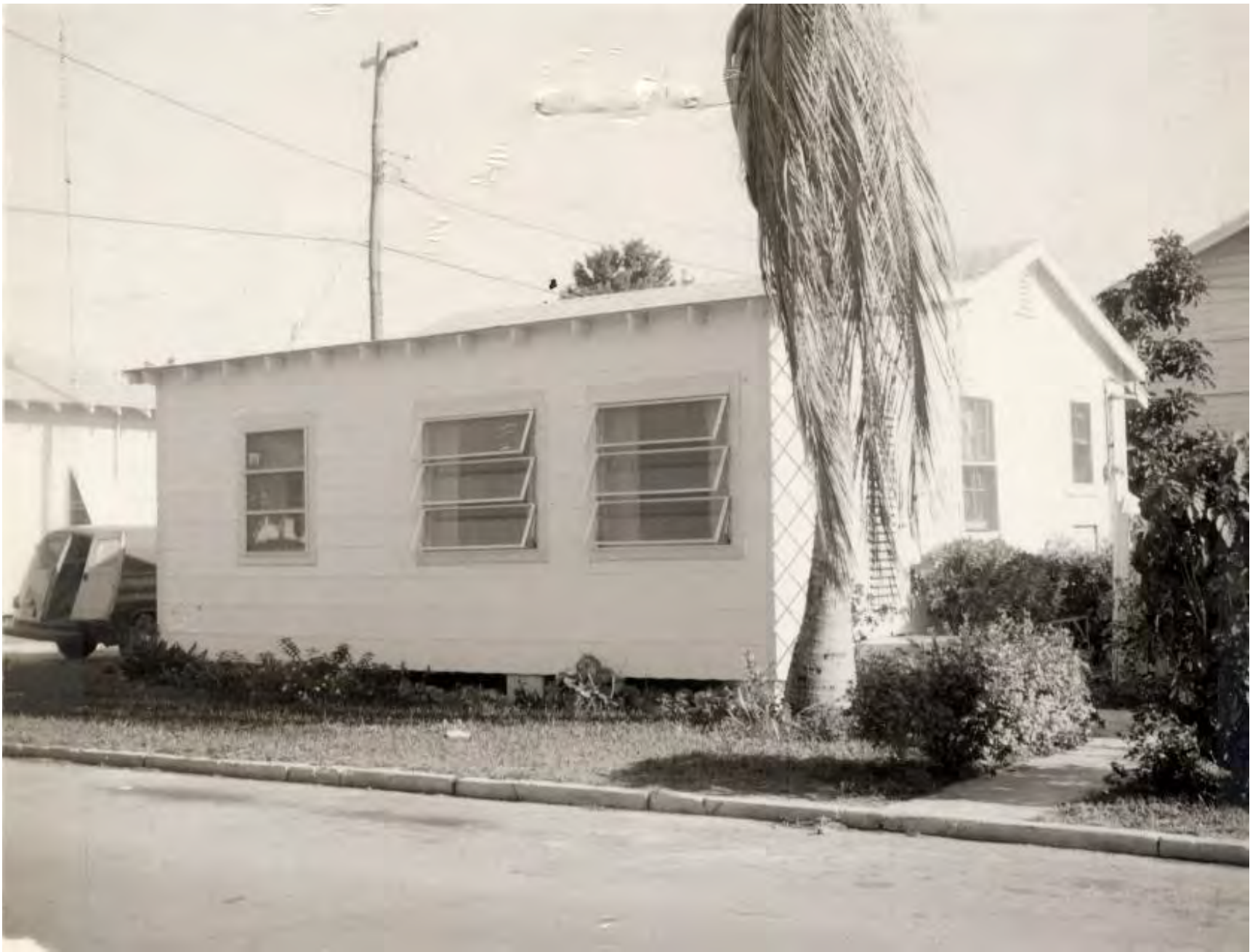
1965 Property Appraiser's Photograph