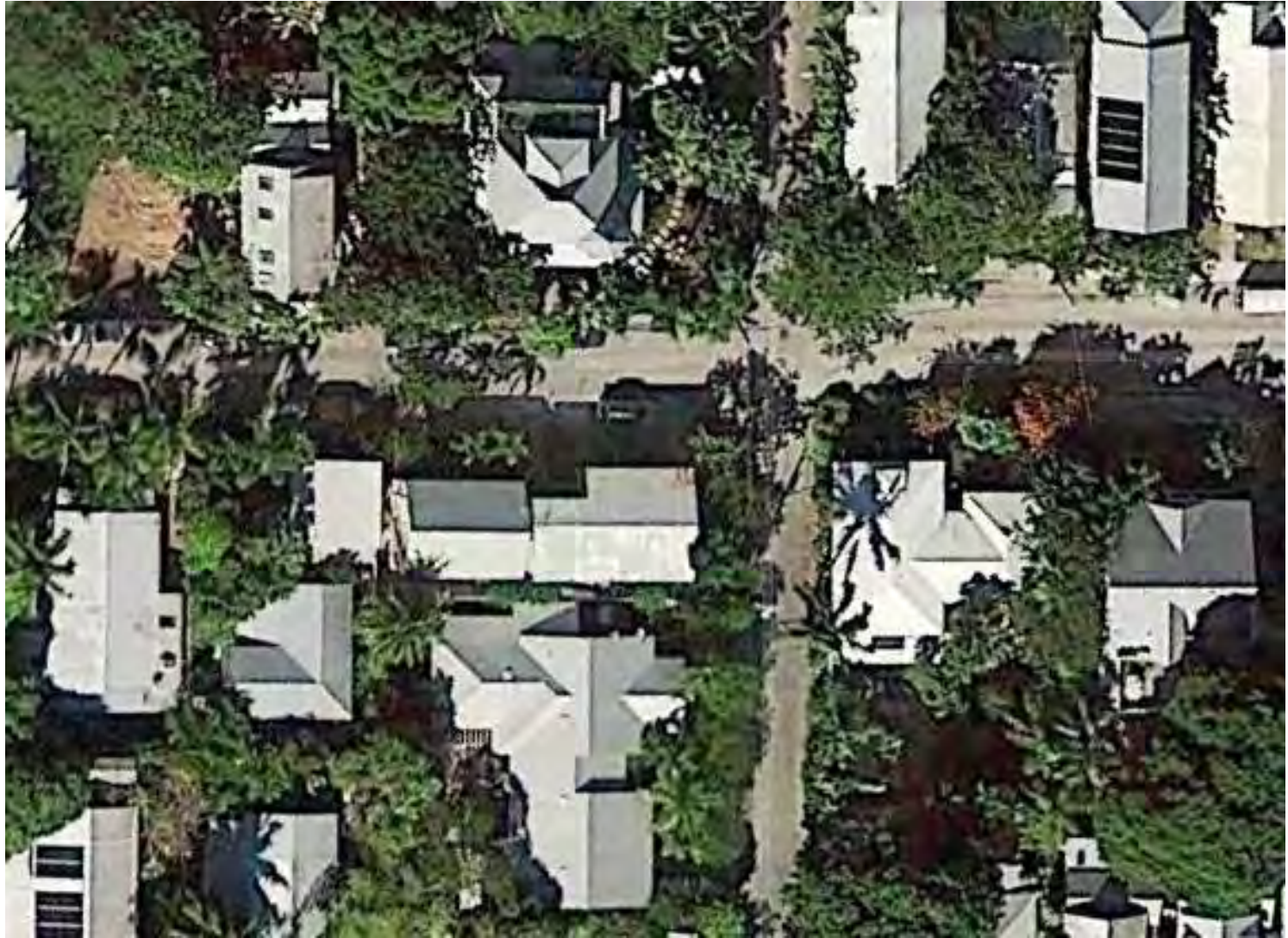
2011 Google Earth Image