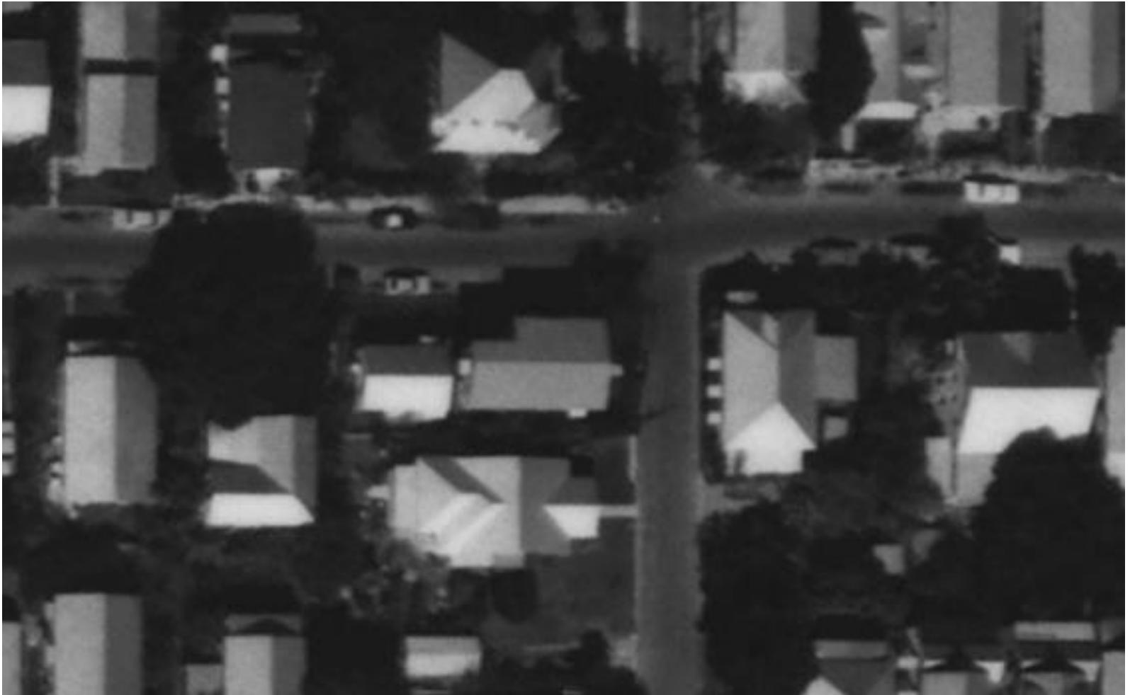
1968 Aerial Photograph