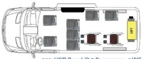
350: LWB Rear Lift 7 Passenger + 2 WC