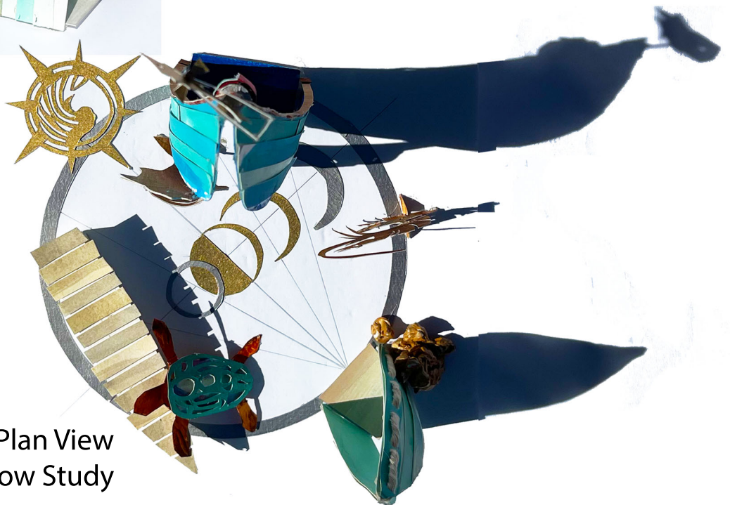
Overhead Plan View Shadow Study