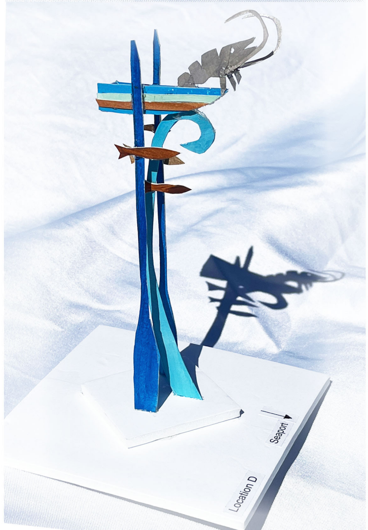
Concepts for Locations B, C, D