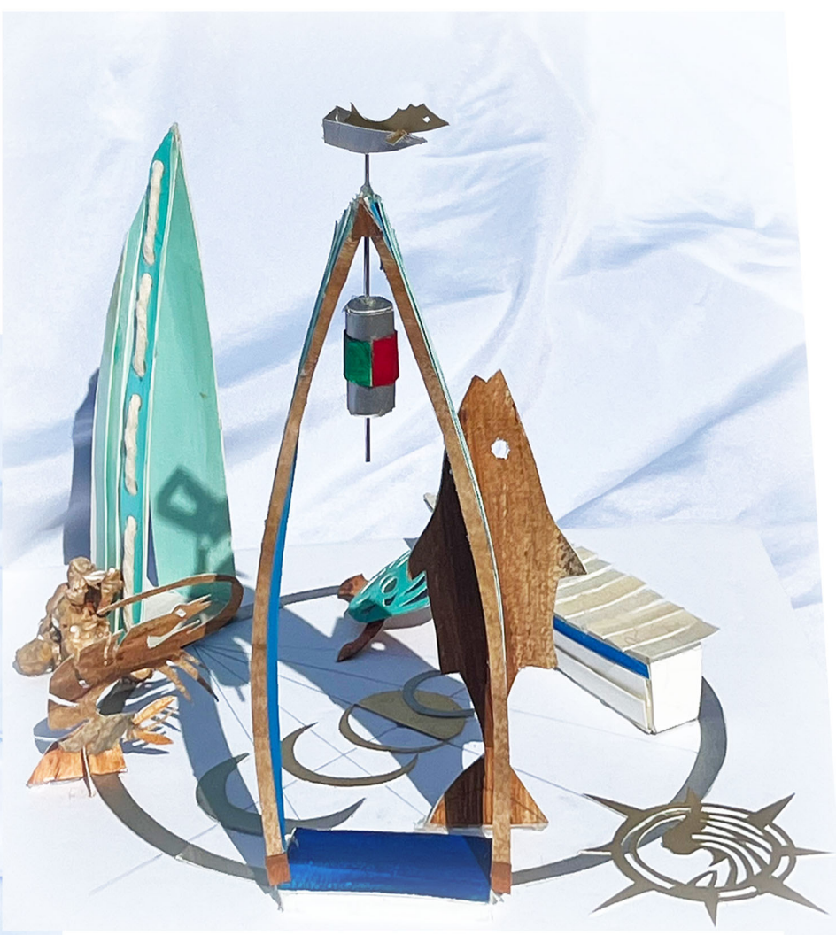
Views of Entry