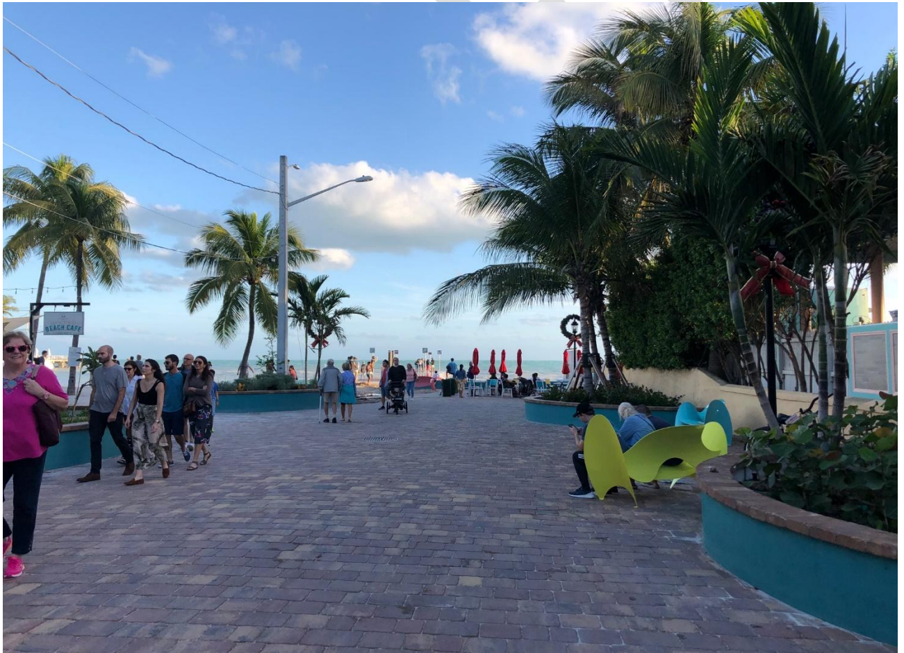
Ramos Lopez Pedestrian Park & Sculpture Garden

The Ramos family, originally from Spain, was one of Florida’s oldest merchant families because of their ties to the Spanish Royal family. They hosted King Juan Carlos of Spain on several occasions. In fact, the landing pad was added to the oceanfront deck to accommodate his private helicopter. The family also hosted five United States Presidents: Harry S. Truman, Dwight D. Eisenhower, John F. Kennedy, Richard M. Nixon and James E. Carter, Jr. The house served as the Ramos-Lopez family residence until 1996 when the mansion was completely renovated to the luxury guest house you see today.