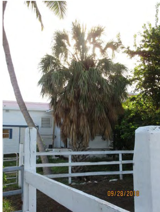
Tree #13 (old #H)