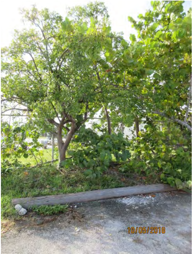
Tree #68 & #69 (Old #NN1 & # NN2)