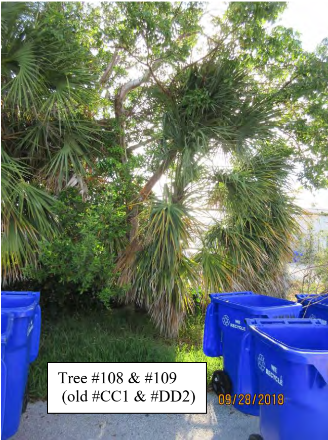
Tree #108 & #109 (old #CC1 & #DD2)