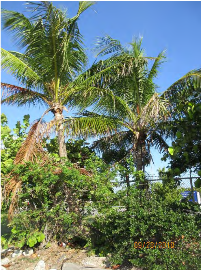
Tree #86 and #87