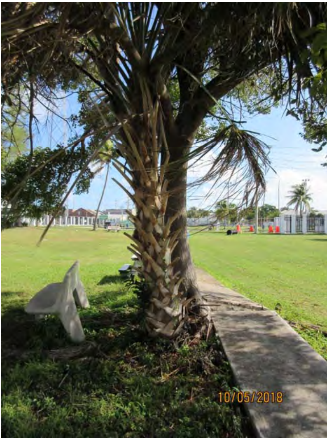
Tree #18 (old #C)