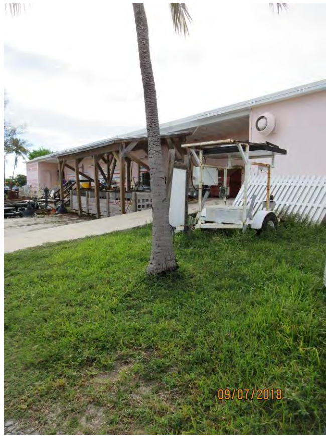
Tree #90 (old #13)