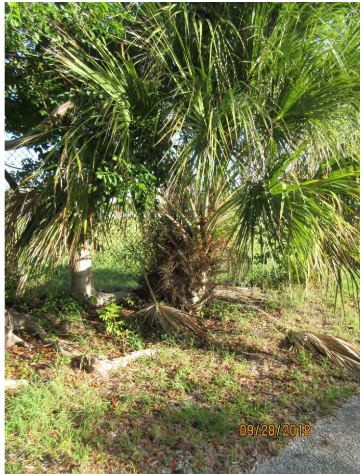
Tree #95 (old #Y)