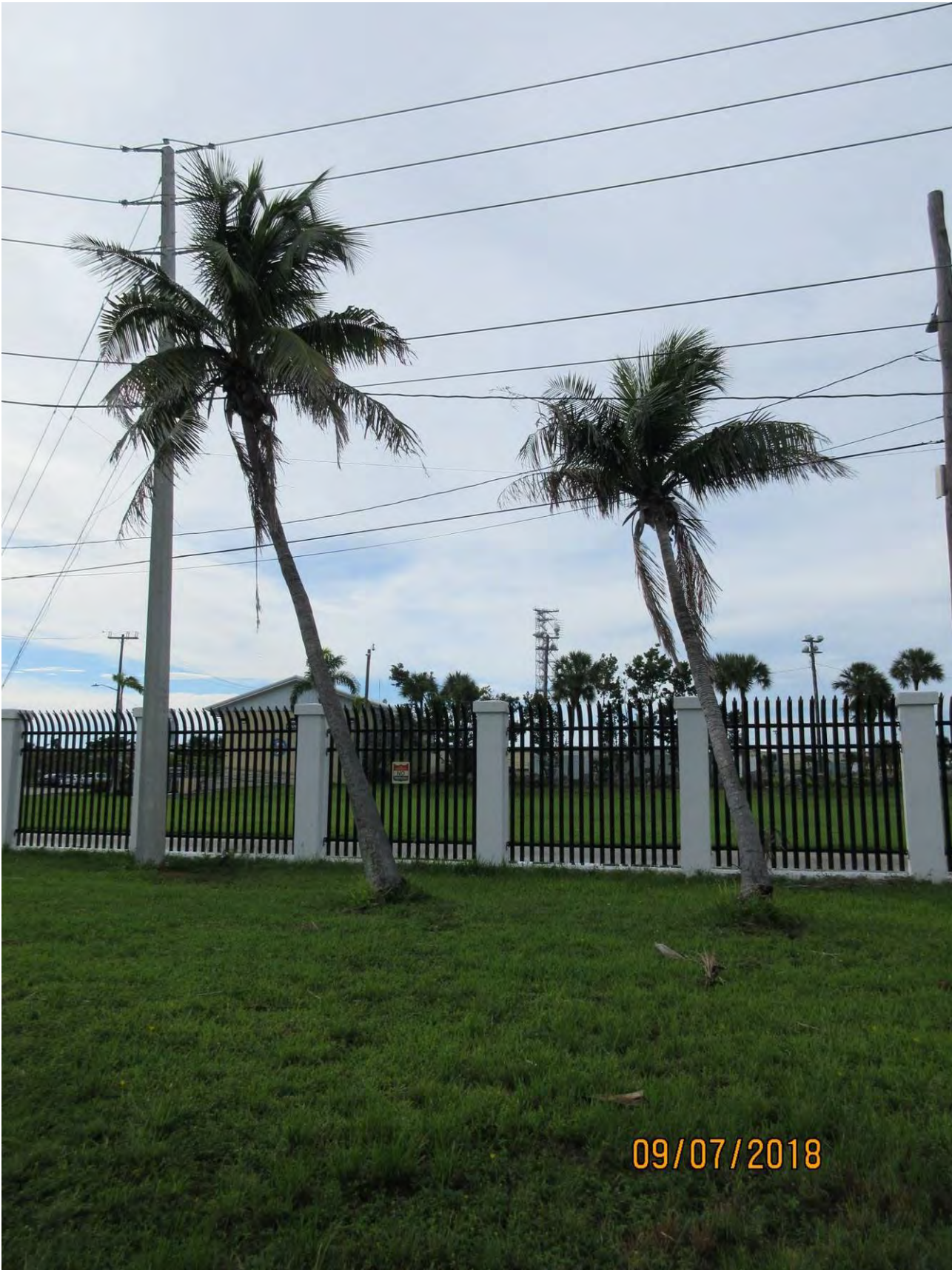
#59 (old #27 ) and #58 (old #26)