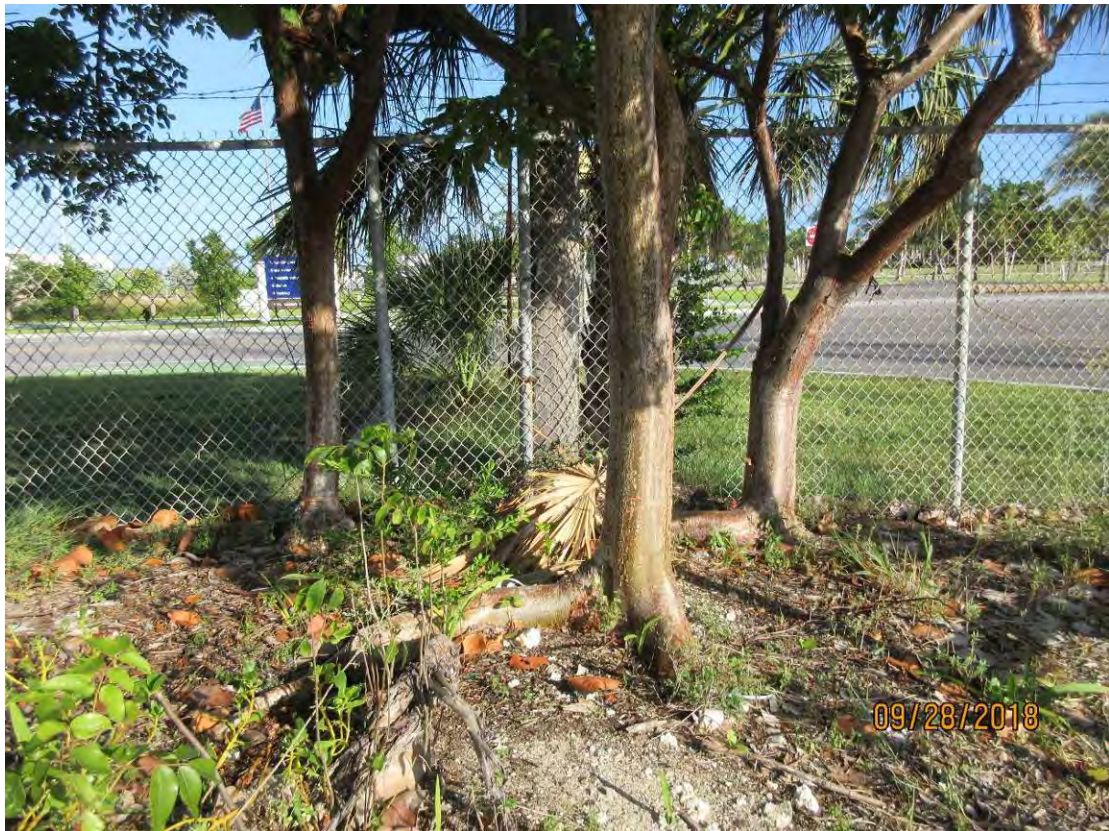
Tree # 83 (old #P), #81 (old #U), and #79 (old #V)