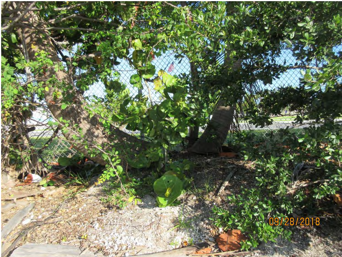
Tree #86 and #87 (old #17A and #17B)