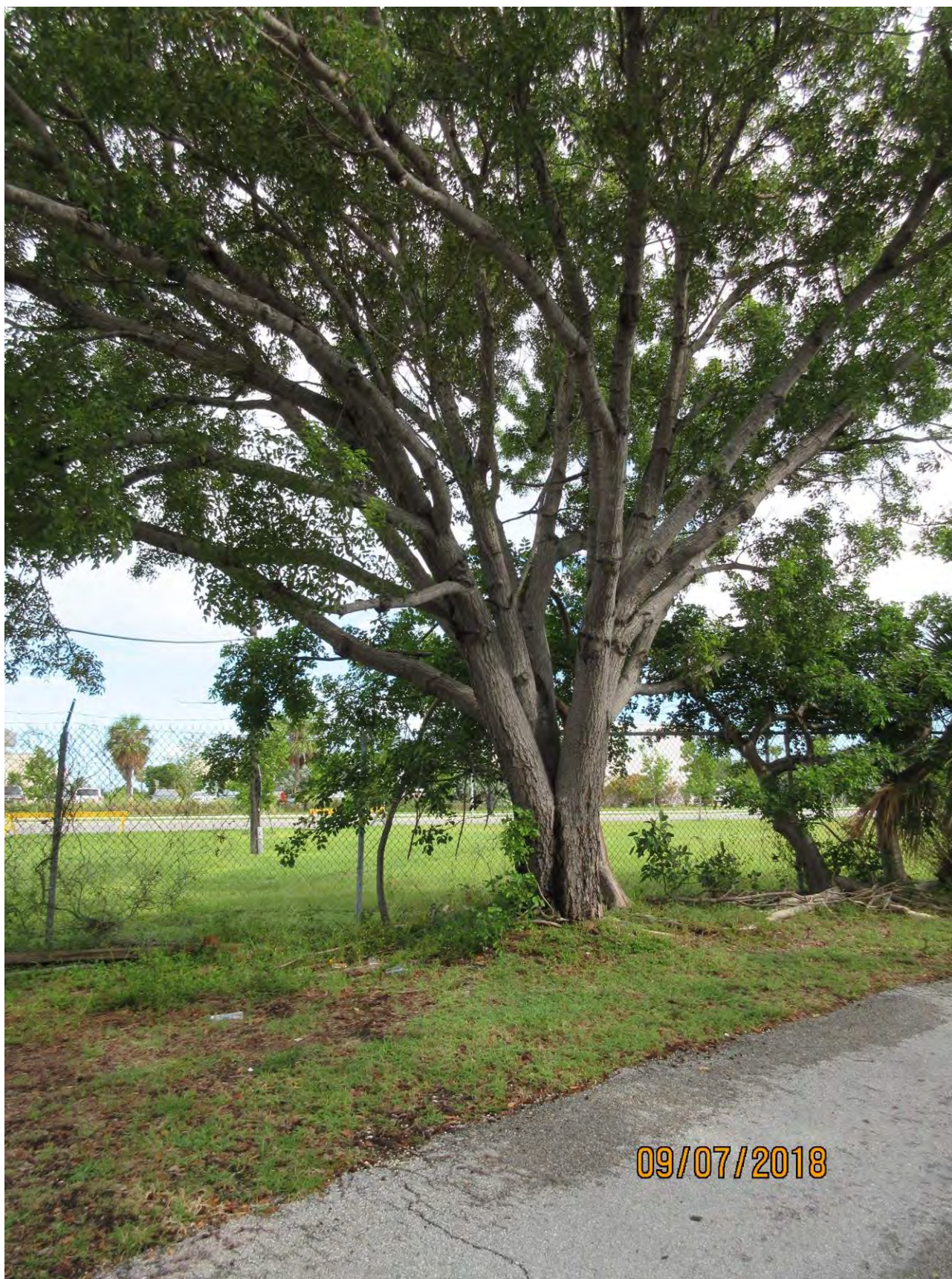
Tree #100 (old #10): Mahogany (Swietenia mahagoni)