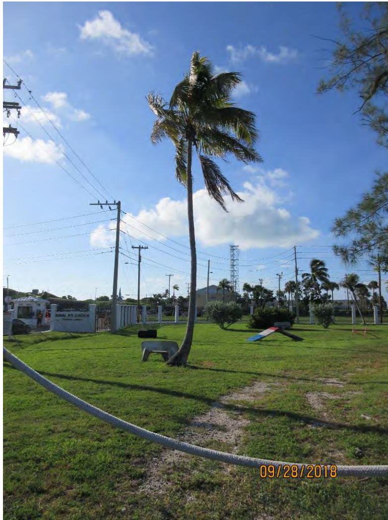
Tree #57 (old #30)