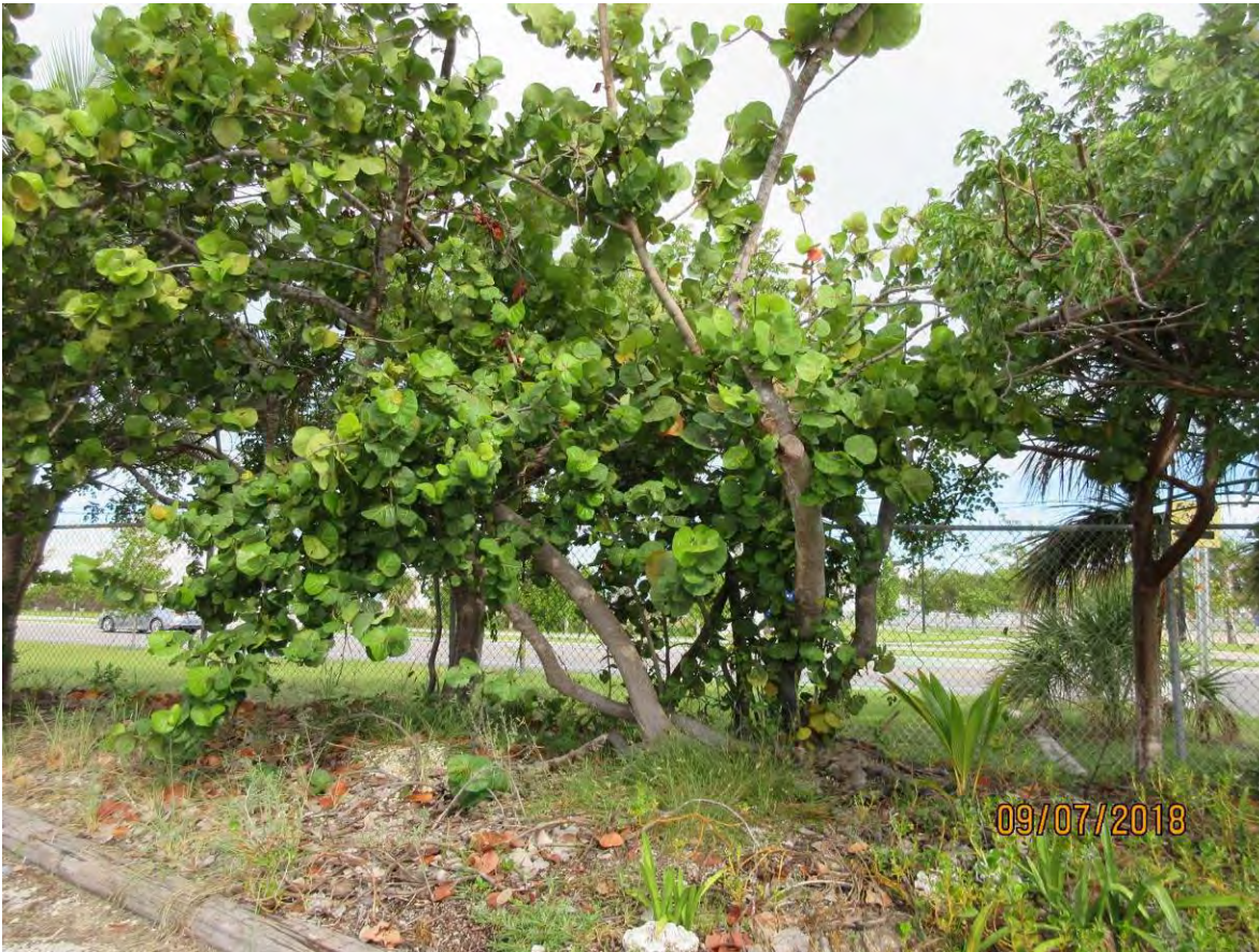
Tree #82 (old #89) Sea Grape