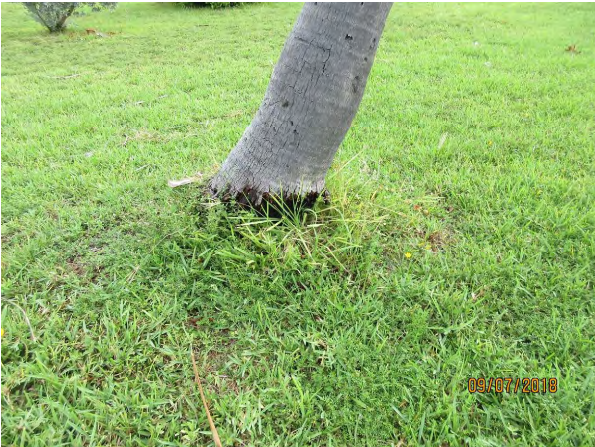
Tree #59 (old #27 ) and #58 (old #26)