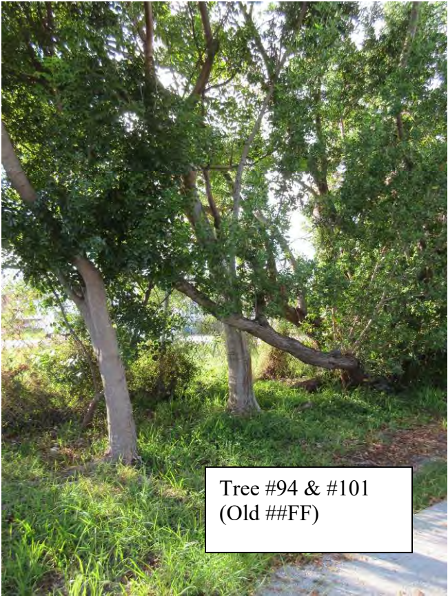
Tree #94 & #101 (Old ##FF)