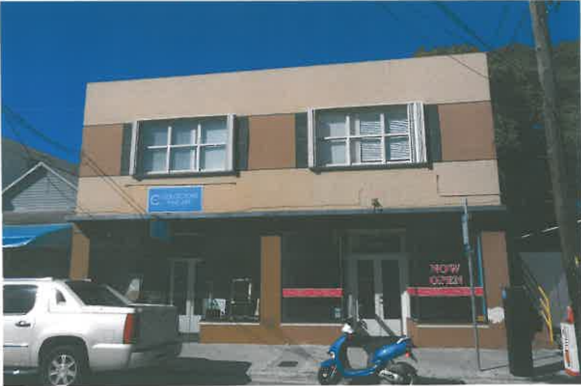
824-826 Duval ✱