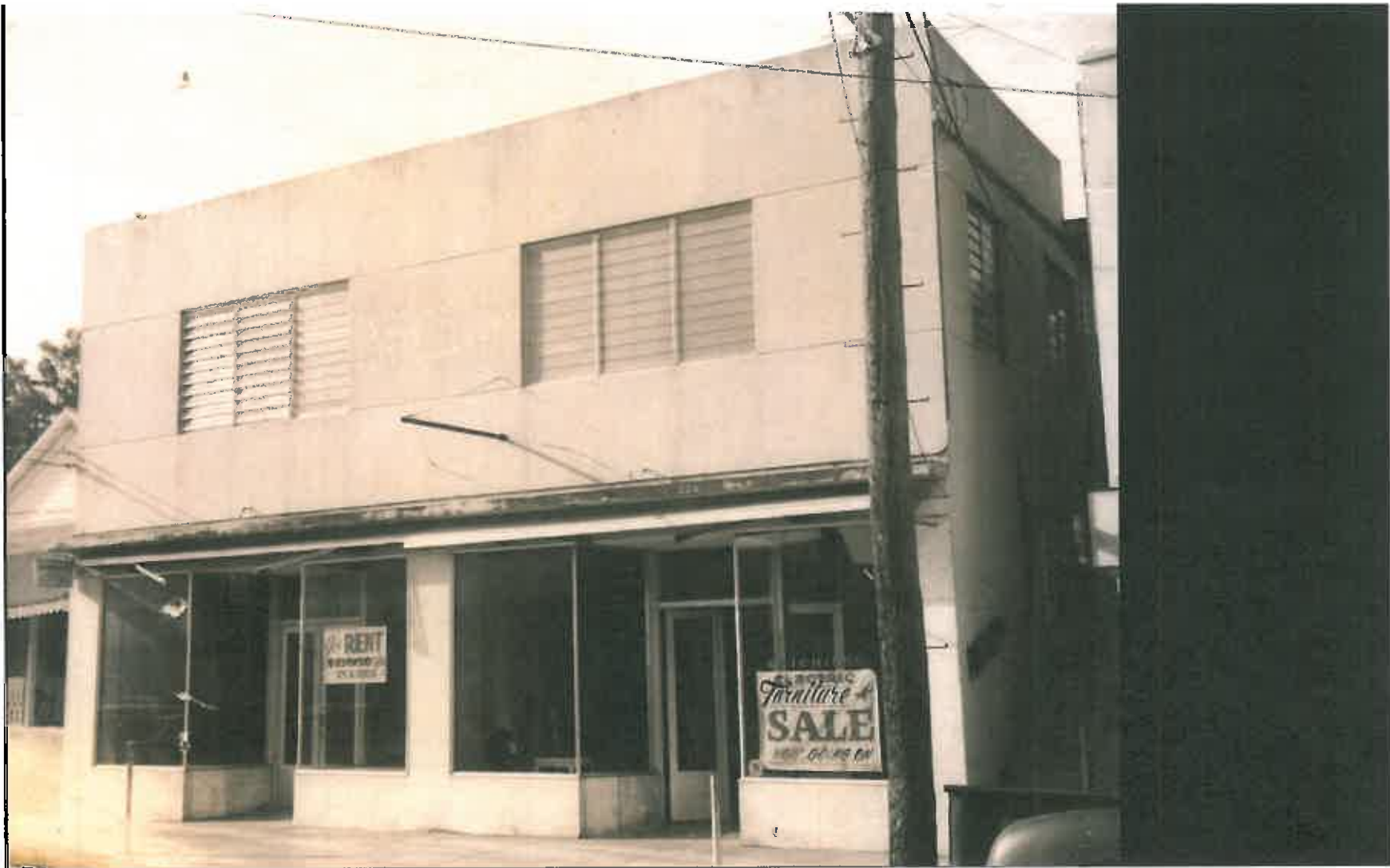
The building at 824 Duval Street in the mid 1960s.