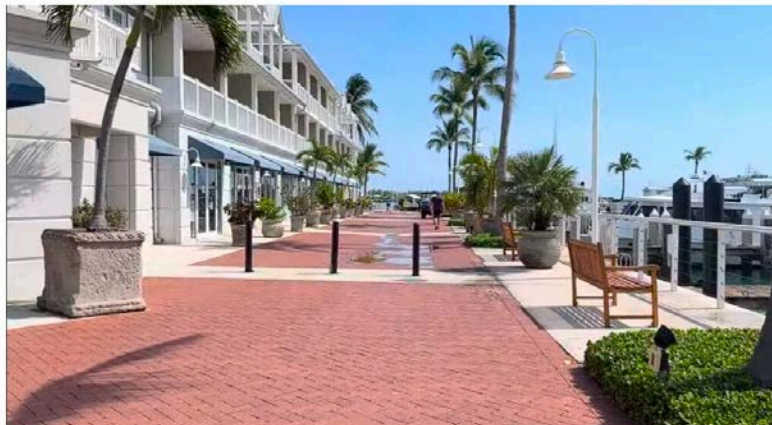
WALKING THROUGH THE HISTORIC SEAPORT WAS A BEAUTIFUL EXPERIENCE

I then made my way to the Historic Seaport , a picturesque area with a charming pier and several boat tours and snorkeling options. Although I didn't have time to join a tour, I enjoyed walking along the pier and soaking in the serene atmosphere. I also finished the leftover carrot cake (the portions at 'The Cafe' are generous!) on a bench facing the sea, making it the perfect snack spot!