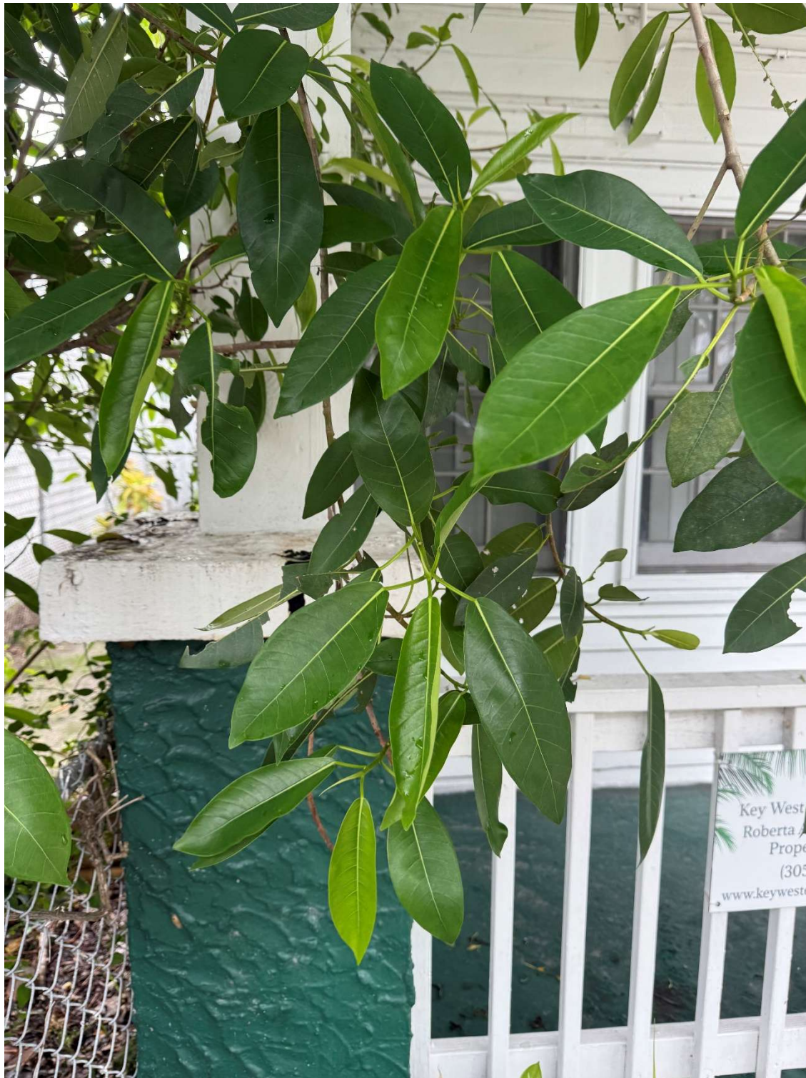
Positive ID of Stangler Fig leaf. This species of Ficus is aggressive and common to see as a volunteer tree.