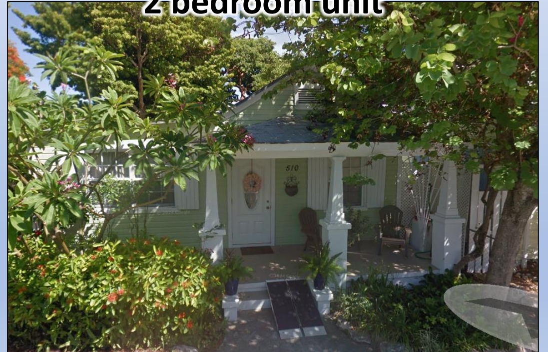
Receiver (HRCC-1) 2 bedroom unit