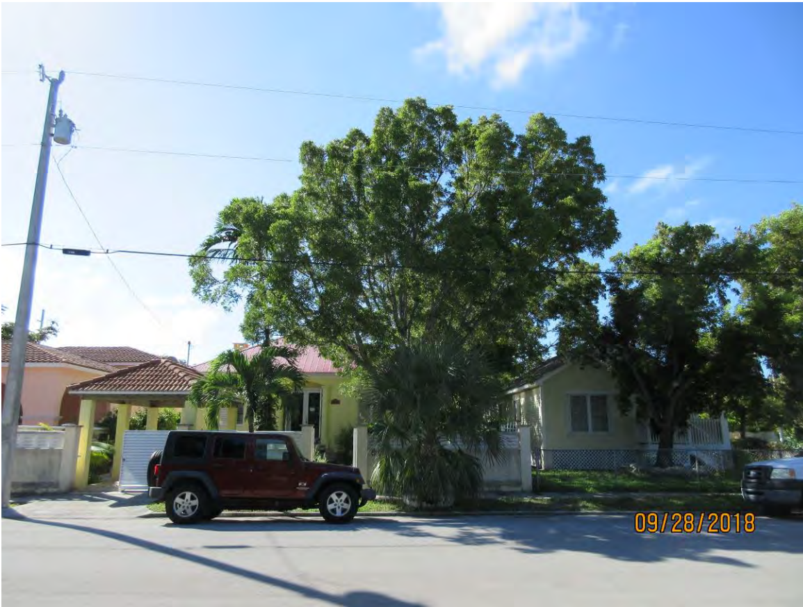
Tree Species: Mahogany (Swietenia mahagoni)