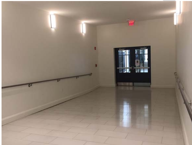
Figure 4 #5. Walkway walls (to the left of the Commission Chambers)