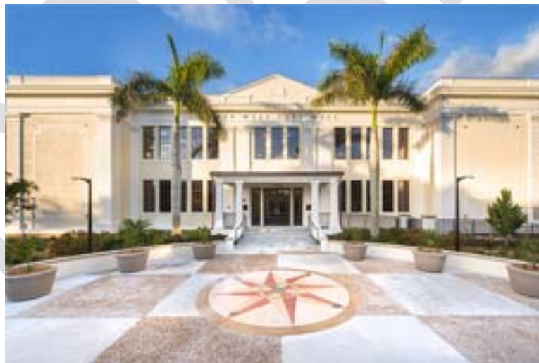
Figure 1# 1. Front Entrance - retaining wall