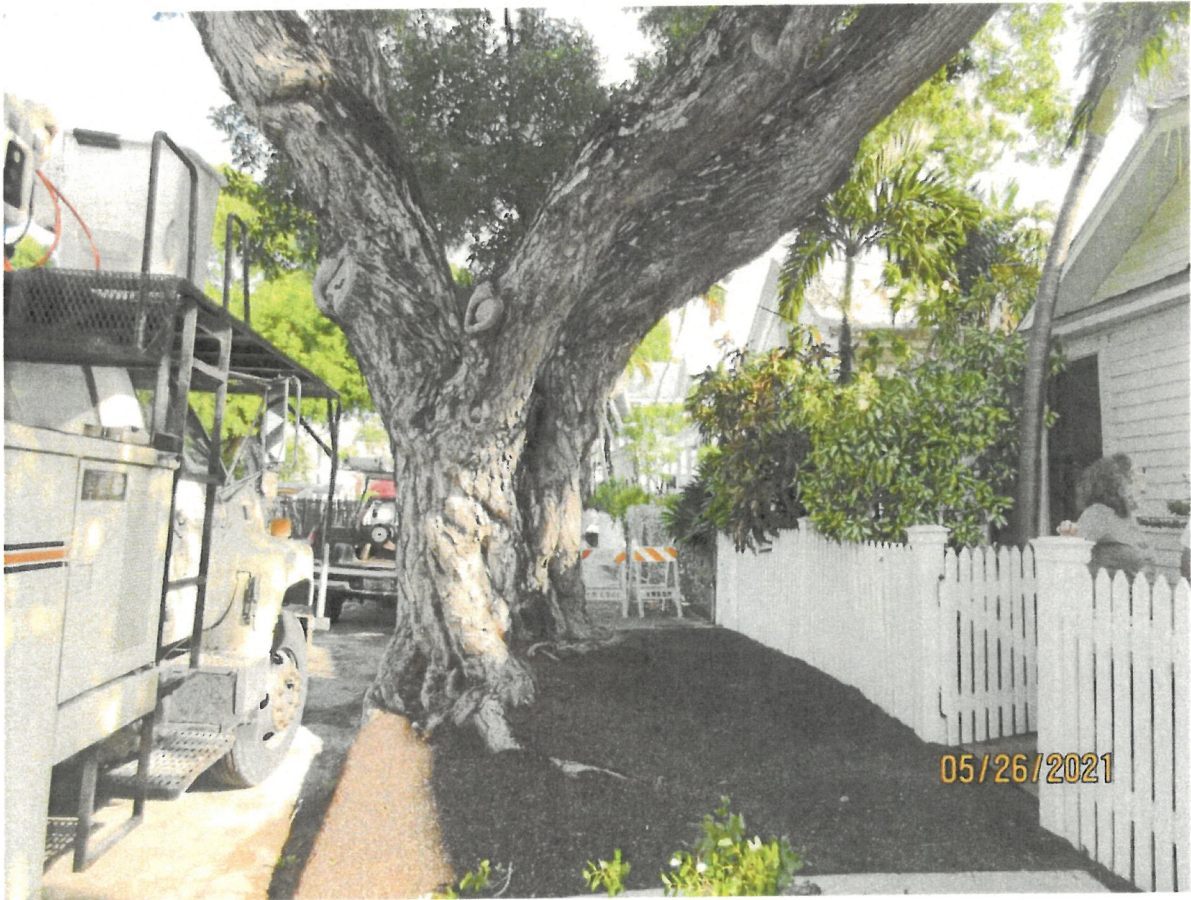
Photo #2- photo of base of tree on day of trimming. Large branches on right side of photo of main concern to property owners.