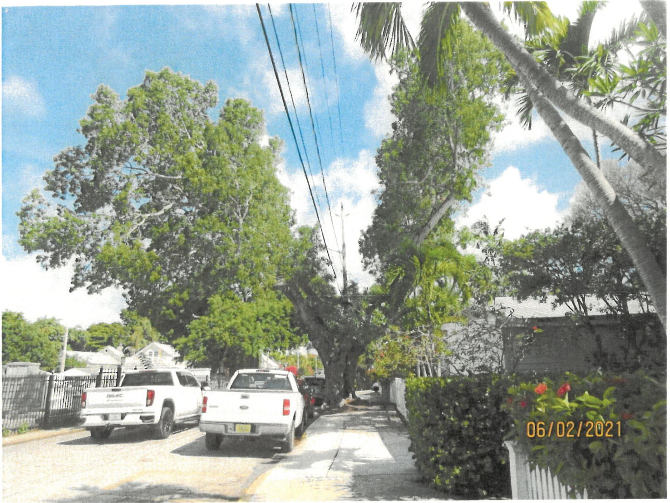
Photos #17 – View of whole tree canopy after trimming. Community Services will need to trim/lift branches on street side.