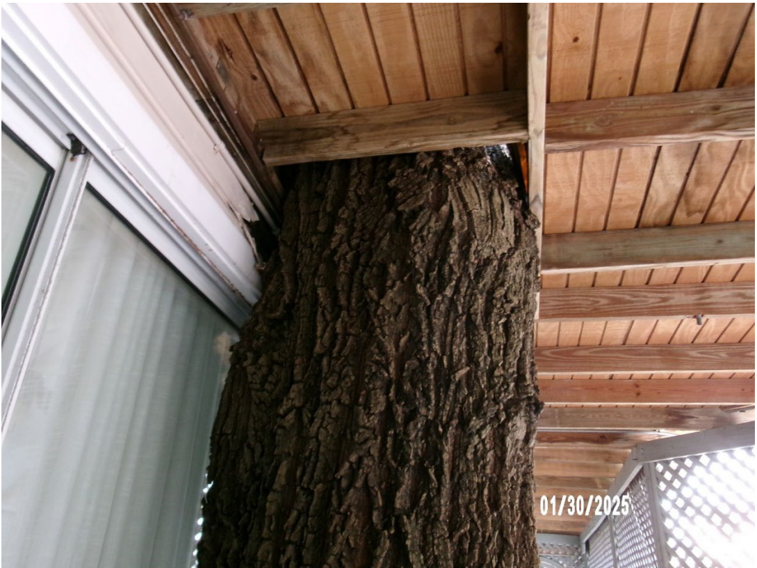
Three photos showing tree location in relation to structure, views 1, 2, & 3.