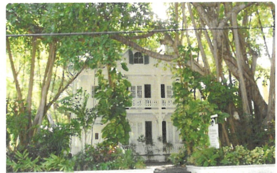
AK 8709803 6/24/2010 Banyan Tree of Key West

Parcel ID 00004530-000100 Account# 8709803 Property ID 8709803 Millage Group 10KW Location 323 WHITEHEAD St, KEY WEST Address Legal Description KW THE BANYAN TREE OF KEY WEST IV A TIME SHARE RESORT PT LOT 4 SQR 25 G24-44 OR597-797/800 OR658-288/289 OR662-863/865 OR690-742/743 OR752-198/204 OR752-793/799 OR870-979/980 OR877-1754/1755 OR942-653/723 OR942-968/970 OR1210-599/608(CERT) OR1210-728/780AMD OR1249-1294/95AMD (Note: Not to be used on legal documents.) Neighborhood 8962 Property Class TIMESHARE (3905) Subdivision Sec/Twp/Rng 06/68/25 Affordable No Housing