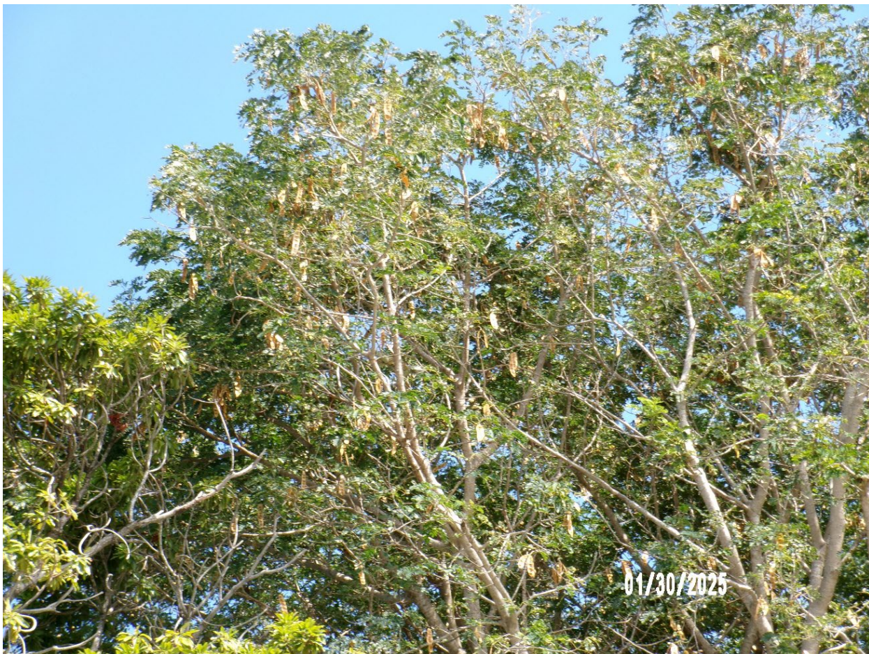
Two photos of tree canopy, views 3 & 4.