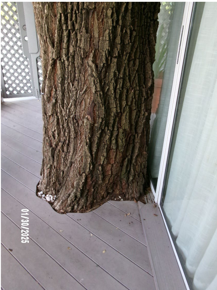
Three photos showing tree location in relation to structure, views 4 & 5.