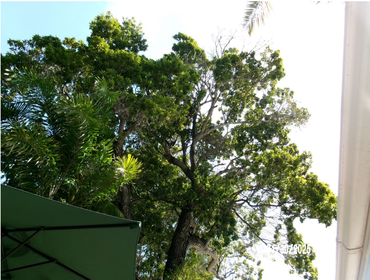
Two photos of tree canopy, views 1 & 2.