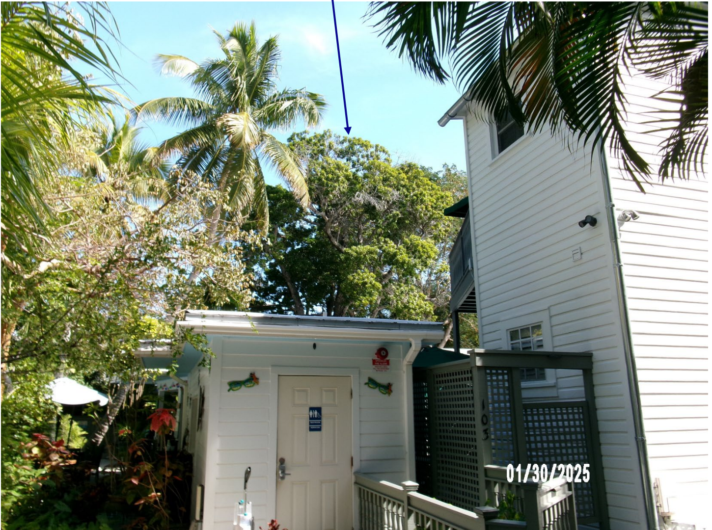
Photo showing location of tree from front gate