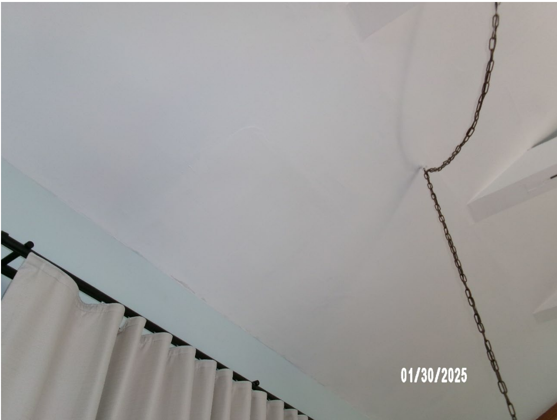
Photo showing repair work area done inside the structure.