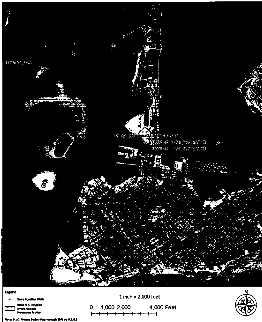
Figure. 1. Location Map