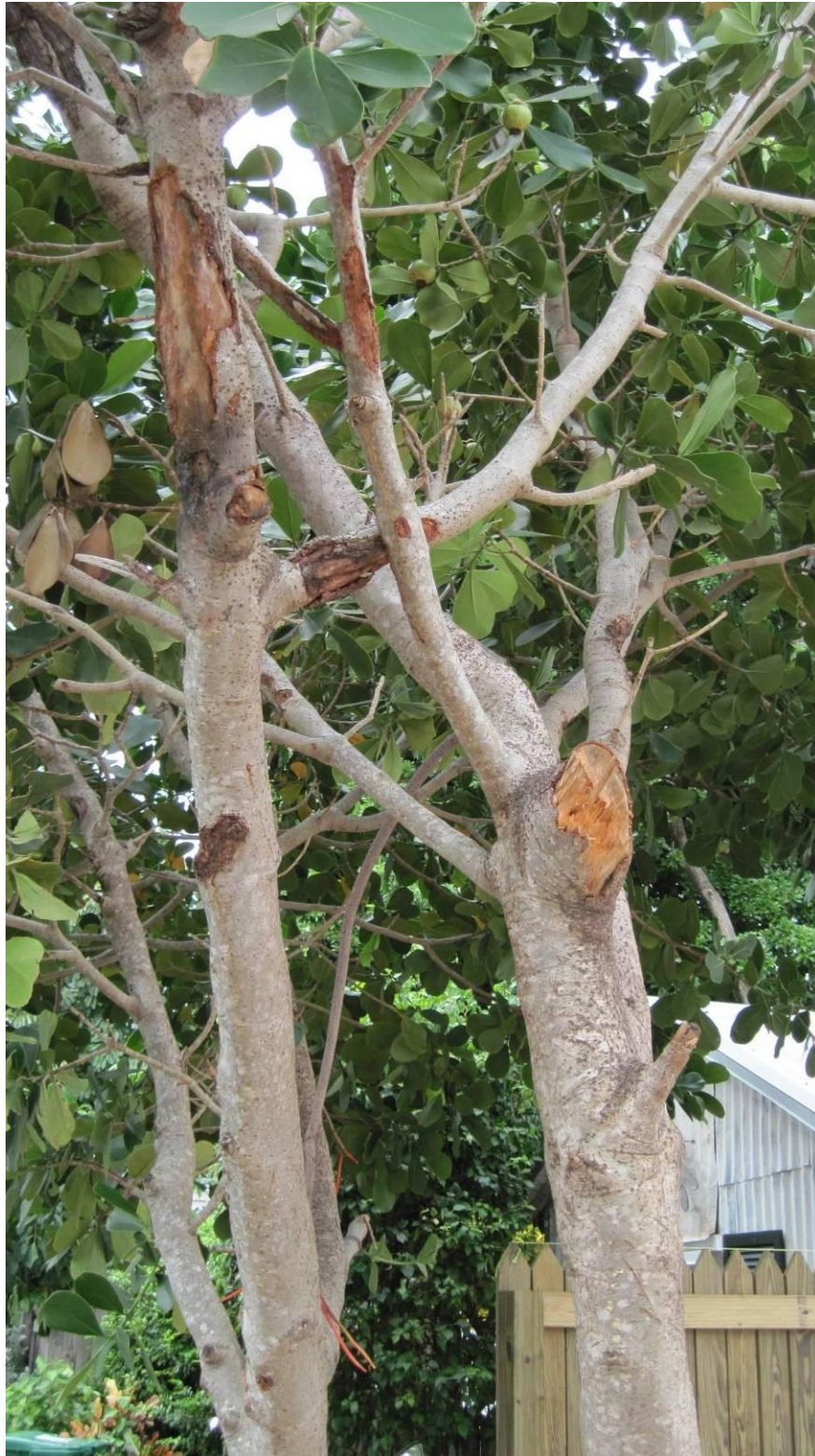
Close up of same area.