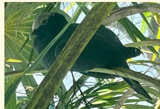
(photo above) White-crown pigeon outside the window at the Key West Gato Building

With World Migratory Bird Day just around the corner (May 13) I thought I would take some time to highlight a beautiful bird I learned to admire by simply glancing out the window of the Historic Gato Building in Key West. As I walked past the tall, former cigar factory windows, I saw what appeared to be a standard grey pigeon right near the glass, perched in a tree. Upon further inspection of the bird, I noticed this pigeon had white feathers on the top of its head, interesting! I thought to myself. So, I went back to my office and did some googling and discovered it was a white-crowned pigeon. A beautiful migratory bird that clearly, I knew very little about. This interesting bird staring back at me absolutely fascinated me, I had never seen one in the Keys before! I decided to do some research on my newfound feathered friend. And what I discovered was a fast, secretive and truly remarkable traveler that flies to some of the best tropical destinations around.