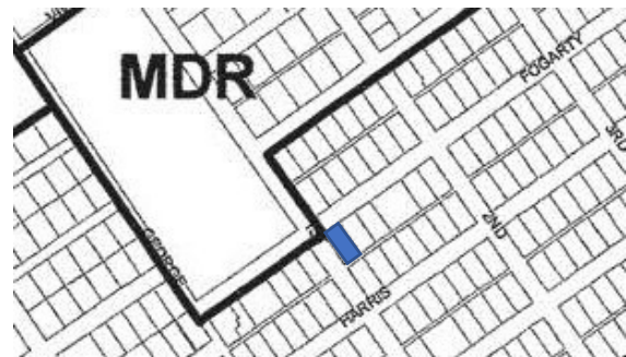
Zoning map of the subject property