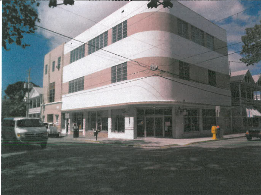
Front View (2/25/14)

If using the Elevation Certificate to obtain NFIP flood insurance, affix at least 2 building photographs below according to the instructions for Item A6. Identify all photographs with date taken; "Front View" and "Rear View"; and, if required, "Right Side View" and "Left Side View." When applicable, photographs must show the foundation with representative examples of the flood openings or vents, as indicated in Section A8. If submitting more photographs than will fit on this page, use the Continuation Page.