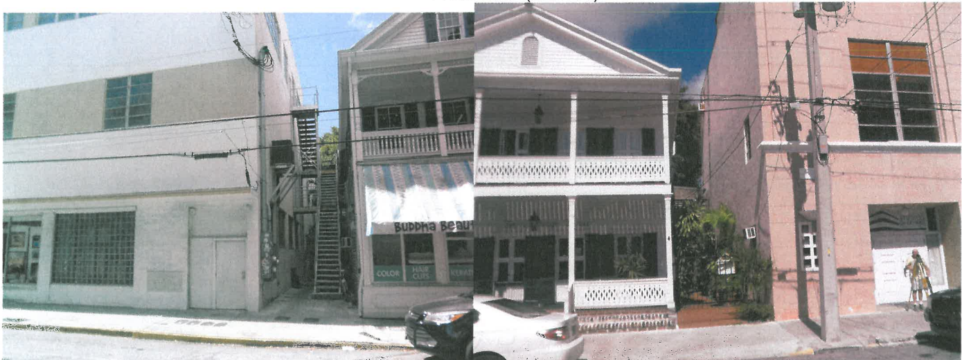
Side View off Simonton (2/25/14)